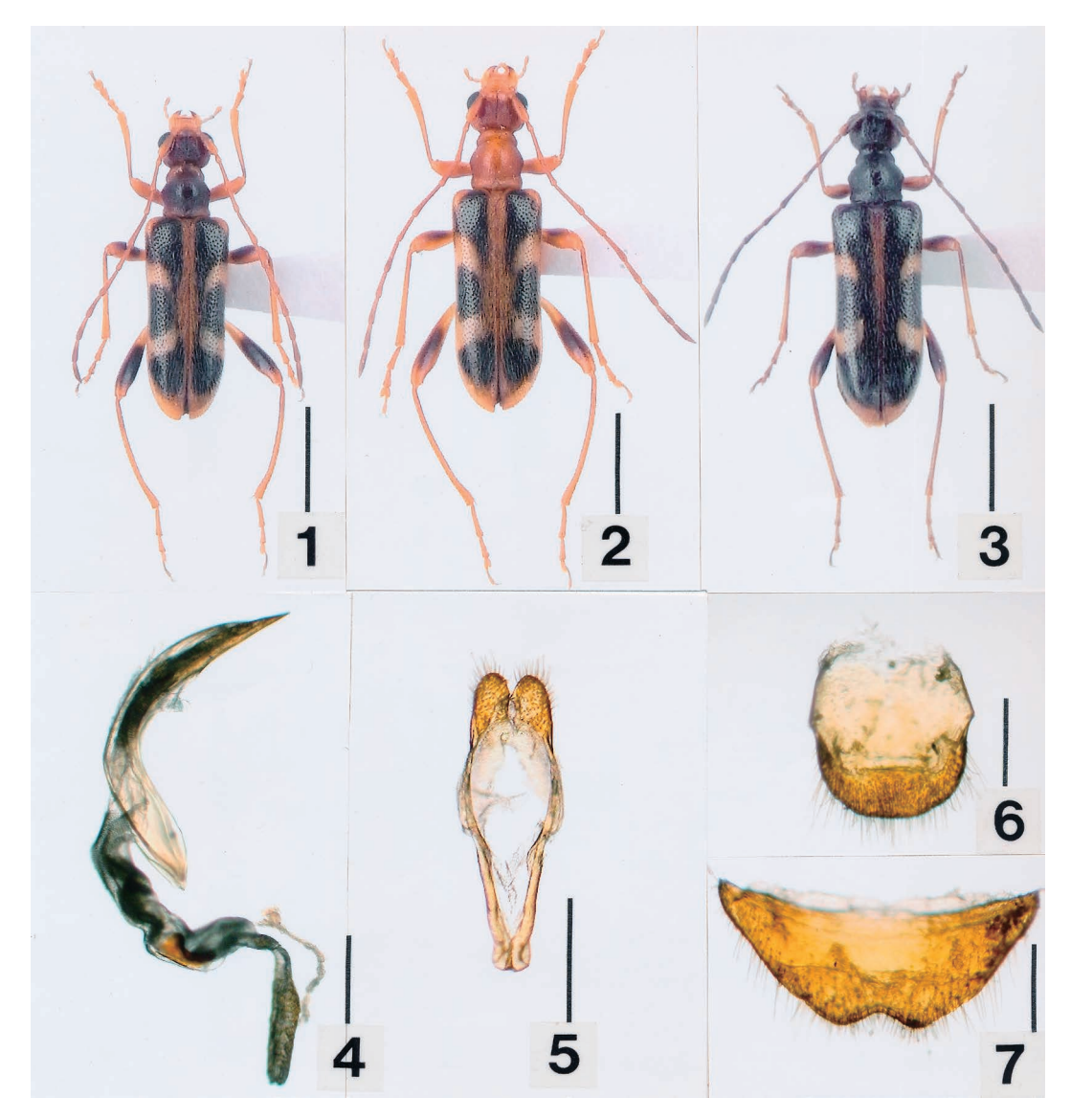
Figs. 1–7. Pidonia (Omphalodera) nakabayashii Kuboki, sp. nov., from Mt. Misen, Nara Prefecture. ——1 & 2, Male habitus; 3, female habitus; 4, median lobe of male genitalia; 5, tegmen of male genitalia; 6, eighth tergite of male; 7, seventh sternite of male. Scale bars: 3 mm for Figs. 1–3, 0.3 mm for Figs. 4–7.

General colour reddish brown to black and furnished with pale fulvous pubescence. Head reddish brown to black; vertex darkened; mouthparts fulvous to brown except for reddish brown apex of each mandible; eyes black; temples reddish brown; antennae largely yellowish brown, sometimes apical five segments slightly darkened apicad. Prothorax variable among reddish to dark brown, both apex and base yellowish to reddish brown. Scutellum reddish fulvous. Legs yellowish brown, sometimes femora brown apically; apex of each tarsus weakly darkened; claws yellowish brown. Elytra blackish brown with two pairs of arcuate whitish fulvous markings at basal 1/3 and at apical 1/3; vittae along suture narrowly reddish brown; humeral angle of each elytron reddish brown; apex of each elytron