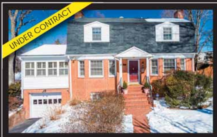
N. ARLINGTON • $1,199,000 Fabulous Three-Story Addition • One Light to D.C.