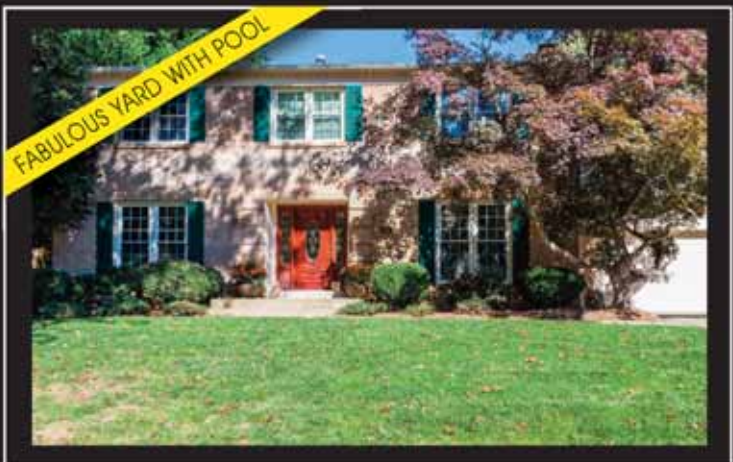
VIENNA • $925,000 Beautifully Renovated • Minutes to Tysons