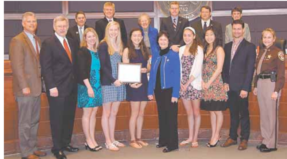
Fairfax County Board of Supervisors honored Langley High School's girls swim and dive team on Tuesday, April 7.

proud he was of them. "I will always bet on you because it is your sixth state championship and that is really amazing."