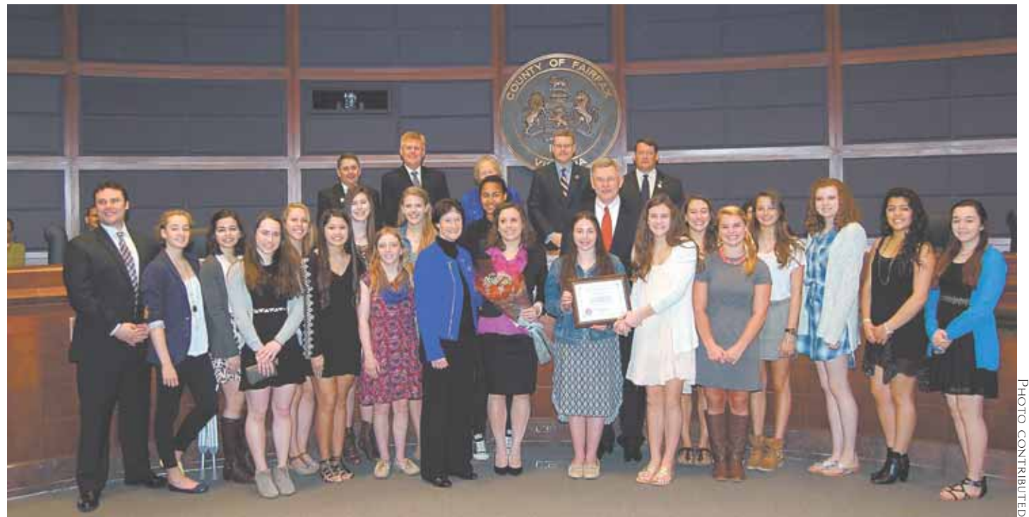
Fairfax County Board of Supervisors honored McLean High School's girls gymnastics team on Tuesday, April 7.

"Great job ladies. I'm so proud of you on everything you have accomplished this