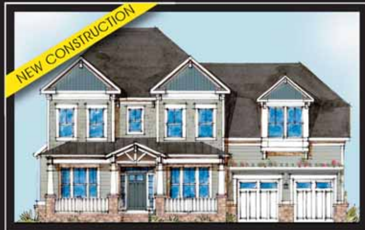
McLEAN • $1,725,000 June Delivery • Walk to Churchill ES