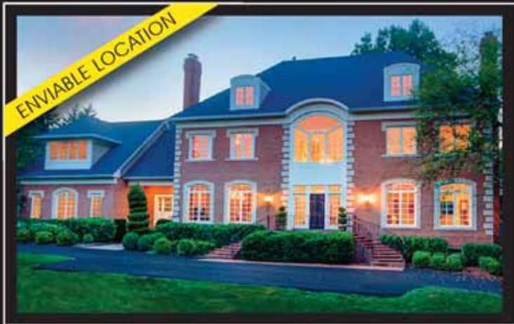
McLEAN • $3,695,000 Stunning, Elegant & Park-like Yard with Pool