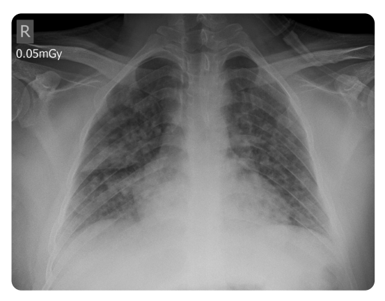
Figure 1. Initial chest X-ray. Alveolar occupation opacities, non-confluent, involving both lung fields.

A chest X-ray was taken with the finding of non-confluent alveolar opacities that compromised the patient, and a chest CT scan was performed, which showed multiple alveolar opacities of predominantly peri-bronchovascular occupation, of "patchy" distribution located in both lung fields, some surrounded by "ground-glass" halo, with a tendency to consolidation at the bases (Figure 2). The results of other paraclinical tests performed, HIV test, serial smear microscopy and respiratory panel (FilmArray) were negative. Two days after admission, the patient's symptoms improved significantly; the control chest X-ray showed almost complete resolution of the findings of the initial study (figure 3), so the clinical picture was considered compatible with high-altitude pulmonary edema.