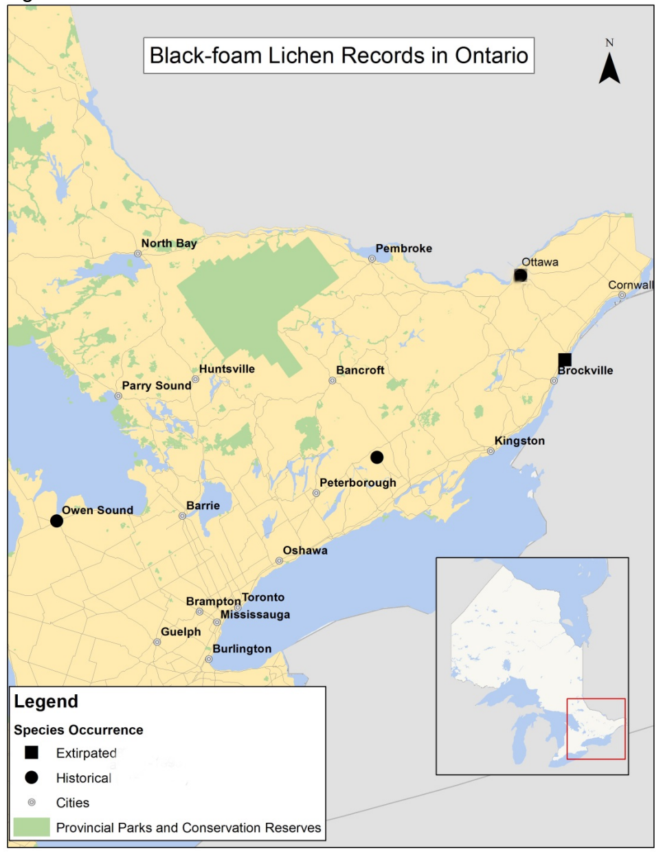
Figure 1. Black-foam lichen records in Ontario.

The NHIC considers the Black-foam Lichen to be "historical" in Ontario (SH). This is due in part to the recently discovered collection from Owen Sounds, hundreds of kilometres to the west of other sites, and the possibility that there are additional areas of unsurveyed potential habitat. Wong (1992) considers this lichen "very rare, [and] probably extinct in our region [i.e. southern Ontario]."