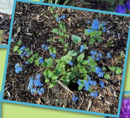
Candice's garden hums with the blues