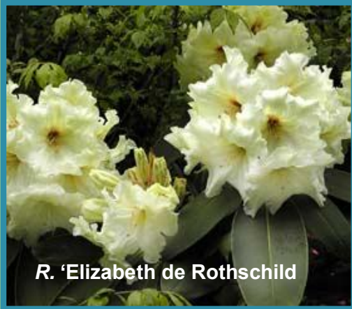
R. 'Elizabeth de Rothschild'