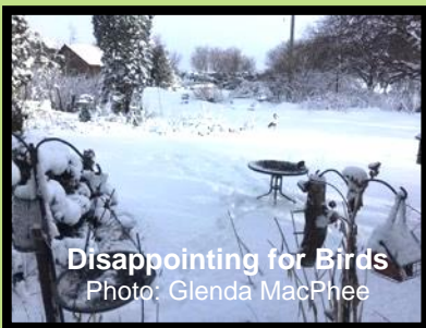
Disappointing for Birds

“Spring is a little late in coming this year”