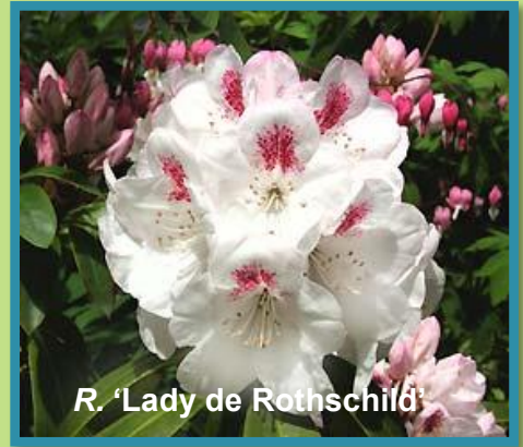
R. 'Lady de Rothschild'