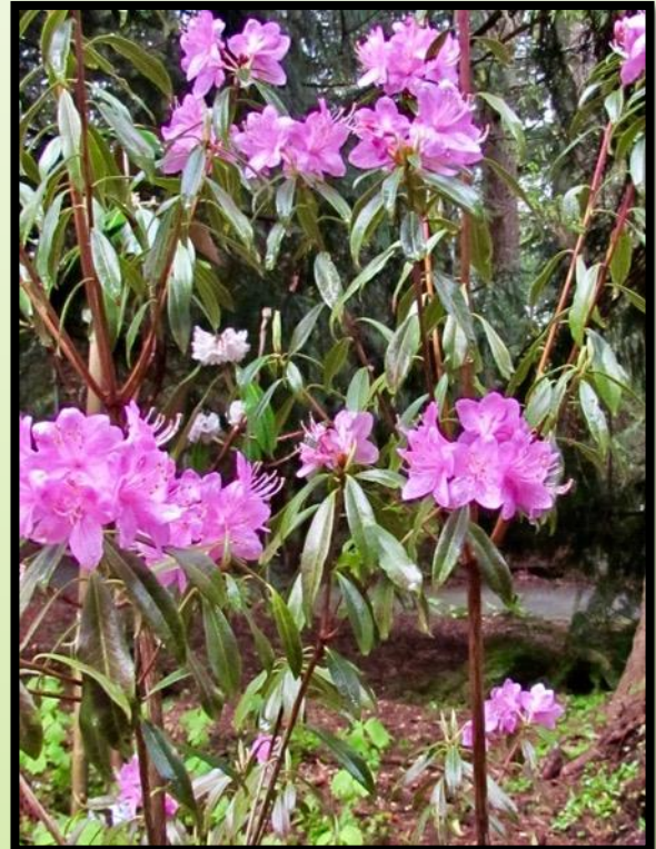
Rhododendron davidsonianum 'Ruth Lyons'