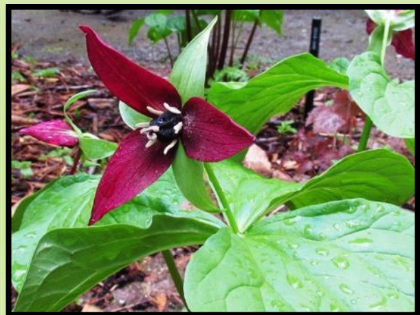
Lovely companion plants form drifts around the species rhododendrons