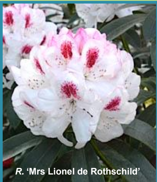
R. 'Mrs Lionel de Rothschild'