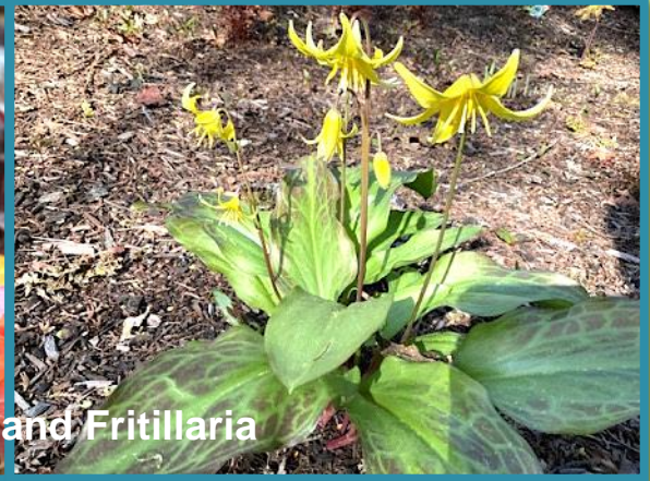
Companion plants: Huechera and Fritillaria