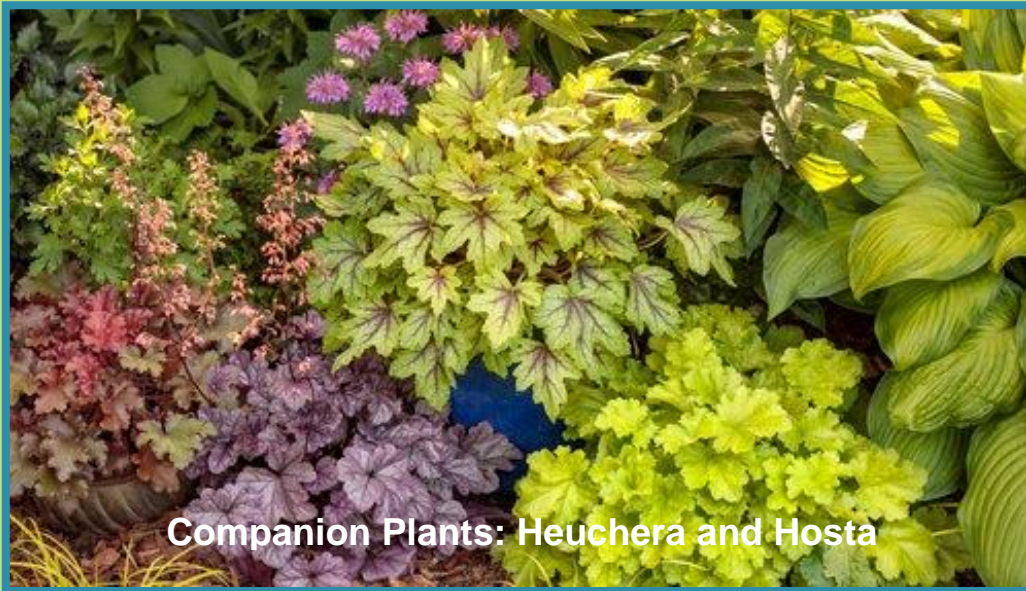
Companion Plants: Heuchera and Hosta