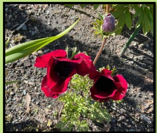
Candice's tulips and anemones