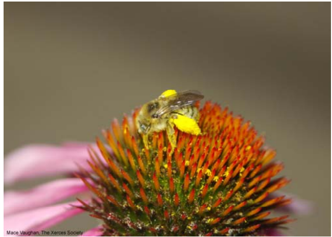
Native bee on purple coneflower.

The plants suggested below are all commonly available garden plants. These species will generally do best in a full sun location and may require supplemental irrigation and fertilization. Establishment of perennial plants may take a few years, but they will often last for an extended period of time. One strategy is to plant annual and perennial garden plants together, with the annual plants providing immediate benefits the first year, while the perennial plants become established.