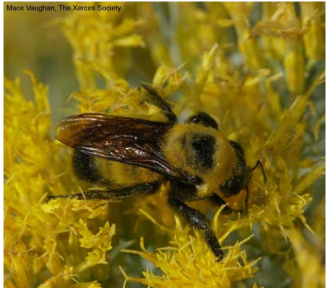
Bumblebee on goldenrod

Habitat enhancement for native pollinators on farms, especially with native plants, provides multiple benefits. In addition to supporting