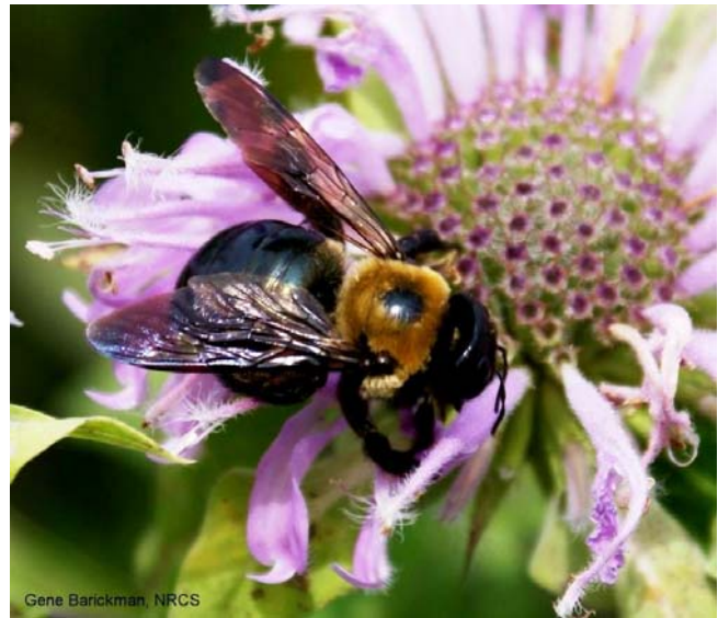
Carpenter bee on bergamot

Keep in mind that small bees may only fly a couple hundred meters, while large bees, such as bumble bees, easily forage a mile or more from their nest. Therefore, taken together, a diversity of flowering crops, wild plants on field margins, and plants up to a half mile away on adjacent land can provide the sequentially blooming supply of flowers necessary to support a resident population of pollinators.