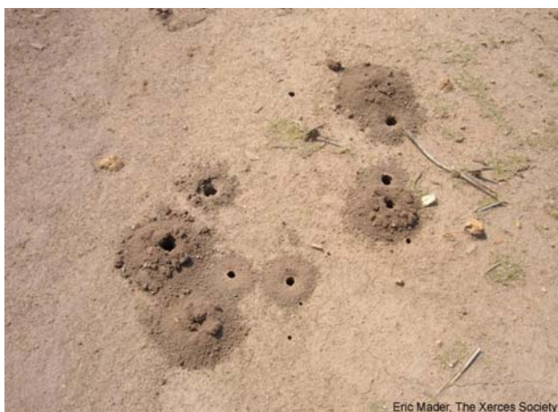
Entrances to these ground nesting bee nest resemble ant hills but have larger entrances.

Weed control alternatives to tillage include the use of selective crop herbicides, flame weeders, and hooded sprayers for between row herbicide applications.