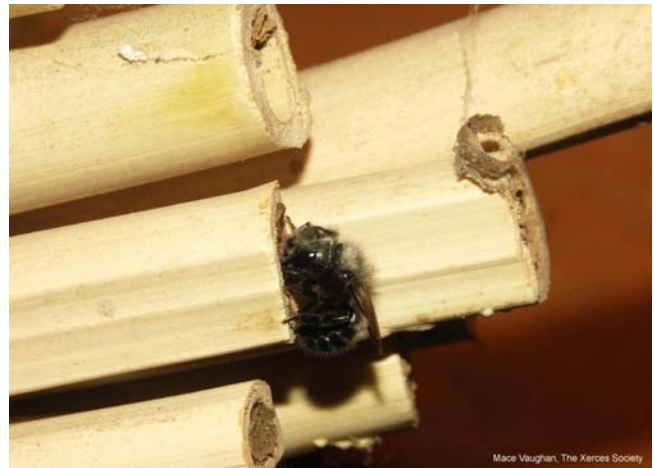
A mason bee closing the entrance to her nest with mud after laying a series eggs in the tube.

While in most cases native plants are preferred, non-native ones may be suitable for some applications, such as annual cover crops, buffers between crop fields and adjacent native plantings, or short-term low cost insectary plantings that also attract beneficial insects which predate or parasitize crop pests. For more information on suitable non-native plants for pollinators, see the tables 3 and 4.