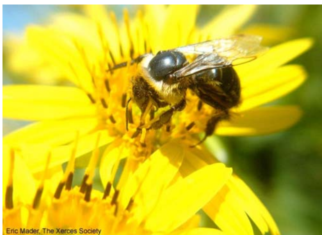
Sunflowers are a prolific summer bee plant for Illinois.

Similarly, is the new habitat located near existing pollinator populations that can “seed” the new area? For example, fallow areas, existing wildlands, or unmanaged landscapes can all make a good starting place for habitat enhancement. In some cases these areas may already have abundant nest sites, such as fallen trees or stable ground, but lack the floral resources to support a large pollinator population. Be aware of these existing habitats and consider improving them with additional pollinator plants or nesting sites.