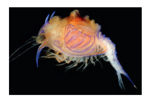
Figure 1. Cerataspis monstrosa (median carapace length 11.8 mm), the 'monster' larva that has remained unlinked to an adult form for 184 years. The photographed and analyzed specimen was collected on July 2 2009 in the northeastern Gulf of Mexico over a depth of 420 m at 27°05.996'N, 86°25.916'W during mid-water trawl collection by cruise participants aboard NOAA Ship Gordon Gunter.

studies of gut contents of its predators, including skipjack (Katsuonus pelamis), yellowfin (Thunnus albacares) and blackfin (T. atlanticus) tuna, and dolphin (Coryphaena hippurus) (Morgan et al. 1985). Interpretations of its unusual morphology have to date suggested it might represent the larval counterpart of some abyssal adult, the proposed candidates being a yet-to-be discovered shrimp from the family Aristeidae (Penaeoidea), or perhaps even a more distant relative of penaeoids (Heegaard 1966; Osborn et al. 2009; Hubert et al. 2010). Wild-caught planktonic larvae are often collected and reared to early postlarval stages in order to determine their adult identities (Gurney 1942; Rice and Williamson 1970). However, in the case of deep oceanic species, with highly metamorphic development involving striking vertical migrations between near-surface and deep-ocean waters, rearing protocols seldom succeed. In these instances, DNA data provide a common currency for comparison (Webb et al. 2006; Ahrens et al. 2007; Burns et al. 2008; Hubert et al. 2010).