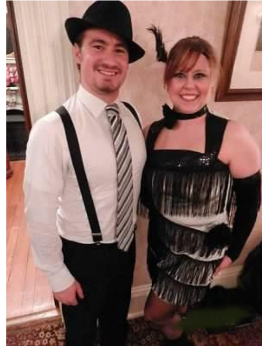
The dancers demonstrated not only dance moves but also flapper era dash and style.