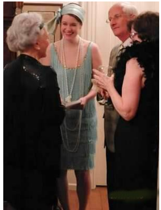
Attendees mix and mingle in all their 1920’s finery.