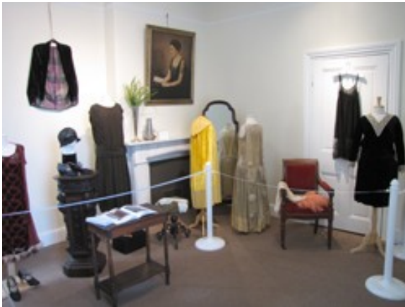
Harris-Cameron Mansion. Admission is free to HSDC members.

Women's Fashions of the 1920s is the current exhibit at the Mansion and occupies two newly-created exhibit spaces on the second floor. The exhibit contains clothing from the collection of the Shippensburg University Fashion Archives (SUFAM), which is cosponsoring the exhibit with HSDC.