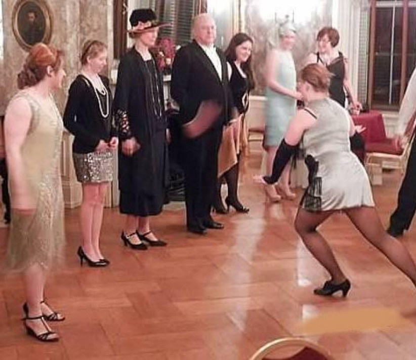
A dancer from Arthur Murray Studios demonstrates a dance move during “Puttin’ on the Ritz” at the Mansion on April 6th. The event was the 2013 model of the Historical Society of Dauphin County’s annual Blast from the Past spring fundraiser and had a 1920’s theme.