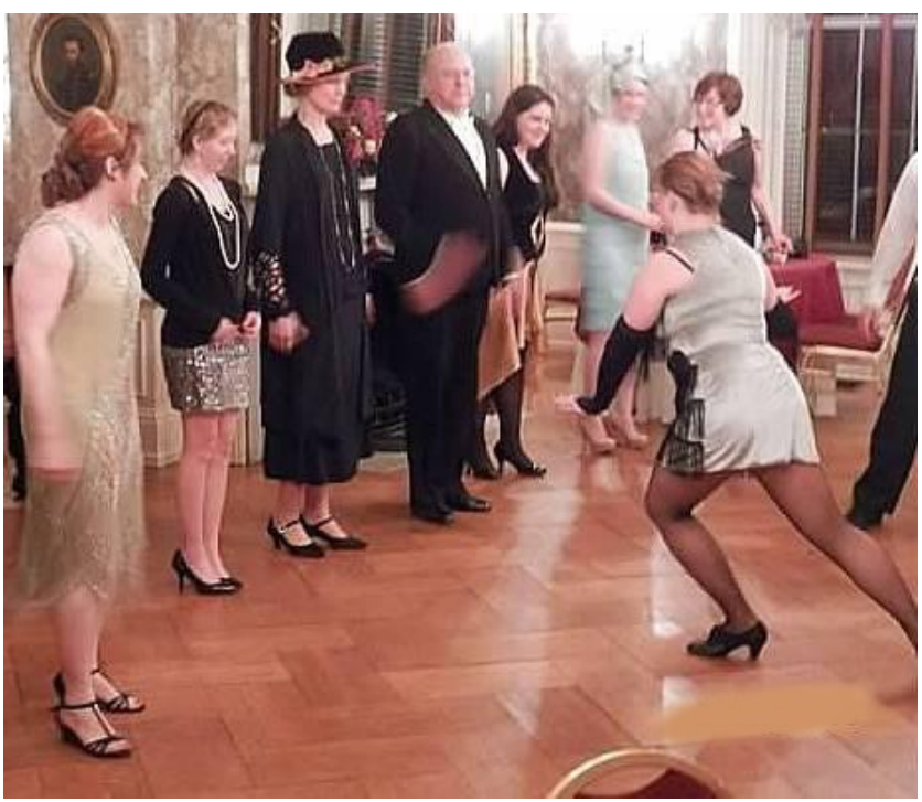
A dancer from Arthur Murray Studios demonstrates a dance move during "Puttin' on the Ritz" at the Mansion on April 6th. The event was the 2013 model of the Historical Society of Dauphin County's annual Blast from the Past spring fundraiser and had a 1920's theme.