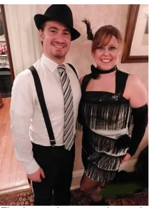
The dancers demonstrated not only dance moves but also flapper era dash and style.