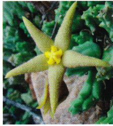
Carrion flower ( Piaranthus geminatus )