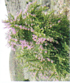
Spekboom ( Portulacaria afra )