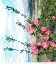
Chinese lantern bush ( Nymannia capensis )