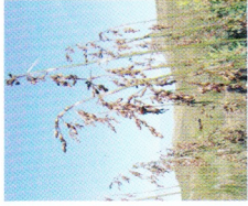
Restios ( Rhodocoma arida )