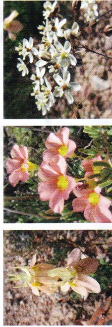
Moraea gawleri Sorrel ( Oxalis obtusa ) Muggiegas ( Pharmaceum auranthum )

An interesting insect which appears on the koppie during spring and which is an important pollinator of Pelargonium tetragonum , Tritonia bakeri and other long tube-flower types – is a special horse fly with a very long proboscis.