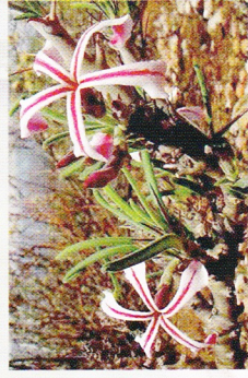
Dikvoet ( Pachypodium succulentum )