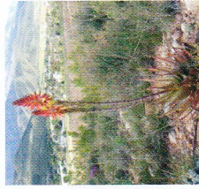
Aloe ( Aloe microstigma )

A handful of plant species that grow on the De Rust koppie are found only here and nowhere else on earth! They are called endemics and include: Bulbine (miniature 'koppieva'), Morea regalis (small blue iris), Syringodea destutensis (small crocus), Pelargonium sp.nov (small geranium) and Haworthia bayeri (window succulent).