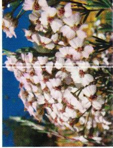
Wild rosemary ( Eriocephalus africanus )