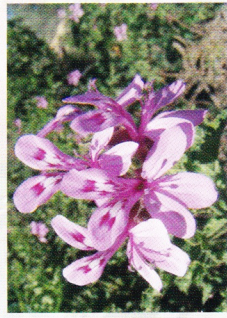
Wild geranium ( Pelargonium glutinosum )