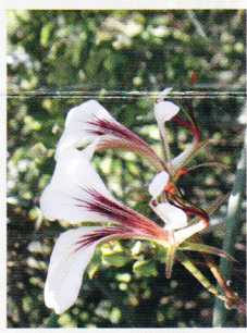
Wild geranium ( Pelargonium tetragonum )