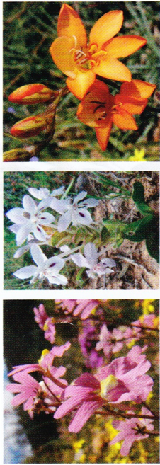
Nemesis versicolor Lapeirousia pyramidalis Tritonia securigera

An interesting insect which appears on the koppie during spring and which is an important pollinator of Pelargonium tetragonum , Tritonia bakeri and other long tube-flower types – is a special horse fly with a very long proboscis.