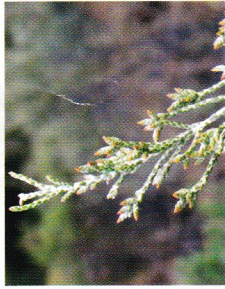
Renosterbos ( Elytropappus rhinocerotis )