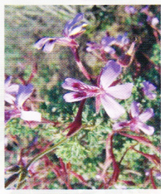
Wild geranium ( Pelargonium exstipulatum )