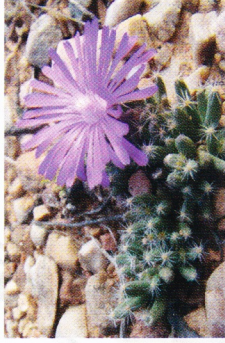
Vygie ( Trichodiadema burgeri )