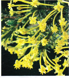
Struthiola ( Struthiola eckloniana )