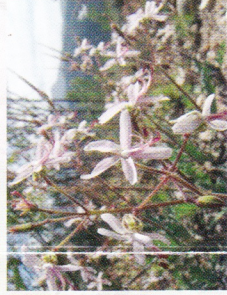
Wild geranium ( Pelargonium carnosum )