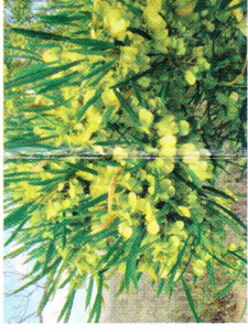
Sand olive ( Dodonea viscosa )