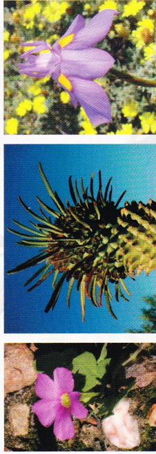
Sorrel ( Oxalis annae ) Tulip ( Moraea bipartita )

Have a look at your plant plot for a great variety of plant life forms such as the annuals (e.g. daisies and nemesias). See whether you can spot the bulbous plants e.g. Tritonia , Lapeirousia , Moraea and Oxalis ) special little shrubs e.g. Muggiegas ( Pharmaceum ) and a succulent such as 'Volstruisnek' ( Euphorbia clandestina ).