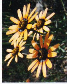
Daisy ( Ursinea anethoides )