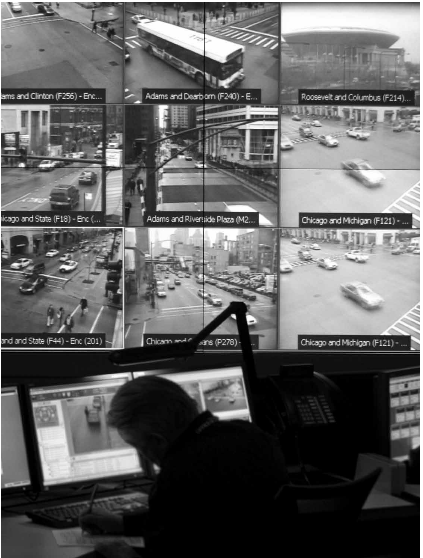
ams and Clinton (F256) - Enc...