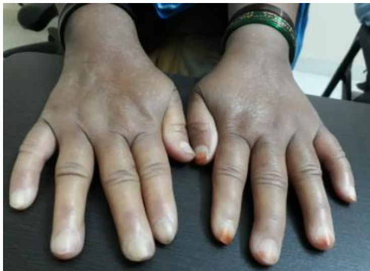
Figure 1 sclerodactyly