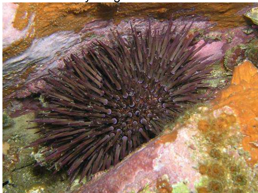
Common urchin Heliocidaris erythrogramma Her