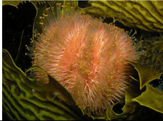
Eastern egg urchin Holopneustes purpurascens Hpu