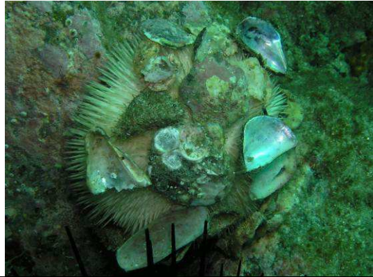
Indian sea urchin Pseudoboletia indiana Pin