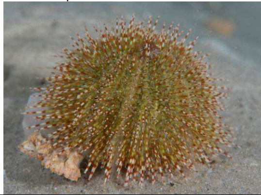
Round urchin Salmacis sphaeroides