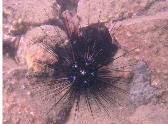
Diadem urchin Diadema savignyi Dsa