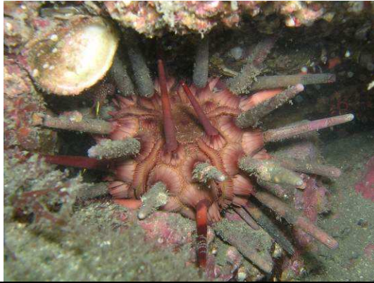
Encrusted pencil urchin Goniocidaris tubaria Gtu