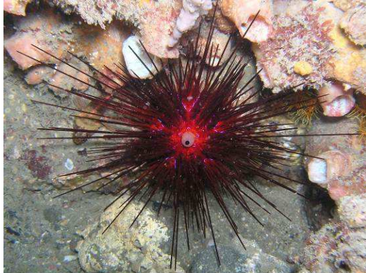
Blood diadem urchin Diadema palmeri Dpa