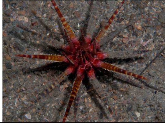
Raspy pencil urchin Prionocidaris baculosa