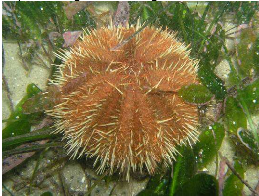
Lamington urchin Tripneustes gratilla Tgr