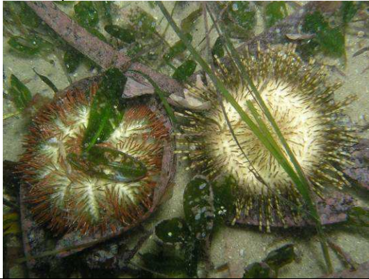
Embossed sea urchin Temnopleurus toreumaticus