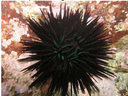
Long-spine urchin Centrostephanus rodgersii Cro