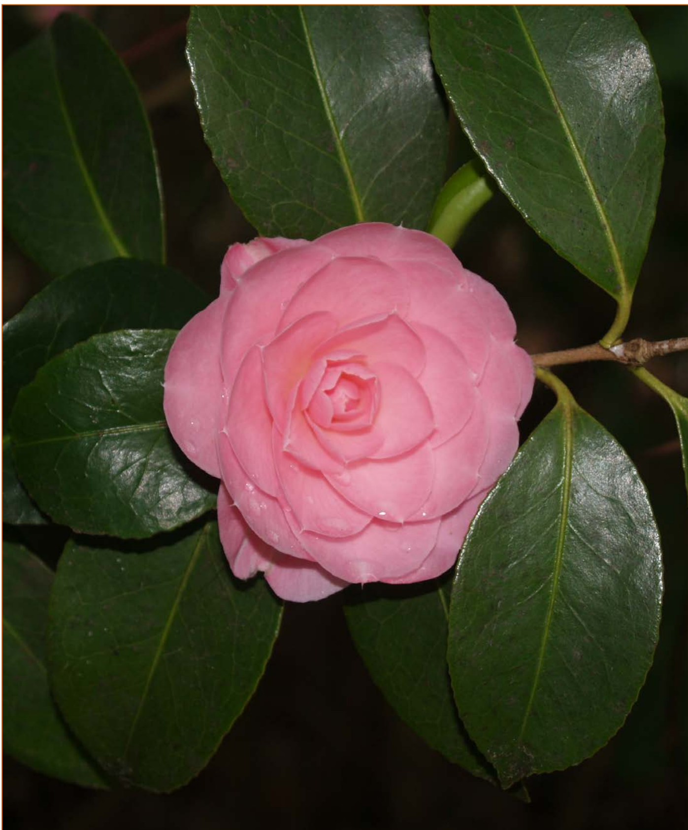
Camellia x williamsii E G Waterhouse

Appearance: Formal double fuchsia pink flowers with several rows of imbricated petals on a upright, vigorous shrub with dull green foliage.