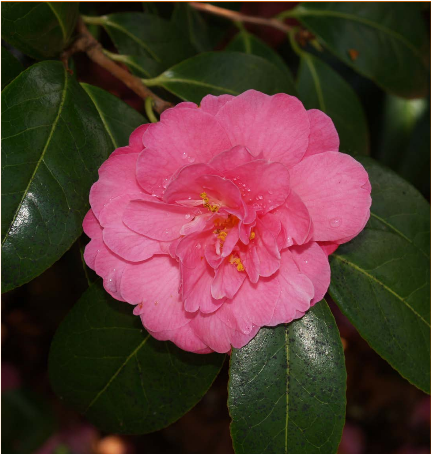
C. x williamsii 'Ballet Queen'

Notes: Upright growth makes it suited to training as a standard.