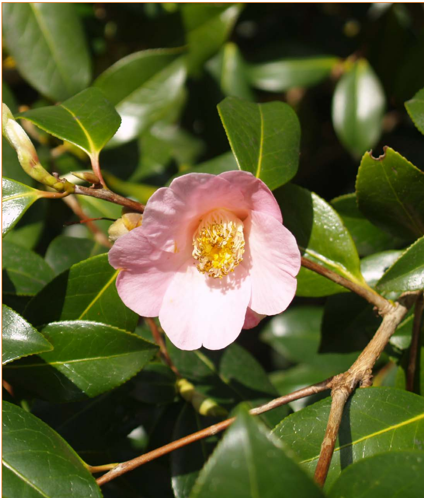
Camellia sasanqua Yuletide

Appearance: Pale pink single of 7-9 petals. Medium size. Compact growth. Originated at Caerhay's Castle, Cornwall, England.