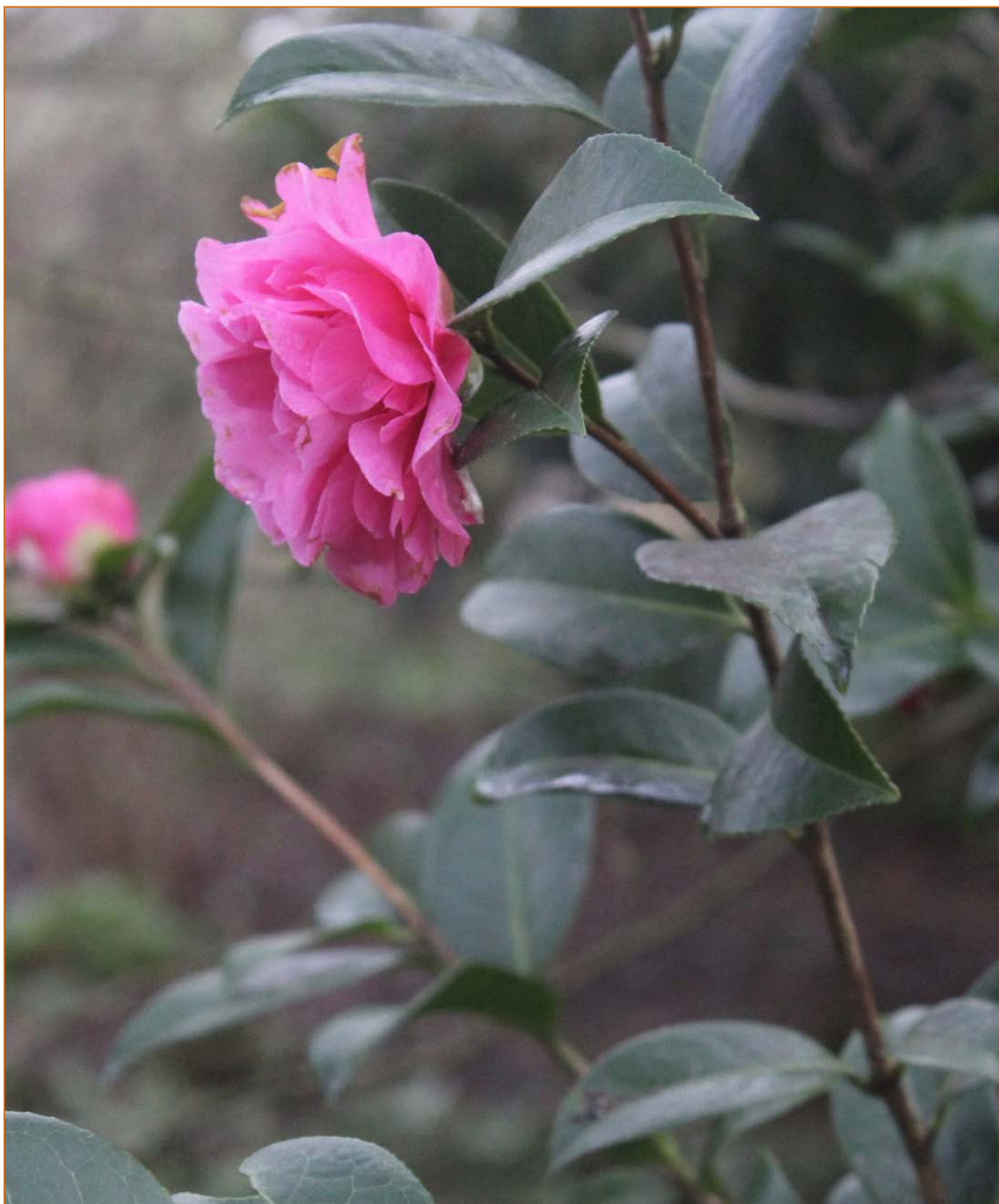
Camellia x williamsii Carnation

Appearance: Carmine - cerise pink, peony form flowers on a shrub with spreading growth.