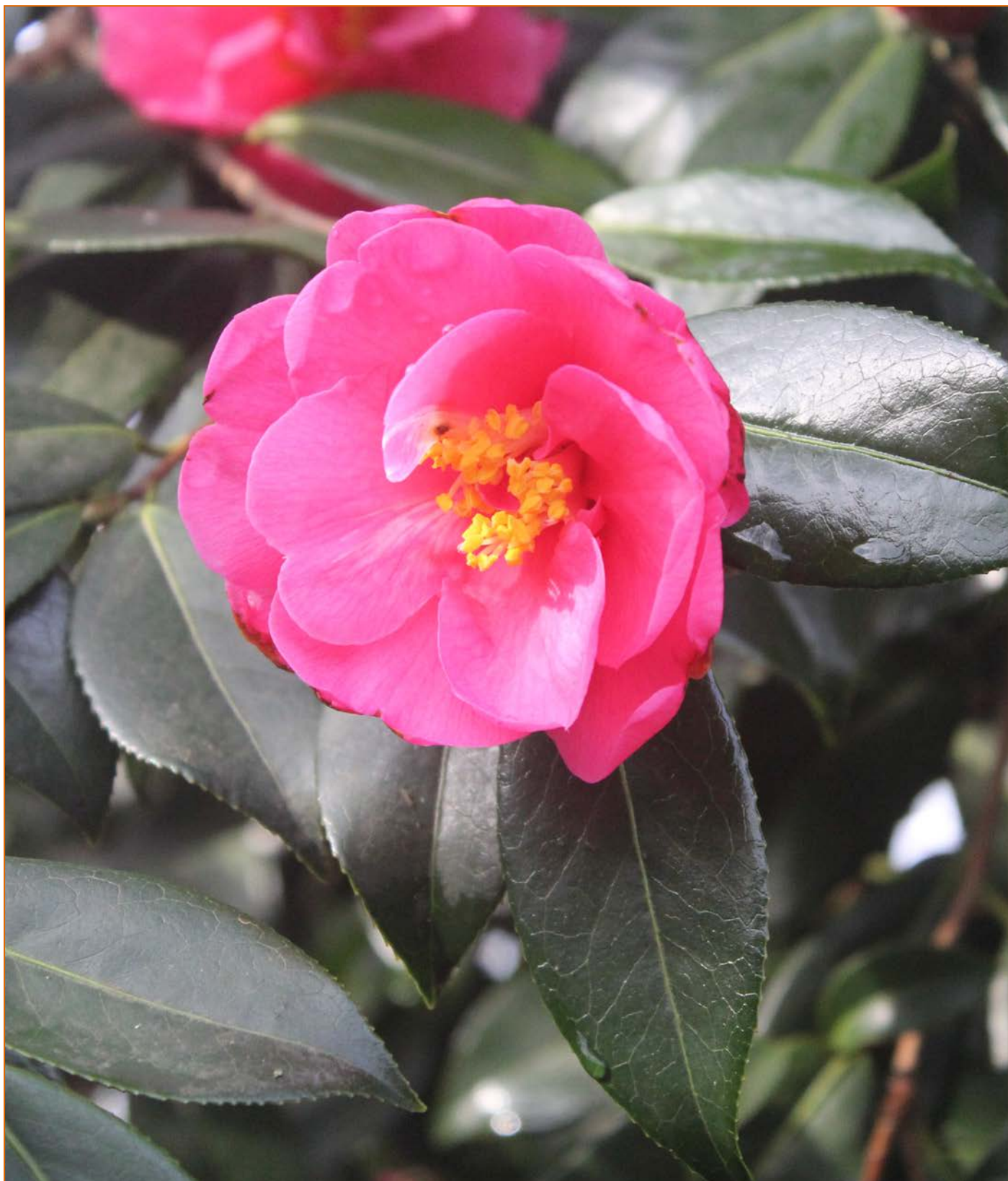
Camellia x williamsii Cheapside

Appearance: Deep rose-pink, semi-double flowers on a slightly lax, open shrub with dark green foliage.