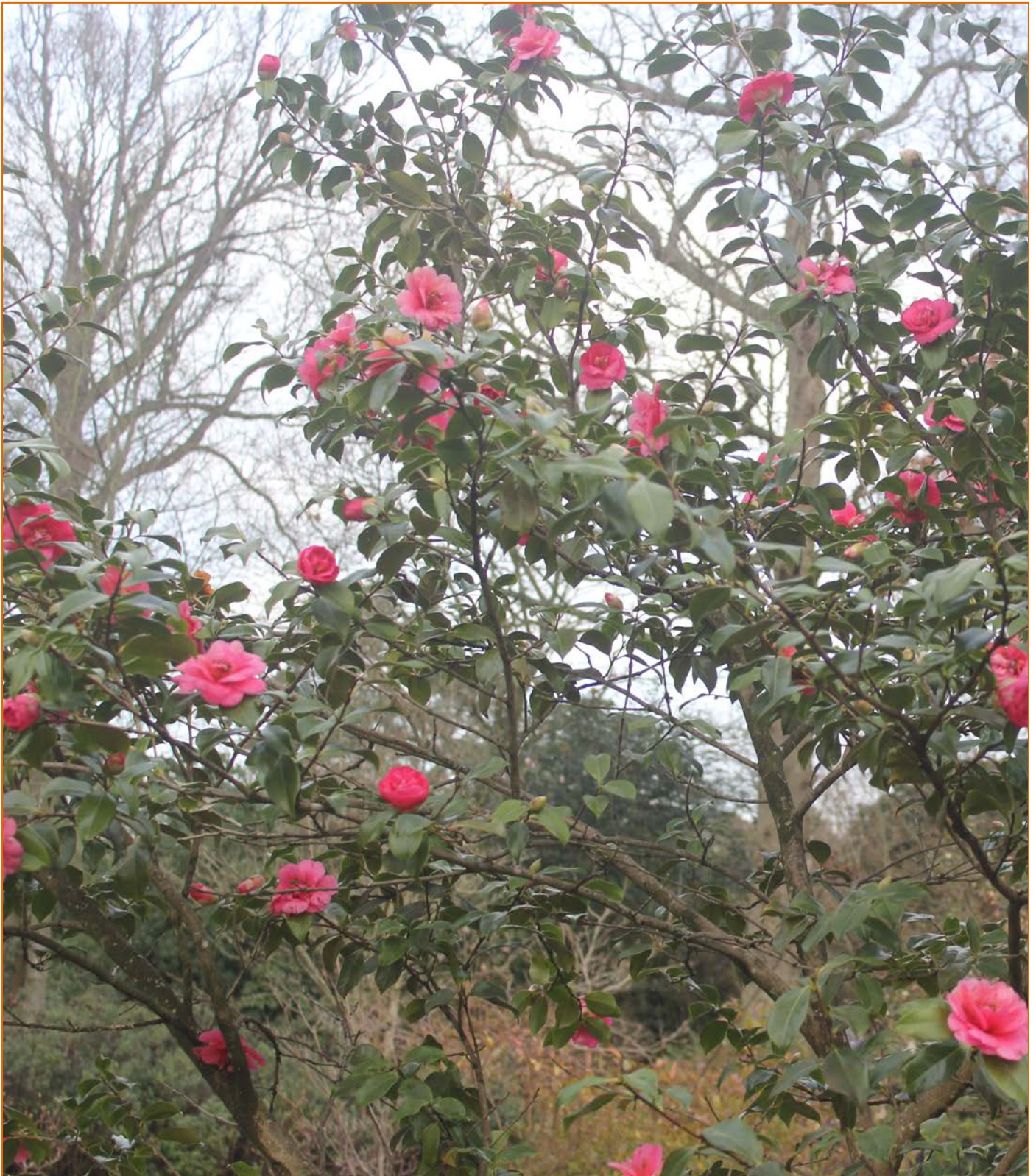
Camellia X williamsii George Blandford

Notes: Received the RGS Award of Merit in 1965 and again in 1974.