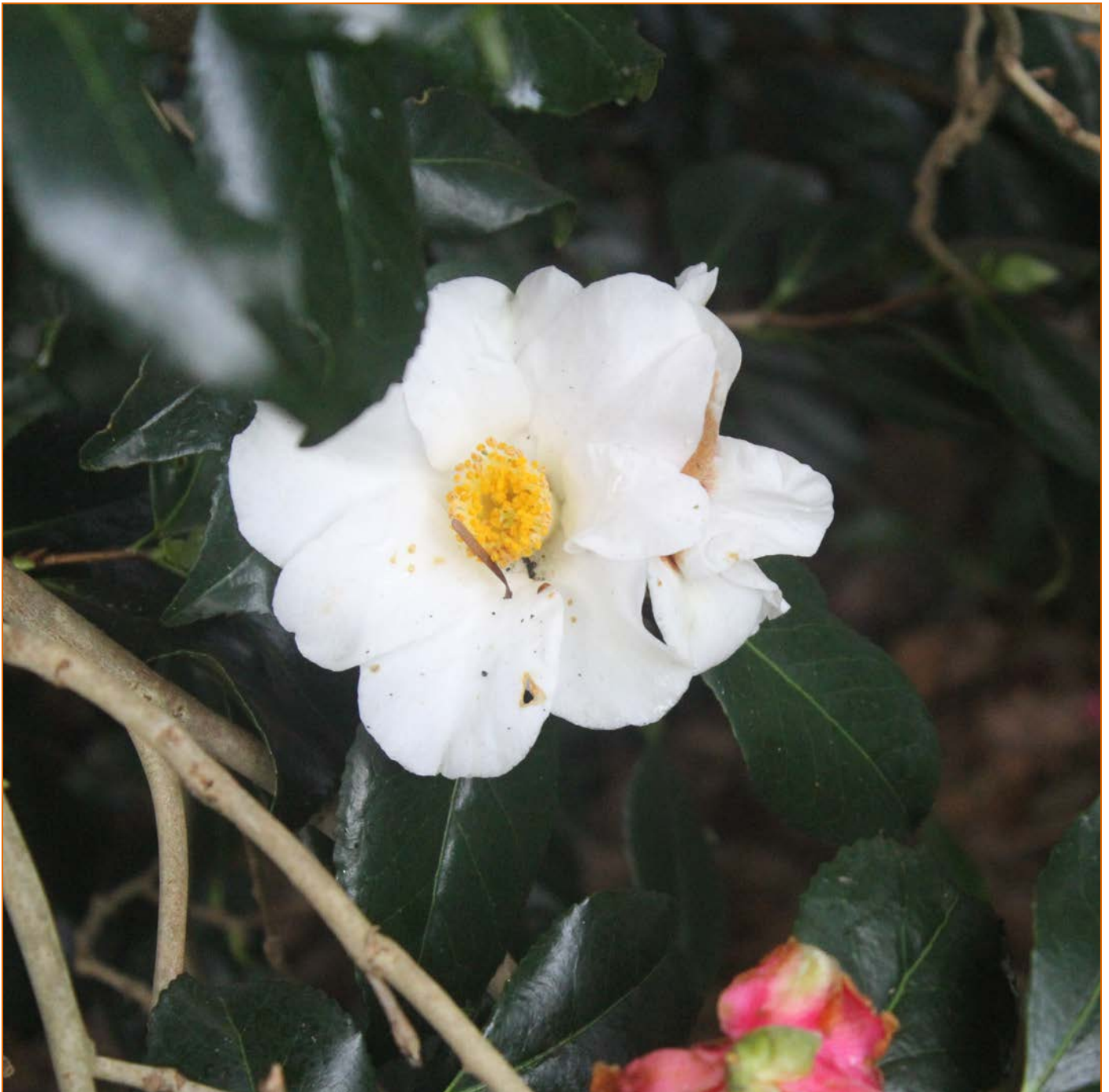
Camellia x williamsii Francis Hanger

The growth is slow, with a tendency to spread, eventually forming a compact, rounded bush - a good