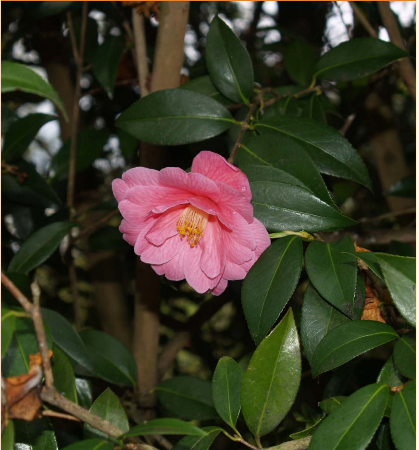
Camellia X Williamsii Donation

Notes: prefers cool climates and will cope with light frosts; Received the RHS Award of Merit and the US National Hall of Fame award in 1978.