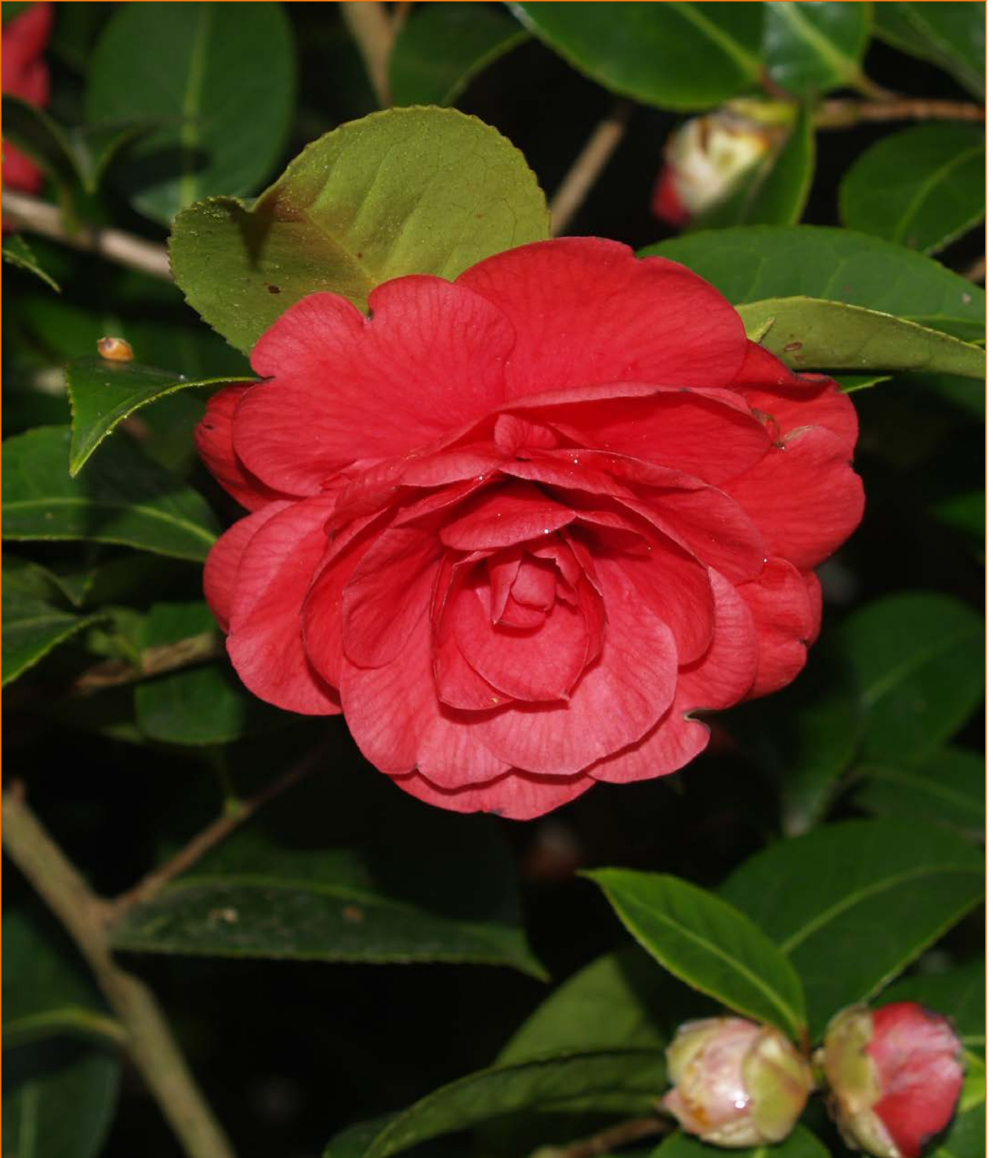
Camellia X williamsii Empire Rose

Appearance: Flowers are, profuse, mid-season, small to mid-sized 8cm across and rose-form to peony form double and rose pink with yellow stamens topped deep pink filaments on a neat shrub.