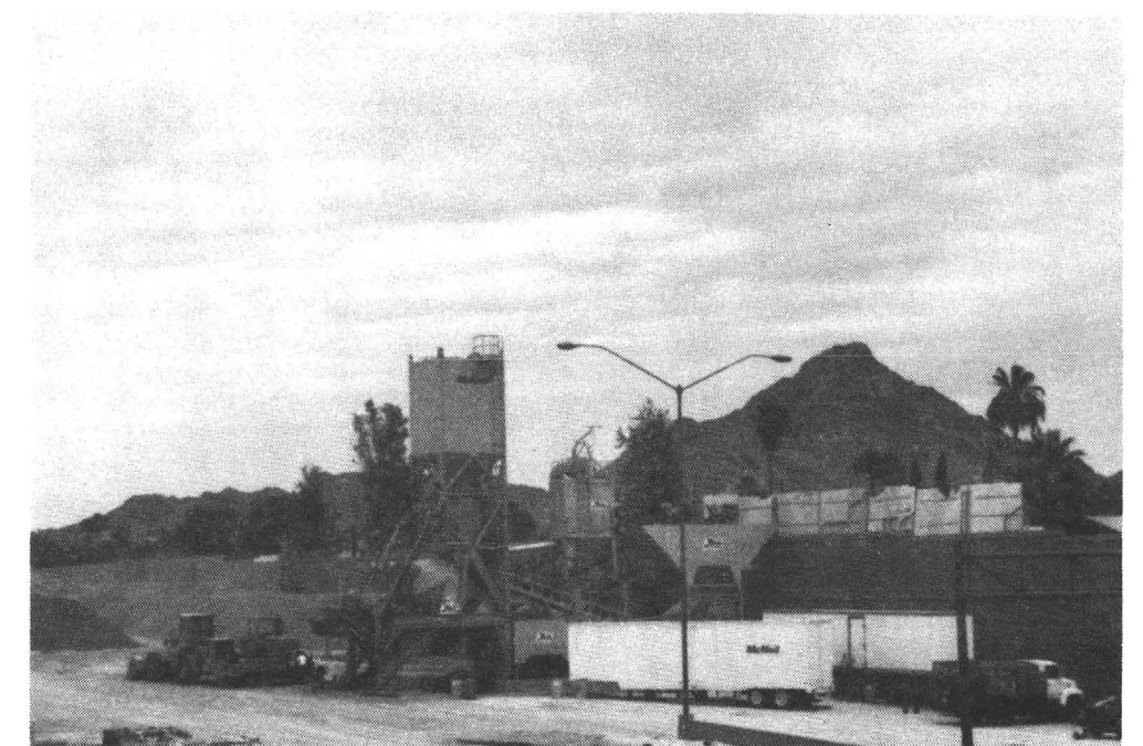
Aggregate batch plant at Squaw Peak Parkway.

UNION ROCK & MATERIALS CORP. - P.O. Box 8007, 2800 S. Central Ave., Phoenix, AZ 85066, 276-4211.