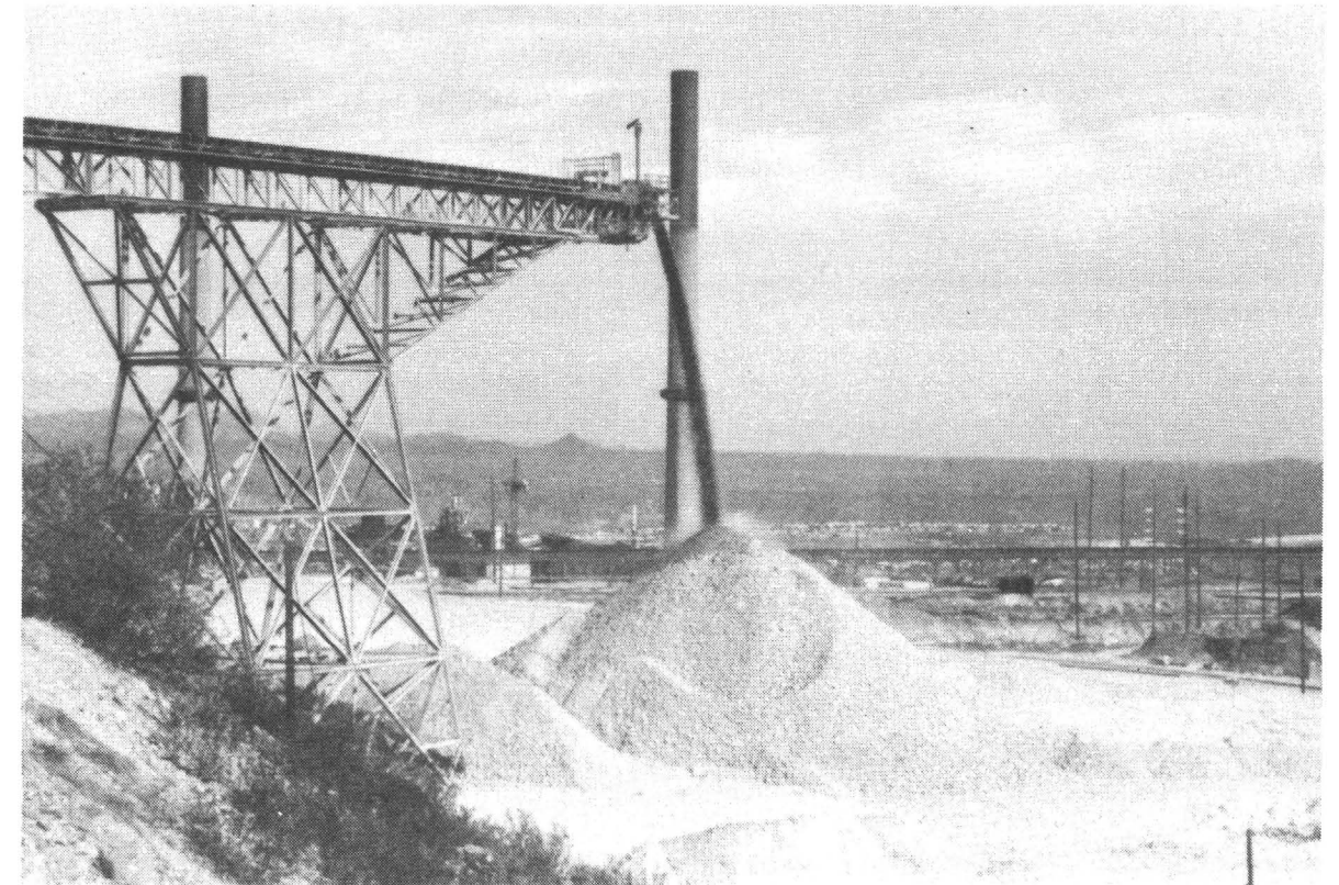
Ore stockpile at the Morenci Mine.