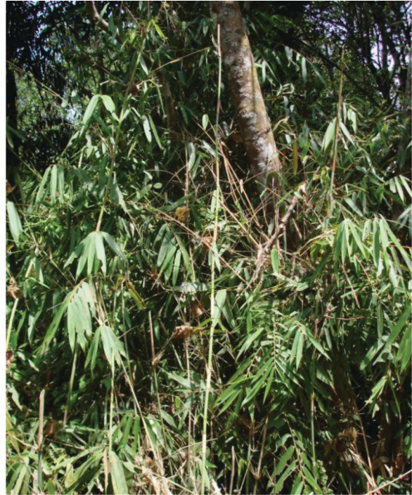
Fig 2. Ochlandra stridula

Culm sheath laminiferous, abscissile upon branching, when new greenish brown below becoming orange-brown to maroon at summit, the blade strongly reflexed and appressed to the sheath, linear-lanceolate, 7.5 cm long, 1 cm wide, with a 2.5 mm long lateral extension, apex attenuate, upper surface green, glabrous except for the whitish short-hirsute base and summit; auricles on either side of insertion of the blade bearing antrorsely barbed oral setae 7.5 mm long; the ligule membraneous, 1 mm long with an entire margin. Leafy twigs 55-81 cm long containing 8-14 leaves; leaf blades lanceolate, tapering to an acuminate apex, the most fully developed 23-34 cm long, 2.5-5 cm wide, glabrous on both sides, one of the margins