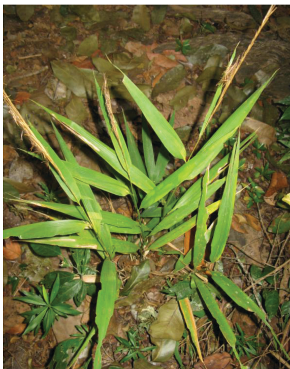
Fig 5. Streptogyna crinita

Description: Culms erect 75-100 cm tall, each representing the aerial extension of an upturned sympodial rhizome, the culm itself producing at its base 1-3 additional rhizomes to 25 cm long, these with short internodes about 1 cm long covered by the overlapping sheaths. Leaves evenly distributed along the culm, the sheaths not overlapping; sheaths glabrous, strongly ribbed, extending upward along both sides of the blade pseudopetiole and contiguous with the inner ligule; blades up to 26 cm long, 2.5 cm wide, broadly lanceolate and tapering at both ends, acute at the tip, narrowed below to a pseudopetiolate base, narrower than the summit of the sheath, 6 primary nerves present on either side of the midrib; upper blade surface pale green, with scattered spine like hairs, lacking manifest