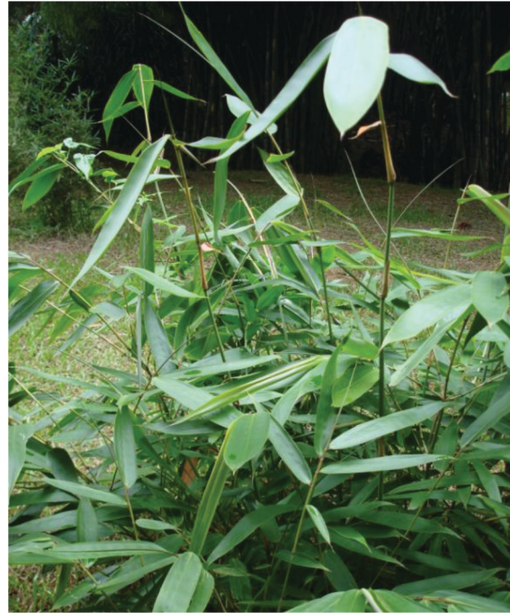
Fig.1. Davidsea attenuata

Branching intravaginal central dominant primary branch developing first, followed by two secondary branches later becoming elongate, thin and whip-like. Culm-sheath when young maroon toward the summit and pale green below, covered with scattered appressed white hairs, thick at the