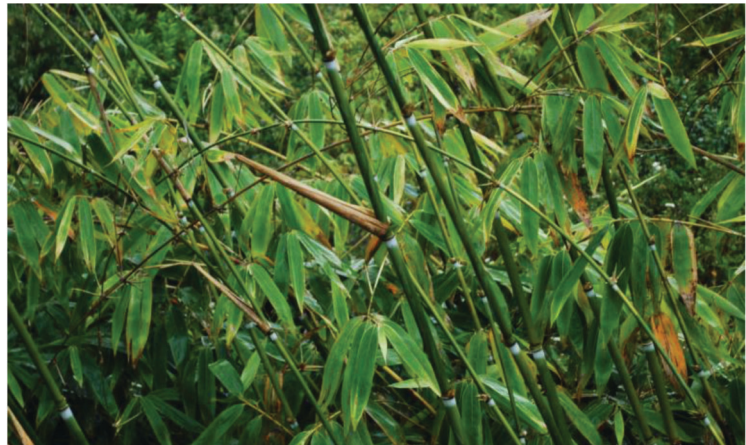
Fig 4. Pseudoxytenanthera monadelpha

Description: Medium sized, caespitose, gregarious bamboo, forming loose clumps. Rhizome sympodial, pachymorph, solid, neck slightly long, covered with scale leaves. Culms erect, self supporting, hollow, 7-10 m tall, tip gradually become curved and whip like; node slightly swollen; sheath scar is very prominent forming a girdle, supranodal ridge not clear, a single