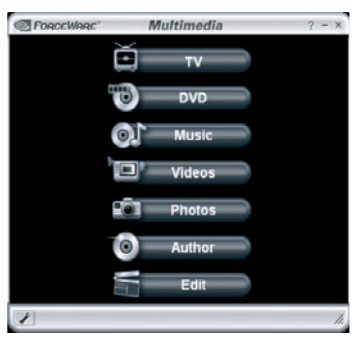
■ ForceWare Multimedia aims to deliver the ultimate digital media experience.

As ever, NVIDIA's holy trinity of power, simplicity and stability are at the heart of the ForceWare solution. To this end, NVIDIA has developed a revolutionary new way of assuring total compatibility. Based on the NVIDIA Unified Driver Architecture (UDA), ForceWare delivers a single driver for all products. Whatever NVIDIA technology you use, and whichever platform you use it with, the same piece of software provides complete forwards and backwards compatibility. And as NVIDIA is committed to constantly refining its technologies, NVIDIA® GeForce™ and