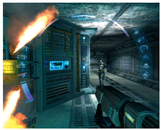
■ Deus Ex: Invisible War features a more powerful physics system, startlingly believable AI, plus dramatically enhanced character modelling and animation.

Invisible War also pushes onwards in terms of the depicting the massive game world. With a heavily customised version of the powerful Unreal engine, it presents a visually arresting world where light and shadow are genuinely useful tools, and the laws of physics have a profound impact on all actions and interactions.