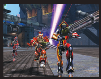
■ The new character models and the new range of weapons are a sight to behold.

FPS traditions. By introducing space flight and crazy buggies with retracting 12 foot blades I think we've successfully accomplished this goal!