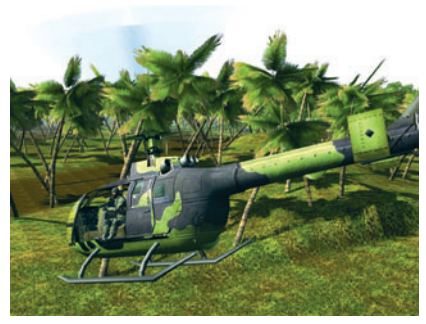
■ Nothing to do with hip replacements, Joint Operations throws you into an ultra-stylised jungle environment.