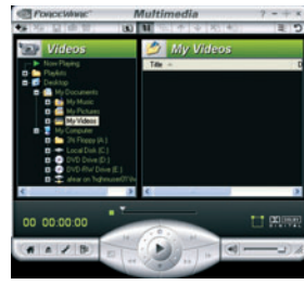
■ ForceWare integrates all multimedia into a simple-to-use interface.

For an incredible audio experience on an NVIDIA nForce-based PC, the NVIDIA NVMixer application provides complete control of volume adjustment, recording options, speaker configuration, and more through easy to follow wizards.