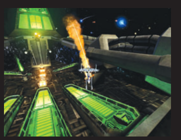
■ Lavish landscapes and luminous weapons' effects complete the UT2004 experience.

What about new weapons? What will we be fragging with this time around? Several new weapons make their series debut. The spider mines are great, you