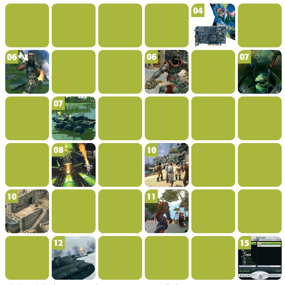
What's new in hardware 04. Unreal Tournament 2004 08. Call Of Duty 12. Forceware 15.