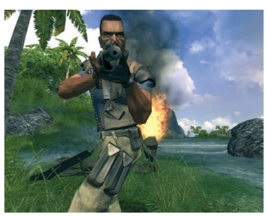
■ With Far Cry's film star looks making it a visual treat, staring straight down the barrel of a loaded gun has never been more pleasurable.