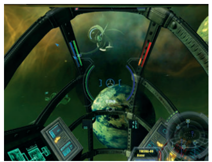
■ Strikingly dramatic and yet still somehow realistic, the massive world of X2; The Threat is yours to explore.