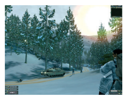
■ Instead of separate game levels, Soldner: Secret Wars provides gamers with one huge virtual battlefield.