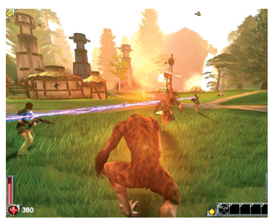
■ Savage: The Battle For Newerth, from Californian-based developer S2, promises the innovative mix of real-time strategy with first-person shooter.