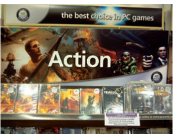
■ You can find out more about NVIDIA-enabled games in-store. Look out for store fronts sporting the TWIMTBP banner and logo, and games retailers with dedicated sections and stickered titles inside.

Finally, there's the branding. By looking out for the TWIMTBP logo in store, on game packaging, and on