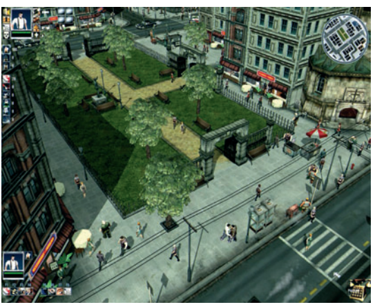
■ On first inspection this might look like any normal city, but scratch the surface and you'll find, in true Gangland -style, that corruption is rife. Looks nice though.