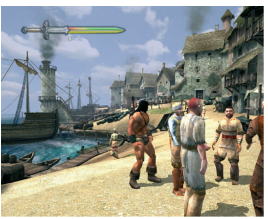
■ You'll recognise Conan, he's the huge, muscular one with very few clothes on. The cutting edge volumetric and particle techniques make him look even bigger.

"With a specially developed Conan 3D Engine allowing the creation of huge, detailed scenarios with unique atmospheres of intense light and shadow effects, we believe that Conan the game will not only satisfy the high expectation of Conan fans but gamers alike with its amazing graphics and barbaric gameplay," says TDK Europe's Heiko tom Felde.