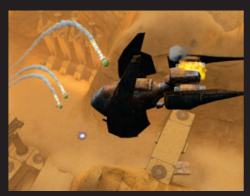
■ A new user interface with underlying improvements make it easy for mod makers.

There are many new vehicles in UT2004 , from ground to air to space vehicles, the full spectrum of locomotion is