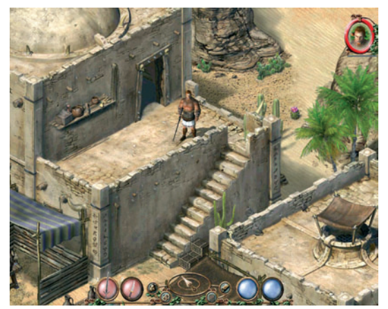
■ Sacred is presented in richly detailed rendered 2D backgrounds, while the motion-captured game characters are in fully animated in 3D.