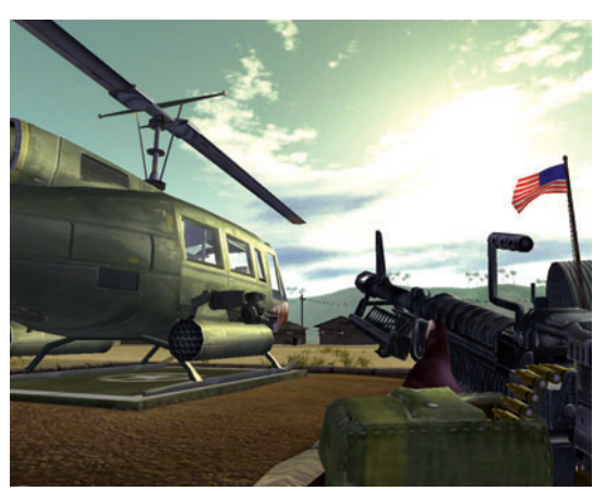
■ With tons of atmosphere, a rock soundtrack and astonishing detail, Battlefield Vietnam elevates gaming to even greater cinematic heights.