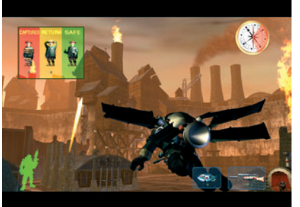
■ Armed And Dangerous combines inspired gameplay and stunning looks with a sense of the absurd.