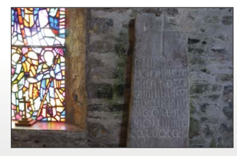
The Ogham stone inside St Illtyd's Church

Ogham was a very early form of writing in Ireland with an alphabet of simple strokes along a line. Ogham stones are mostly found in Ireland, but also up the west coast of Britain, carved by Celtic tribes who settled on both sides of the Irish Sea about fifteen hundred years ago.