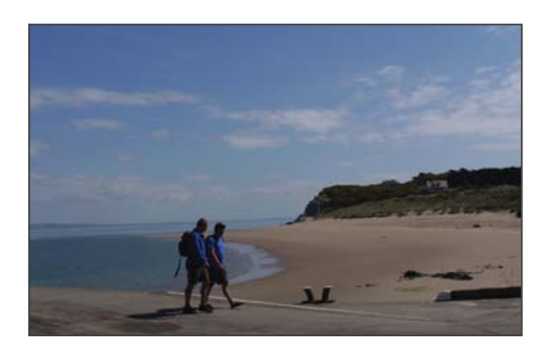
Setting off from the jetty at Priory Bay

Starting from the jetty and keeping the beach on your left, head straight up the vehicle track towards the monastery and village. There are very few vehicles on the island so the track is very safe. One word of warning though, there can be few beaches in the whole of Wales as stunning as Priory Bay, so resist going down onto the sand until the end of your walk or else you may not want to leave.