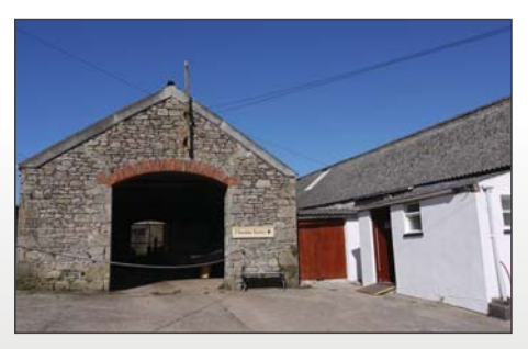
Chocolate factory entrance

The monks started making chocolate here on Caldey in the 1980's but Spanish Cistercian Monks were making chocolate way back in the 1500's, when cocoa beans and a recipe were sent back from Mexico to a monastery in Spain, and so started the 500 year old tradition of chocolate making by the Cistercians.