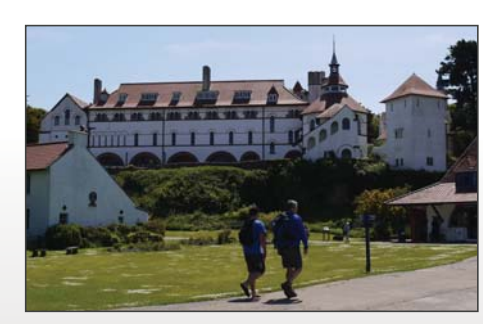
The Monastery and village green

The Monastery was built in 1913. It was designed by John Coates Carter from Penarth, one of the most talented Welsh architects of the twentieth century and a leading light of what was known as the Arts and Crafts movement of design and architecture. The present Abbey was in fact intended to be merely the gatehouse for a much larger monastery; however those ambitious plans were shelved when the Benedictine community behind the project ran out of money.