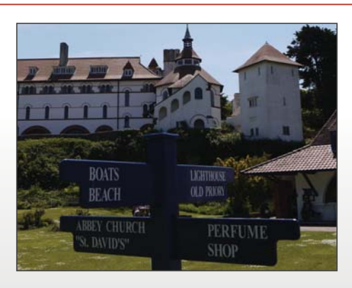
Signpost near the perfume shop.

Today, most of the initial process happens in external laboratories and the essences are then used in the island's perfumery, where products are made and perfumes bottled