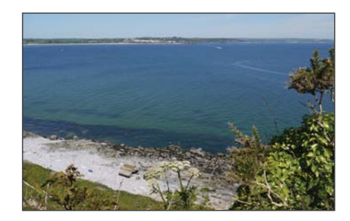
Old quarry at High Cliff

The path now winds its way along the edge of the woodland back to the village. From there retrace your steps back along the road down to the jetty before the last boat leaves the island for the return trip back to Tenby.