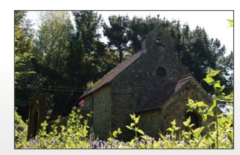
St David's Church

St David's, the island's parish church, stands on a pre-Christian burial ground probably going back as far as 2000 years. Today the simple wooden crosses mark the graves of both monks and islanders, but the Celtic burials may have been of people from the mainland, in keeping with the Celtic belief that islands represented a bridge, or stepping stone to the afterlife.