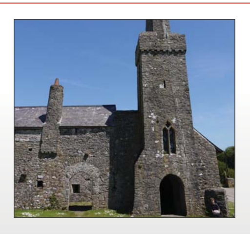
St Illtyd's Church

The Old Priory and St Illtyd's Church next door, with its 14th century leaning spire, sit on the site of the original 6th century Celtic monastery. The Priory was home to the Benedictine monks who lived on Caldey in medieval times. The monastic buildings have been unoccupied since the Dissolution of the Monasteries, but St Illtyd's Church is still a consecrated Roman Catholic church.