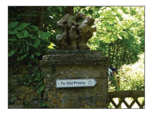
The path to the Old Priory

Turn into a courtyard on the left and then through an archway to reach the entrance to St Illtyd's Church.