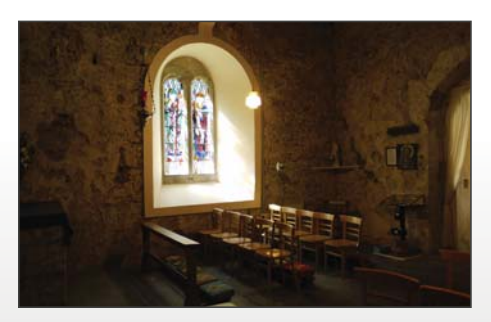
The window with the two Davids – David, patron saint of Wales and King David of Israel

All the windows were in fact designed and made by Dom Theodore Bailey, one of the Benedictine monks who lived on Caldey in the early 1920's.