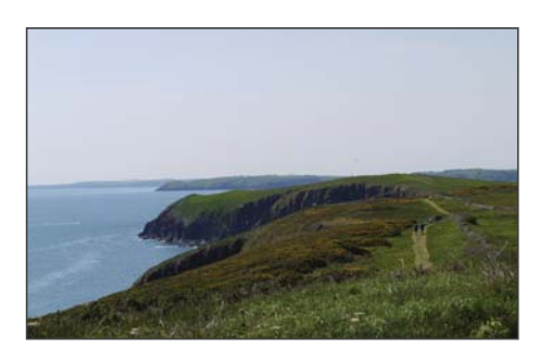
Heading west from the lighthouse towards West Beacon Point

From here head west along the wide grassy path, and on through a wooden gate. In spring and early summer the carpet of pink and yellow sea-cliff flowers along this section are simply beautiful. About 600 metres from the lighthouse there's a gateway on the right with a grassy track that leads back to the Old Priory. Until 2013 this was as far as the general public were allowed to walk, however it's now possible to continue along the obvious wide grassy path along the cliff top towards West Beacon Point. Just before the path turns right, you'll find a convenient bench over on the left hand side where you can take a break and admire the view across to the South Pembrokeshire coast.