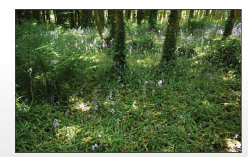
Bluebells in the woodland

The trees of this old monastic enclosure are unusual on an island in western Britain. None of the other islands off the Welsh coast for example, Skomer, Skokholm, Ramsey or Bardsey, have the volume of woodland that Caldey has. This is because generations of monks coppiced sycamore, ash and willow to provide fuel for the Abbey before an electric heating system was installed in 2004.