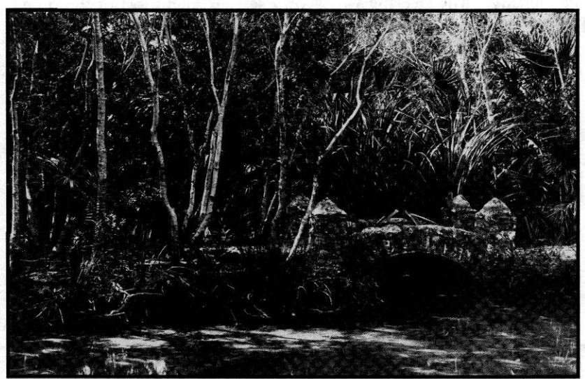
Rustic stone bridge and brackish pool at The Sentinels in Lemon City, home of Charles Simpson. Simpson built the bridge and walls himself. (HASF x-287-2)

In a late overview of the Sentinels, Simpson counted 3,000 varieties of plants: over 100 species of trees and shrubs, 75 orchid species, 150 of palms, 20 of rubber trees, 100 of fruits of all kinds, and many single species of rare trees and plants. Simpson the collector gathered around him in a botanical embrace trees and plants that were both native and the result of his many collecting trips throughout the Caribbean. He explained that the money for every plant he purchased was obtained by going without a meal.<sup>33</sup> How glorious it would have been for Simpson's private green world to be preserved. Just before his death in 1932, the Miami Rotary Club inaugurated a movement to buy the estate and set it aside as