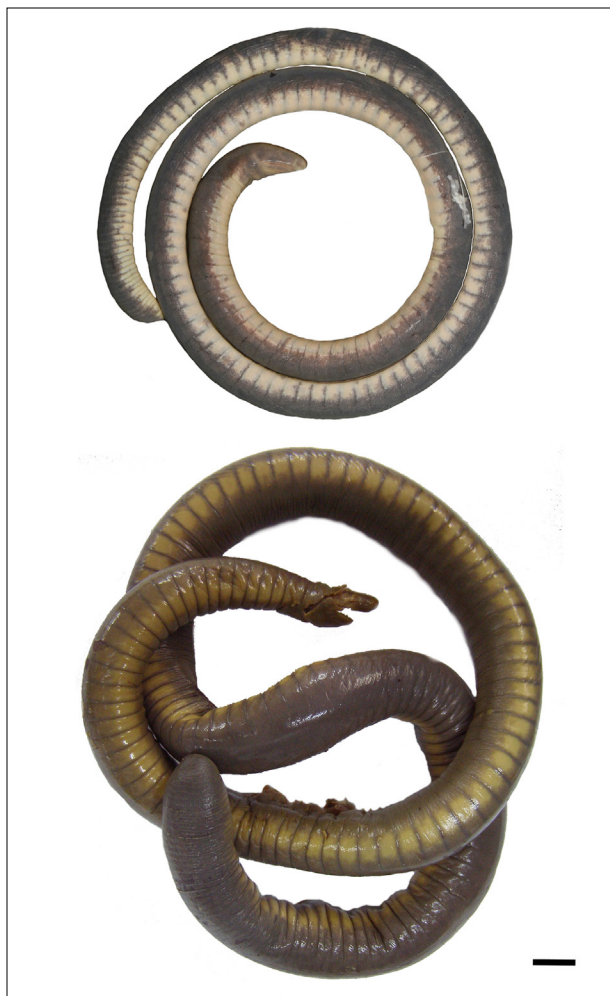
Figure 2. Above, holotype of Caecilia museugoeldi sp. nov. (BYU 48677). Below, holotype of Caecilia flavopunctata. Black bar represents 10 mm.