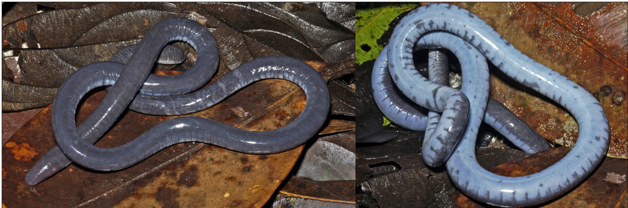
Figure 1. Holotype of Caecilia museugoeldi sp. nov. in life. Left, dorsal view of the body. Right, ventral view of the body.

Caecilia museugoeldi sp. nov. differs from C. attenuata Taylor, 1968, C. caribea Dunn, 1942, C. corpulenta Taylor, 1968, C. crassisquama Taylor, 1968, C. degenerata Dunn, 1942, C. inca Taylor, 1973, C. occidentalis Taylor, 1968, C. orientalis Taylor, 1968, C. pachynema Günther, 1859, and C. subdermalis Taylor, 1968 in having secondary