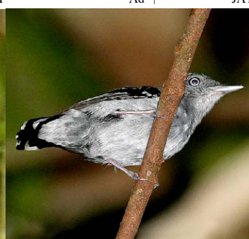
26 Megastictus margaritatus Ad ♂ JAT