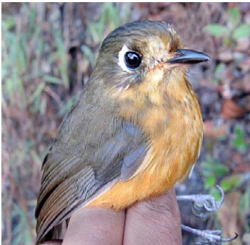
128 Grallaricula ferrugineipectus leymebambae Imm RB