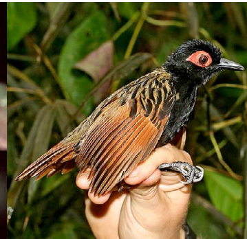
102 Phlegopsis nigromaculata nigromaculata Ad JAT