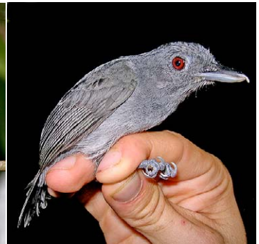
15 Thamnophilus schistaceus Ad ♂ DL