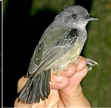
28 Dysithamnus mentalis tavarae Ad ♂ JAT