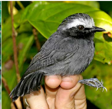
76 Myrmoborus leucophrys