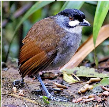
114 Grallaria ridgelyi Ad DB