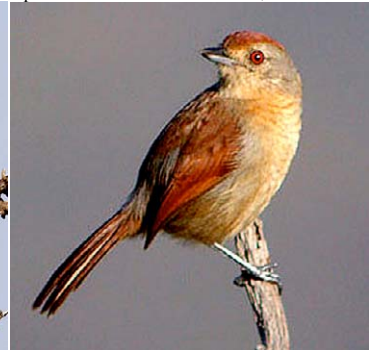
9 Thamnophilus torquatus Ad ♀ NA