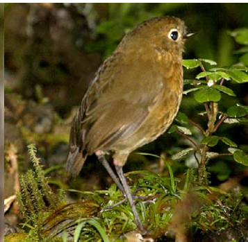
119 Grallaria (rufula) cochabambae Ad JAT