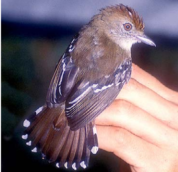
18 Thamnophilus punctatus leucogaster Ad ♀ DFL

© Environmental & Conservation Programs, The Field Museum, Chicago, IL 60605 USA. [RRC@fmnh.org] | www.fmnh.org/animalguides/ | Rapid Color Guide #256 version 1, 11/2009