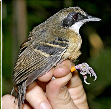
78 Myrmoborus myotherinus myotherinus Ad ♀