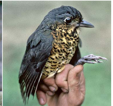
110 Grallaria squamigera canicauda Ad RW