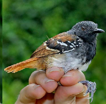
89 Myrmeciza hemimelaena Ad ♂