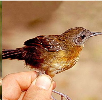
90 Myrmeciza atrothorax melanura Ad ♀ JH