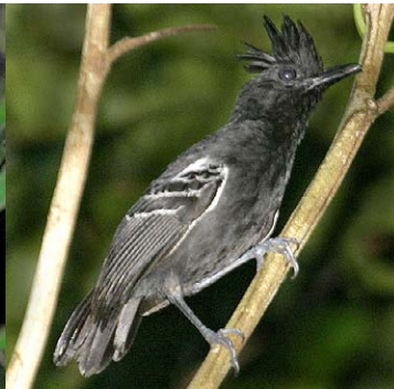
84 Percnostola lophotes Ad ♂ JAT