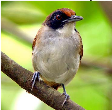
77 Myrmoborus lugubris Ad ♀

[RRC@fmnh.org] | www.fmnh.org/animalguides/ | Rapid Color Guide #256 version 1, 11/2009