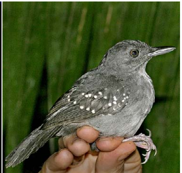
86 Schistocichla humaythae Ad ♂