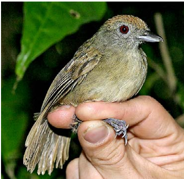
15 Thamnophilus schistaceus Ad ♀ JAT