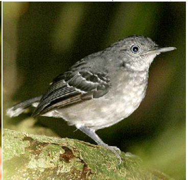
81 Hypocnemoides melanopogon Ad ♀ AG