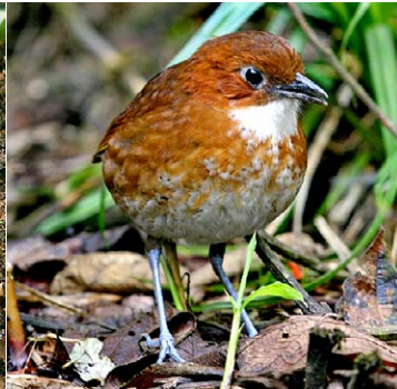
118 Grallaria erythroleuca Ad CI