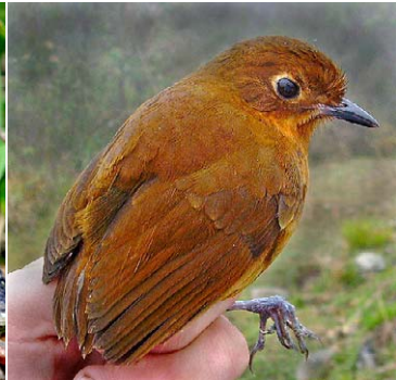
119 Grallaria (rufula) obscura Ad MA