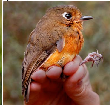
128 Grallaricula ferrugineipectus leymebambae Ad JJ