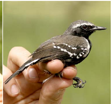
58 Herpsilochmus axillaris axillaris Ad ♂ JAT 59 Microrhopias quixensis albicauda Ad ♂ JAT 59 Microrhopias quixensis albicauda Ad ♀ JAT 60 Formicivora grisea rufiventris Ad ♂ JAT