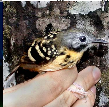
99 Hylophylax naevius Ad ♀ PH