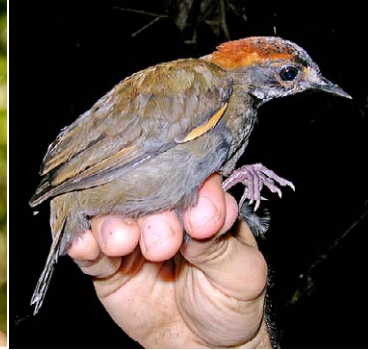
104 Formicarius colma Juv DL