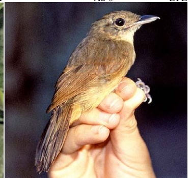
31 Thamnomanes saturninus Ad ♀