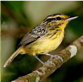
67 Hypocnemis hypoxantha Ad ♀ JAT