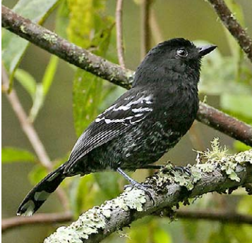
21 Thamnophilus caeruleus aspersiventer Ad ♂ JAT