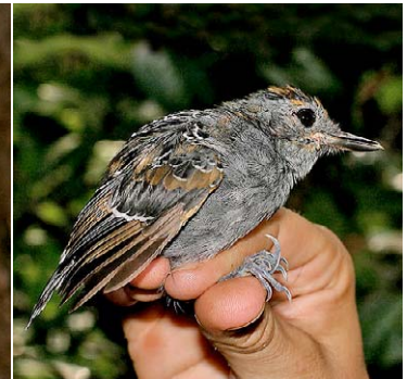
101 Willisornis poecilinotus griseiventris Imm ♂ JAT