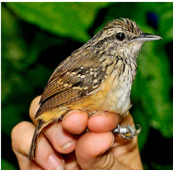
64 Hypocnemis peruviana peruviana Ad ♀ JAT