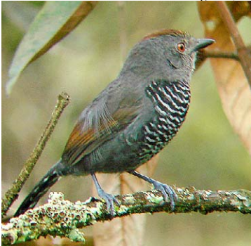
8 Thamnophilus ruficapillus marcapatae Ad ♂

Photos by Roger Ahlman (RA), Mike Andersen (MA), Nick Athanas (NA), Steve Blain (SB), Dušan Brinkhuizen (DB), Rosalbina Butron (RB), Iain Campbell (IC), Bertrando Campos (BC), J. Chavez (JC), Arthur Grosset (AG), Wim Heylen (WH), Jon Hornbuckle (JH), Peter Hosner (PH), Caroline Isaksson (CI), Jill Jankowski (JJ), Philip Koch (PK), Daniel F. Lane, Daniel Lebbin (DL), Huw Lloyd (HL), Chris Merkord (CM), Paul Noakes (PN), Scott Olmstead (SO), Chris Perrins (CP), Zacharia Peterson (ZP), Fernando Angulo Pratulongo (FAP), Robert Scanlon (RS), Ryan Shaw (RSh), Joseph A. Tobias (JAT), Wendy Tori (WT), Ursula Valdez (UV), Thomas Valqui (TV), Rob Williams (RW), Kevin Zimmer (KZ). © Environmental & Conservation Programs, The Field Museum, Chicago, IL 60605 USA. [RRC@fmnh.org] | www.fmnh.org/animalguides/ | Rapid Color Guide #256 version 1, 11/2009