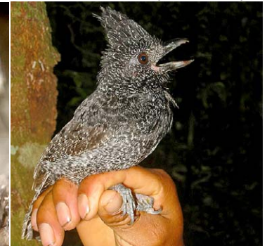
4 Frederickena unduligera Ad ♂ WT