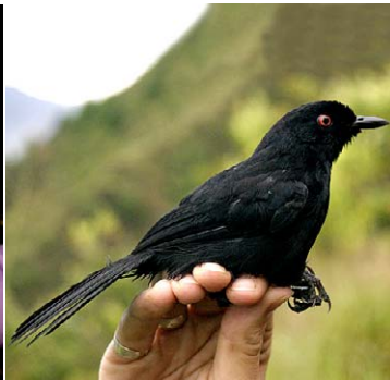
75 Pyriglena leuconota hellmayri