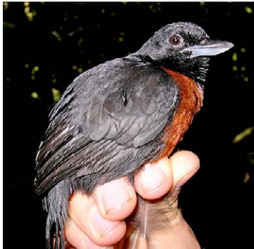
27 Neotantes niger Ad ♀

[RRC@fmnh.org] | www.fmnh.org/animalguides/ | Rapid Color Guide #256 version 1, 11/2009