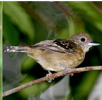
14 Thamnophilus atrinucha Ad ♀ JAT