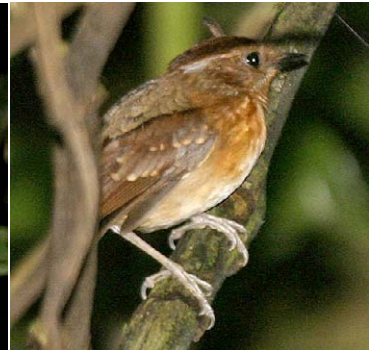
130 Conopophaga peruviana Ad ♀ JAT