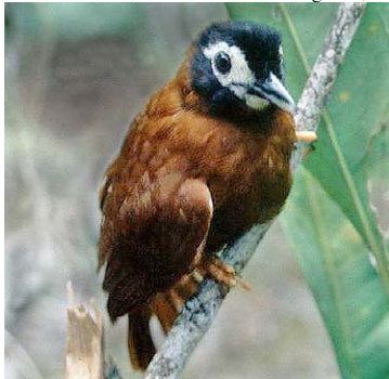
96 Pithys castanea Ad

Photos by Roger Ahlman (RA), Mike Andersen (MA), Nick Athanas (NA), Steve Blain (SB), Dušan Brinkhuizen (DB), Rosalbina Butron (RB), Iain Campbell (IC), Bertrando Campos (BC), J. Chavez (JC), Arthur Grosset (AG), Wim Heylen (WH), Jon Hornbuckle (JH), Peter Hosner (PH), Caroline Isaksson (CI), Jill Jankowski (JJ), Philip Koch (PK), Daniel F. Lane (DFL), Daniel Lebbin (DL), Huw Lloyd (HL), Chris Merckord (CM), Paul Noakes (PN), Scott Olmstead (SO), Chris Perrins (CP), Zacharia Peterson (ZP), Fernando Angulo Pratulongo (FAP), Robert Scanlon (RS), Ryan Shaw (RSh), Joseph A. Tobias (JAT), Wendy Tori (WT), Ursula Valdez (UV), Thomas Valqui, Rob Williams (RW), Kevin Zimmer (KZ). © Environmental & Conservation Programs, The Field Museum, Chicago, IL 60605 USA. [RRC@fmnh.org] | www.fmnh.org/animalguides/ | Rapid Color Guide #256 version 1, 9/2009