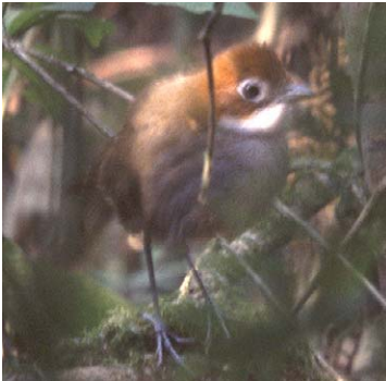
116 Grallaria albigula Ad JAT