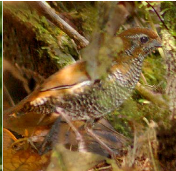
109 Chamaeza molissima Ad DL