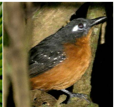
92 Myrmeciza hyperythra Ad ♀