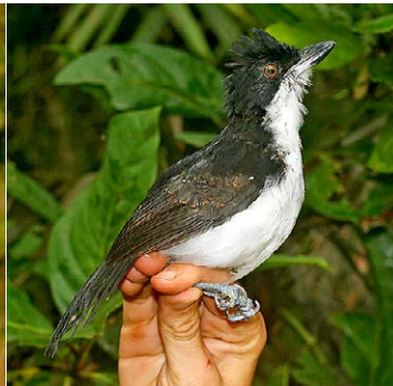
5 Taraba major Imm ♂ JAT