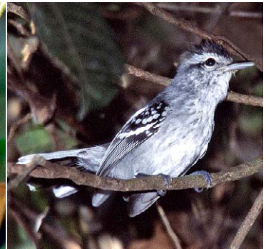
54 Myrmochilus strigilatus strigilatus Ad ♀ AG 55 Herpsilochmus atricapillus Ad ♂ BC 56 Herpsilochmus dugandii Ad ♂ IC 57 Herpsilochmus longirostris Ad ♂ JAT