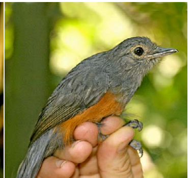
33 Thamnomanes schistogynus Ad ♀