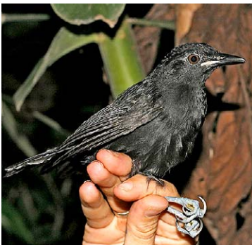
91 Myrmeciza goeldii Imm ♂ JAT