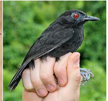
91 Myrmeciza goeldii Ad ♀