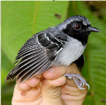
78 Myrmoborus myotherinus myotherinus Ad ♂