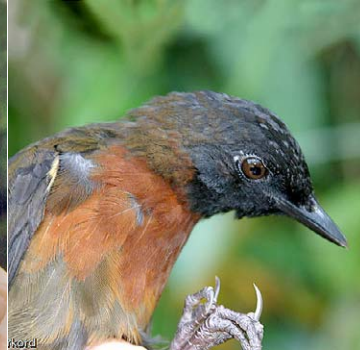
107 Formicarius rufipectus Ad CM