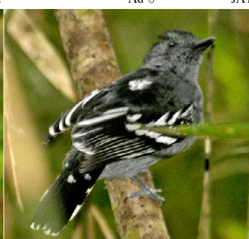
25 Thamnophilus amazonicus Ad ♂ JAT