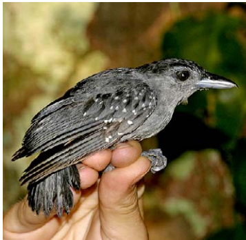
34 Pygiptila stellaris stellaris Ad ♂ JAT