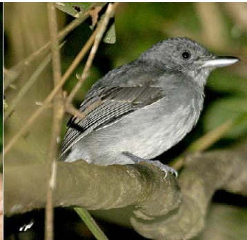
16 Thamnophilus murinus canipennis Ad ♂ JAT