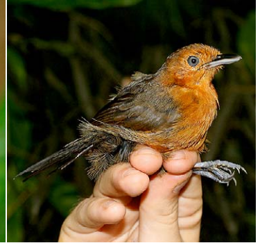
71 Cercomacra nigrescens fuscicauda