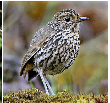
113 Grallaria andicola Ad