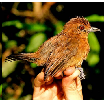
23 Thamnophilus aethiops kapounis Ad ♀