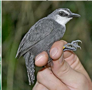
97 Gymnopithys salvini Ad ♂ JAT