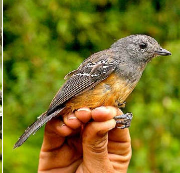
21 Thamnophilus caeruleus aspersiventer Ad ♀ JAT