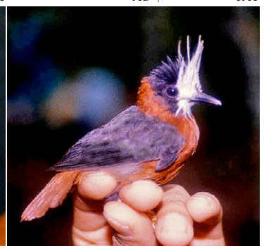
95 Pithys albifrons Ad DFL