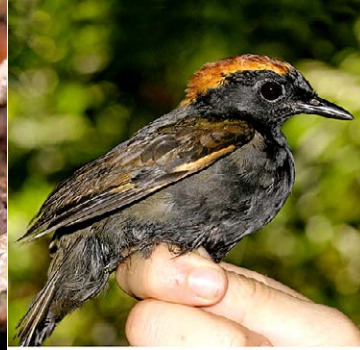
104 Formicarius colma Ad JAT