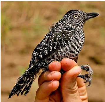
7 Thamnophilus doliatus radiatus Ad ♂ JAT