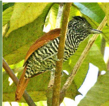
12 Thamnophilus palliatus Ad ♂ JAT