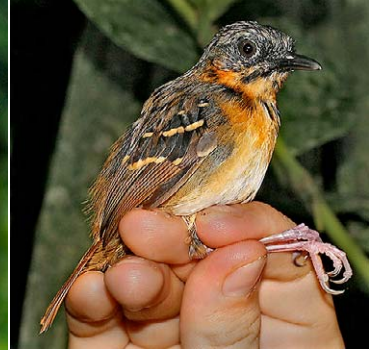
89 Myrmeciza hemimelaena Imm ♂ JAT