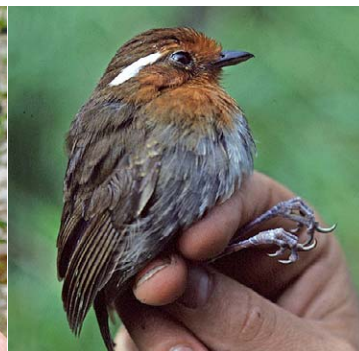
131 Conopophaga castaneiceps chapmani Juv ♂ JAT