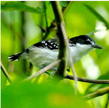
82 Myrmochanes hemileucus Ad ♀ RA