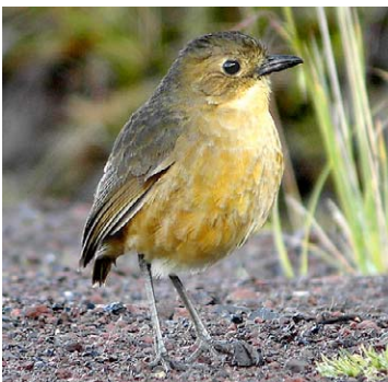
121 Grallaria quitensis Ad SB