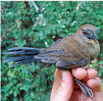
75 Pyriglena leuconota pacifica