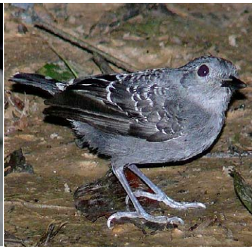
101 Willisornis poecilinotus griseiventris Ad ♂ PK