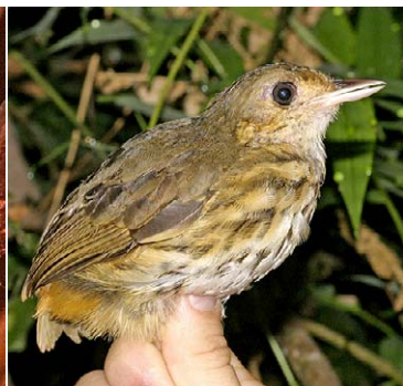
124 Hylopezus berlepschi Ad JAT