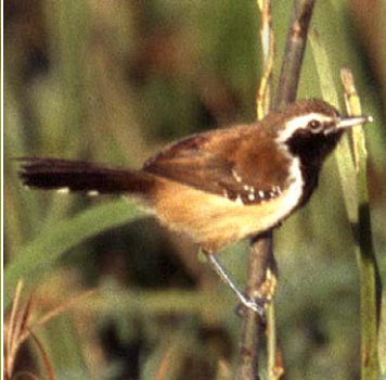
61 Formicivora rufa rufa Ad ♂ JAT