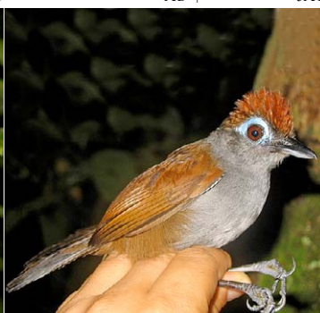
93 Myrmeciza fortis Ad ♀ UV