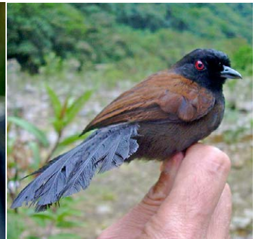
75 Pyriglena leuconota picea