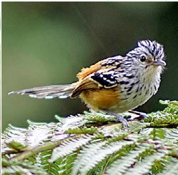
63 Drymophila caudata Ad ♂ DB