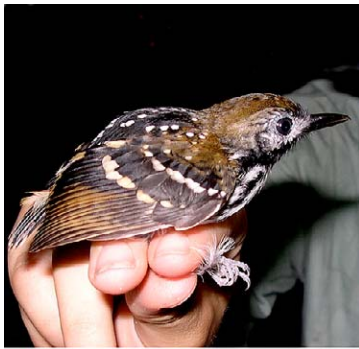
100 Hylophylax punctulata Ad ♂ DL