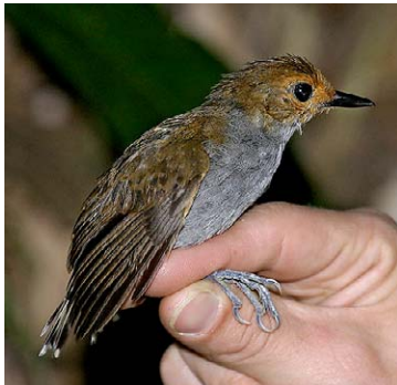
101 Willisornis poecilinotus griseiventris Ad ♀