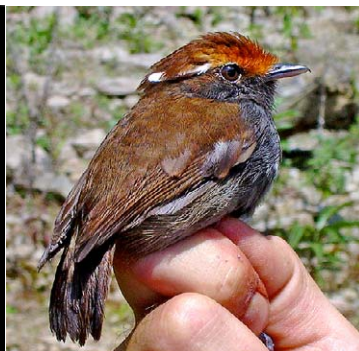
131 Conopophaga castaneiceps brunneinucha Ad ♂ PH