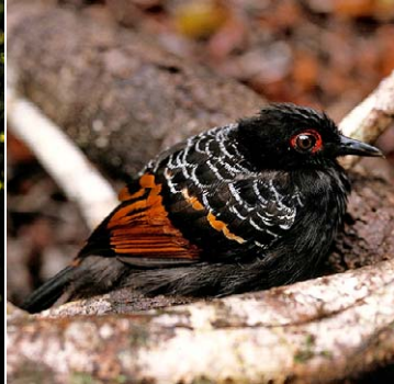
103 Phlegopsis erythroptera Ad ♂ TV