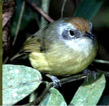
28 Dysithamnus mentalis mentalis Ad ♀ JAT