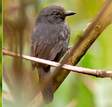
22 Thamnophilus unicolor Ad ♂ SO