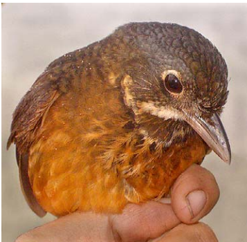
111 Grallaria guatemalensis Ad FAP