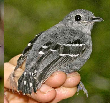
45 Myrmotherula axillaris heterozyga Ad ♂ JAT 45 Myrmotherula axillaris heterozyga Ad ♀ JAT 45 Myrmotherula axillaris axillaris Ad ♂ JH 46 Myrmotherula hauxwelli hauxwelli Ad ♂ JAT