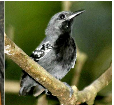
48 Myrmotherula longipennis garbei Ad ♂ JAT 48 Myrmotherula longipennis garbei Ad ♂ JAT 48 Myrmotherula longipennis garbei Ad ♀ JAT 49 Myrmotherula iheringi Ad ♂ JAT