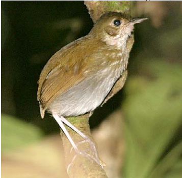
125 Myrmothera campanisona Ad