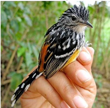
62 Drymophila devillei devillei Ad ♂ UV