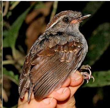
130 Conopophaga peruviana Imm ♂ JAT