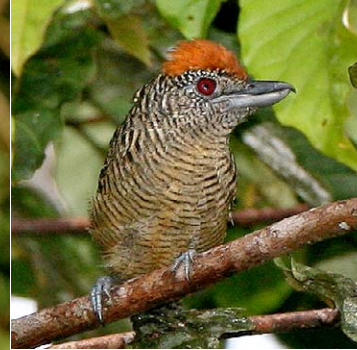
1 Cymbilaimus lineatus Ad ♀ JAT