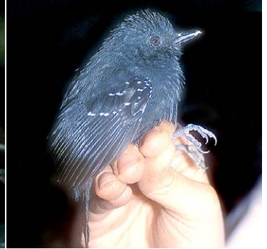
29 Dysithamnus occidentalis Ad ♂ DFL