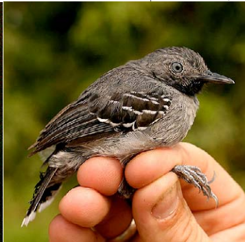
81 Hypocnemoides maculicauda Ad ♂ JAT