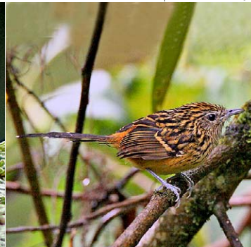
63 Drymophila caudata Ad ♀ JAT