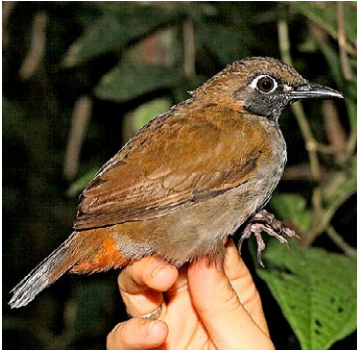
105 Formicarius analis Ad JAT