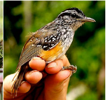
64 Hypocnemis peruviana peruviana Ad ♂ JAT