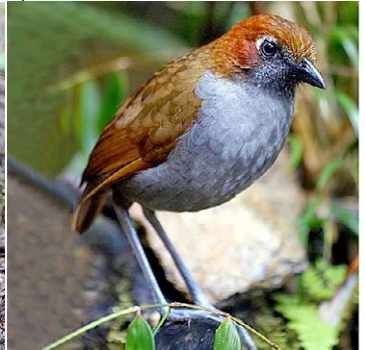
115 Grallaria nuchalis Ad DB