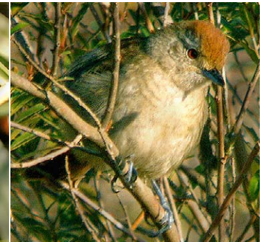
8 Thamnophilus ruficapillus ruficapillus Ad ♀ NA