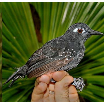
92 Myrmeciza hyperythra Ad ♂