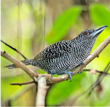
1 Cymbilaimus lineatus Ad ♂

[RRC@fmnh.org] | www.fmnh.org/animalguides/ | Rapid Color Guide #256 version 1, 11/2009