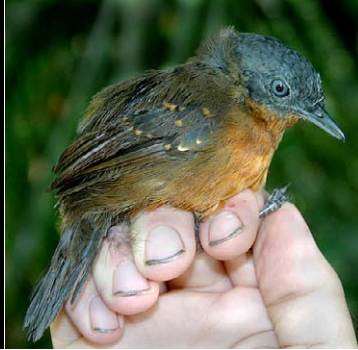
88 Schistocichla leucostigma subplumbea Ad ♀ CM