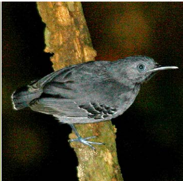
80 Hypocnemoides melanopogon Ad ♂ JAT