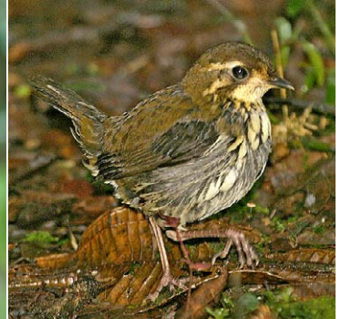
108 Chamaeza campanisona boliviana Ad JAT