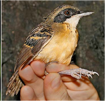
78 Myrmoborus myotherinus myotherinus Imm ♀ JAT