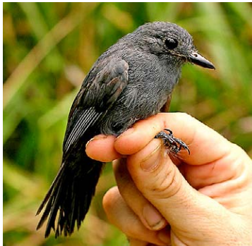
32 Thamnomanes caesius persimilis Ad ♂ JAT