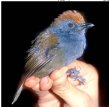
29 Dysithamnus occidentalis Ad ♀ DFL