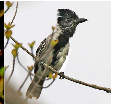
6 Sakesphorus canadensis Ad ♂ JAT