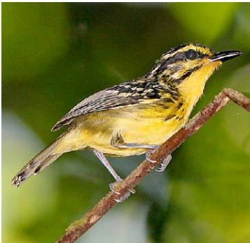
67 Hypocnemis hypoxantha Ad ♂ JAT