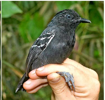
84 Percnostola lophotes Ad ♂ JAT