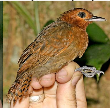
97 Gymnopithys salvini Ad ♀ JAT