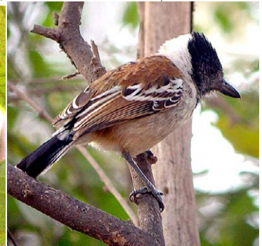
13 Thamnophilus bernardi Ad ♂ NA