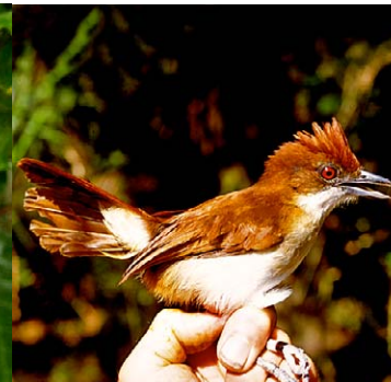
5 Taraba major Ad ♀ JH