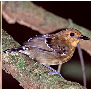
101 Willisornis poecilinotus lepidonota Ad ♀