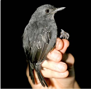
87 Schistocichla brunneiceps Ad ♂

Photos by Roger Ahlman (RA), Mike Andersen (MA), Nick Athanas (NA), Steve Blain (SB), Dušan Brinkhuizen (DB), Rosalbina Butron (RB), Iain Campbell (IC), Bertrando Campos (BC), J. Chavez (JC), Arthur Grosset (AG), Wim Heylen (WH), Jon Hornbuckle (JH), Peter Hosner (PH), Caroline Isaksson (CI), Jill Jankowski (JJ), Philip Koch (PK), Daniel F. Lane (DFL), Daniel Lebbin (DL), Huw Lloyd (HL), Chris Merkord, Paul Noakes (PN), Scott Olmstead (SO), Chris Perrins (CP), Zacharia Peterson (ZP), Fernando Angulo Pratolongo (FAP), Robert Scanlon (RS), Ryan Shaw (RSh), Joseph A. Tobias (JAT), Wendy Tori (WT), Ursula Valdez (UV), Thomas Valqui (TV), Rob Williams (RW), Kevin Zimmer (KZ). © Environmental & Conservation Programs, The Field Museum, Chicago, IL 60605 USA. [RRC@fmnh.org] [www.fmnh.org/animalguides/] Rapid Color Guide #256 version 1, 11/2009