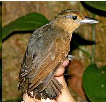
34 Pygiptila stellaris stellaris Ad ♀ JAT