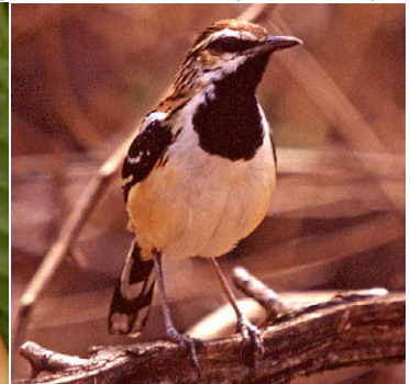
52 Myrmotherula assimilis Ad ♀ JAT 53 Dichrozona cincta Ad ♂ JAT 53 Dichrozona cincta Ad ♀ JAT 54 Myrmochilus strigilatus suspicax Ad ♂ JAT