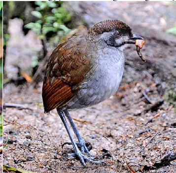
114 Grallaria ridgelyi Imm CP