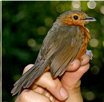
72 Cercomacra serva