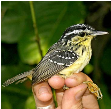
65 Hypocnemis subflava collinsi Ad ♂ JAT