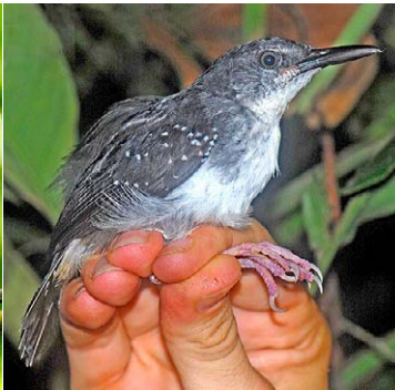
83 Sclateria naevia argentata Ad ♂ JAT