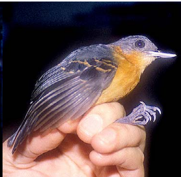
85 Percnostola arenarum Ad ♀ DFL