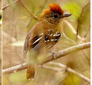
20 Thamnophilus sticturus Ad ♀ JAT