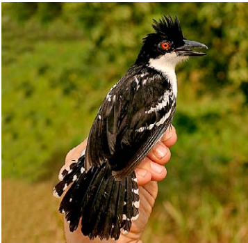
5 Taraba major Ad ♂ JAT