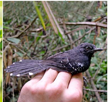
74 Cercomacra manu