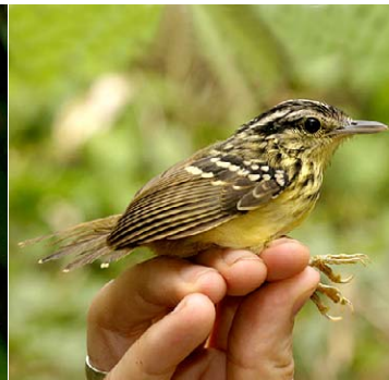
65 Hypocnemis subflava collinsi Ad ♀ JAT