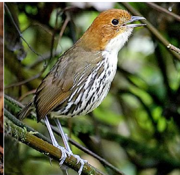
112 Grallaria ruficapilla Ad DB