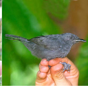
71 Cercomacra nigrescens fuscicauda