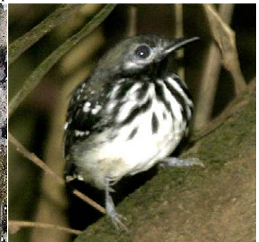
100 Hylophylax punctulata Ad ♂ JAT