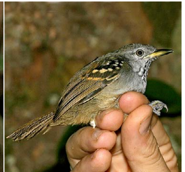
35 Epinecrophylla leucophthalma leucophthalma Imm ♂ JAT