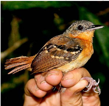
89 Myrmeciza hemimelaena Ad ♀