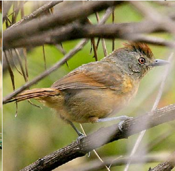
8 Thamnophilus ruficapillus marcapatae Ad ♀ JAT