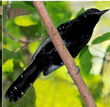
73 Cercomacra melanaria