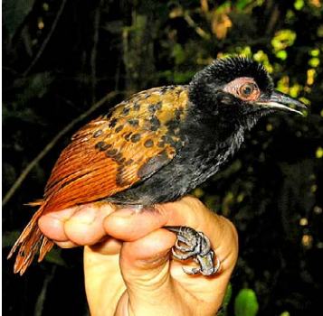
102 Phlegopsis nigromaculata bowmani Juv

[RRC@fmnh.org] | www.fmnh.org/animalguides/ | Rapid Color Guide #256 version 1, 11/2009