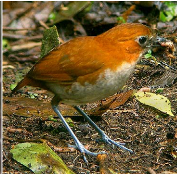
117 Grallaria hypoleuca Ad NA