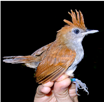
84 Percnostola lophotes Ad ♀ JAT