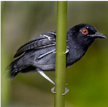
79 Myrmoborus melanurus Ad ♂ RS