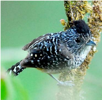
10 Thamnophilus zarumae Ad ♂ PN