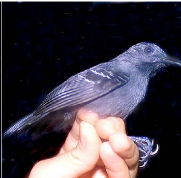
85 Percnostola arenarum Ad ♂ DFL