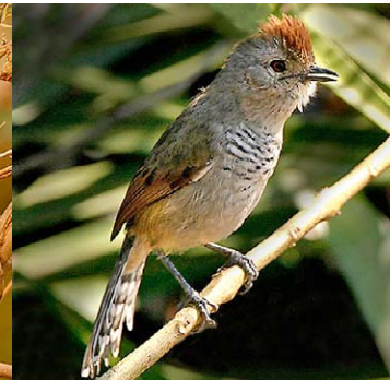
8 Thamnophilus ruficapillus cochabambae Ad ♂ JAT