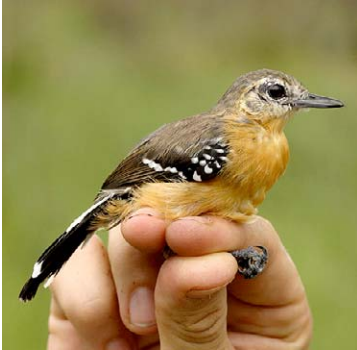
60 Formicivora grisea rufiventris Ad ♀

Photos by Roger Ahlman (RA), Mike Andersen (MA), Nick Athanas (NA), Steve Blain (SB), Dušan Brinkhuizen (DB), Rosalbina Butron (RB), Iain Campbell (IC), Bertrando Campos (BC), J. Chavez (JC), Arthur Grosset (AG), Wim Heylen (WH), Jon Hornbuckle (JH), Peter Hosner (PH), Caroline Isaksson (CI), Jill Jankowski (JJ), Philip Koch (PK), Daniel F. Lane (DFL), Daniel Lebbin (DL), Huw Lloyd (HL), Chris Merckord (CM), Paul Noakes (PN), Scott Olmstead (SO), Chris Perrins (CP), Zacharia Peterson (ZP), Fernando Angulo Pratulongo (FAP), Robert Scanlon (RS), Ryan Shaw (RSh), Joseph A. Tobias, Wendy Tori (WT), Ursula Valdez (UV), Thomas Valqui (TV), Rob Williams (RW), Kevin Zimmer (KZ). © Environmental & Conservation Programs, The Field Museum, Chicago, IL 60605 USA. [RRC@fmnh.org] | www.fmnh.org/animalguides/ | Rapid Color Guide #256 version 1, 11/2009