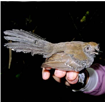
74 Cercomacra manu