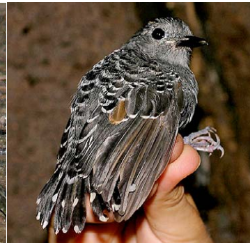
101 Willisornis poecilinotus griseiventris Imm ♂ JAT