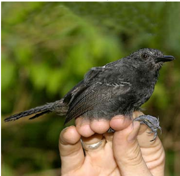
72 Cercomacra serva