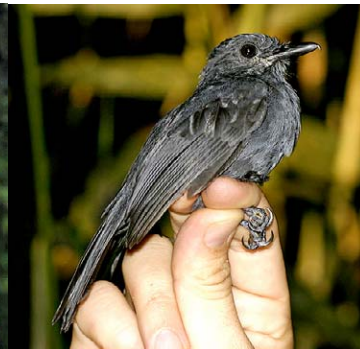
33 Thamnomanes schistogynus Ad ♂