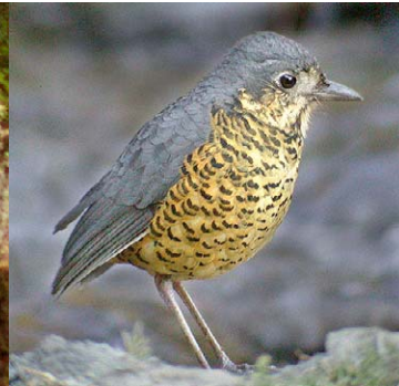
110 Grallaria squamigera squamigera Ad WH