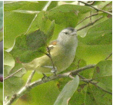
69 Terenura humeralis Ad ♂ JAT