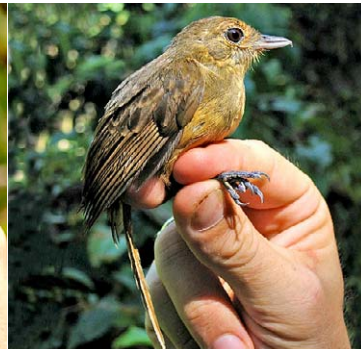
32 Thamnomanes caesius perimilis Imm ♀ JAT