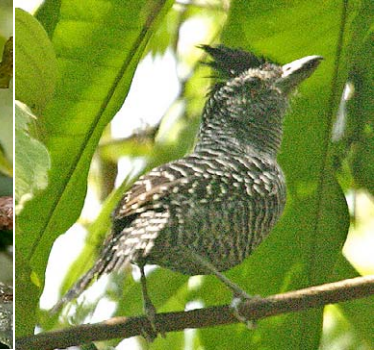
2 Cymbilaimus sanctaemariae Ad ♂ JAT