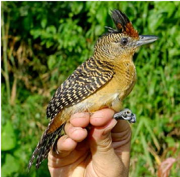
2 Cymbilaimus sanctaemariae Ad ♀ JAT