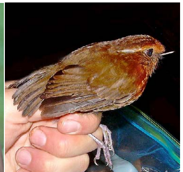
131 Conopophaga castaneiceps brunneinucha Ad ♀ PH