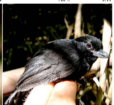
27 Neotantes niger Ad ♂ DL