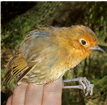
119 Grallaria (rufula) cajamarcae Ad FAP