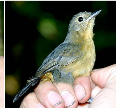
46 Myrmotherula hauxwelli hauxwelli Ad ♀ JAT 47 Myrmotherula schisticolor interior Ad ♂ CM 47 Myrmotherula schisticolor interior Imm ♂ CM 47 Myrmotherula schisticolor interior Ad ♀ CM