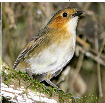
122 Grallaria erythrotis Ad JAT