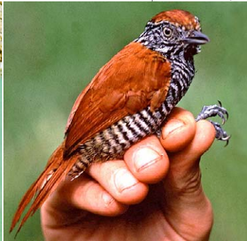
11 Thamnophilus tenuepunctatus Ad ♀ RW