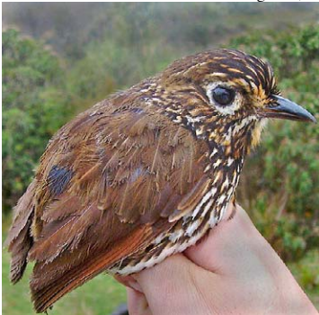
113 Grallaria andicola Ad

[RRC@fmnh.org] [www.fmnh.org/animalguides/] Rapid Color Guide #256 version 1, 11/2009