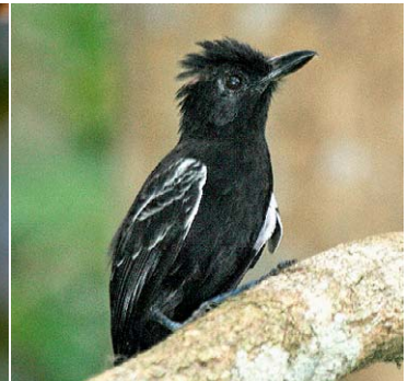
17 Thamnophilus cryptoleucus Ad ♂ KZ