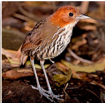
112 Grallaria ruficapilla Ad RSh