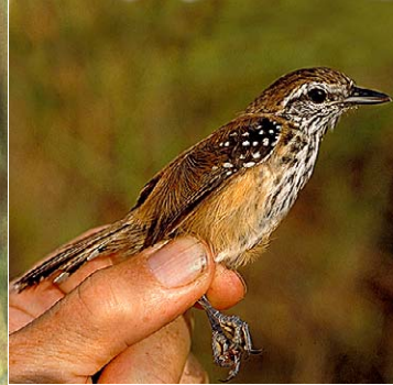
61 Formicivora rufa rufa Ad ♀ JH