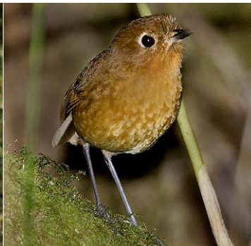
119 Grallaria (rufula) taxon nov. Ad (La Paz)