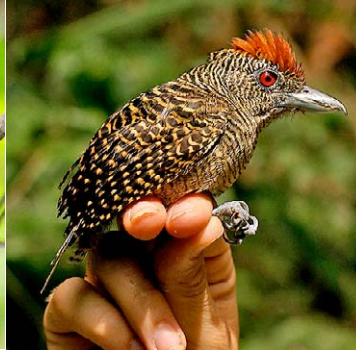
1 Cymbilaimus lineatus Ad ♀ JAT