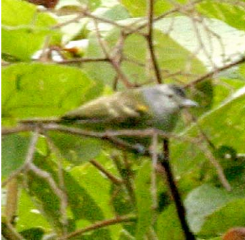
70 Terenura sharpei

© Environmental & Conservation Programs, The Field Museum, Chicago, IL 60605 USA. [RRC@fmnh.org] | www.fmnh.org/animalguides/ | Rapid Color Guide #256 version 1, 11/2009