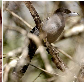
3 Batara cinerea argentina Ad ♂