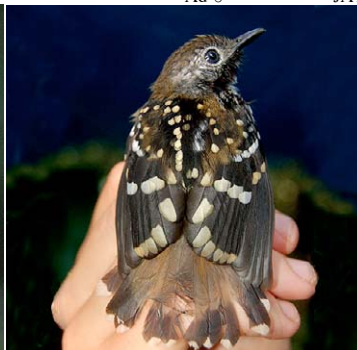
99 Hylophylax naevius Ad ♂ JJ