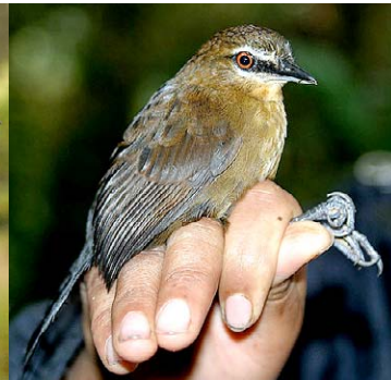
75 Pyriglena leuconota marcapatensis