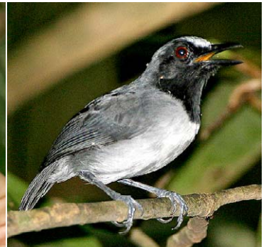
77 Myrmoborus lugubris