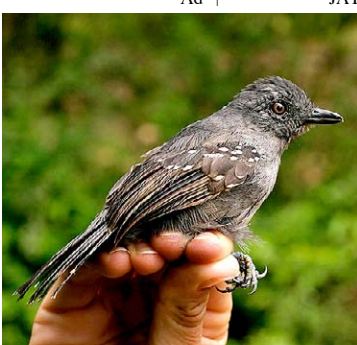
24 Thamnophilus aroyae Imm ♂ JAT