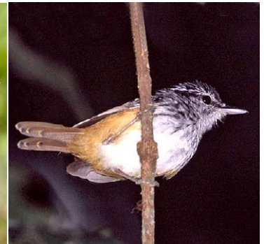
66 Hypocnemis ochrogyna Ad ♂ JAT