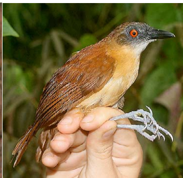
91 Myrmeciza goeldii Ad ♀