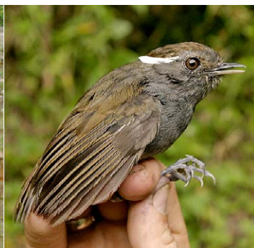
132 Conopophaga ardesiaca Ad ♂ JAT