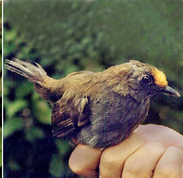
106 Formicarius rufifrons Ad HL