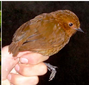
120 Grallaria blakei Ad PH