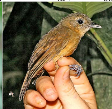
30 Thamnomanes ardesiacus ardesiacus Ad ♀ JAT