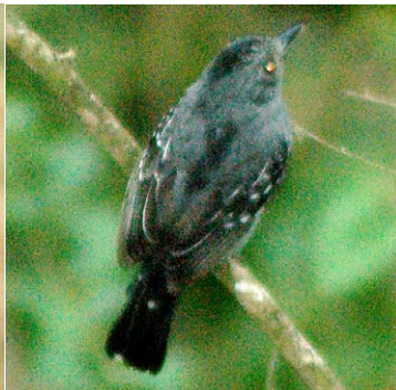
14 Thamnophilus atrinucha Ad ♂ DL