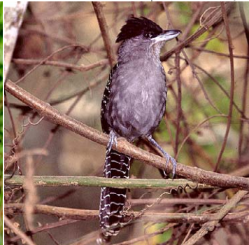
3 Batara cinerea argentina Ad ♂