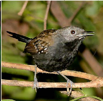
90 Myrmeciza atrothorax melanura Ad ♂ JAT