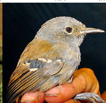
94 Myrmeciza griseiceps Ad ♂ DFL