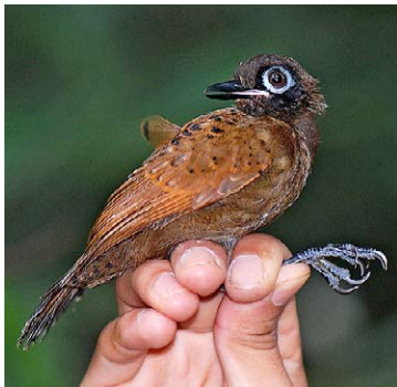
98 Rhegmatorhina melanosticta Juv JAT