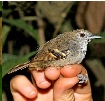
35 Epinecrophylla leucophthalma leucophthalma Ad ♂ "(brown eyes)" JAT