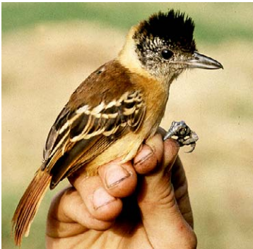
13 Thamnophilus bernardi Ad ♀ RW