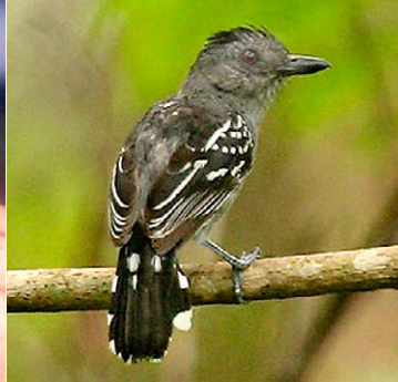
19 Thamnophilus stictocephalus Ad ♂ JAT