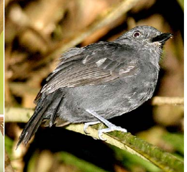
22 Thamnophilus unicolor Ad ♂ (Cusco) JAT