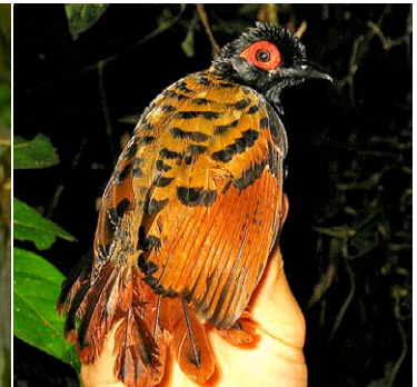
102 Phlegopsis nigromaculata bowmani Ad JAT