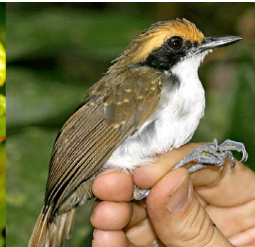
76 Myrmoborus leucophrys