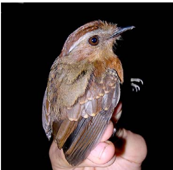
130 Conopophaga peruviana Ad ♀ PH