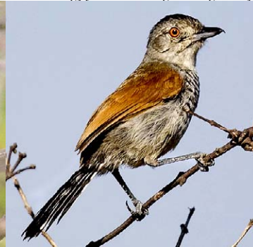
9 Thamnophilus torquatus Ad ♂ AG