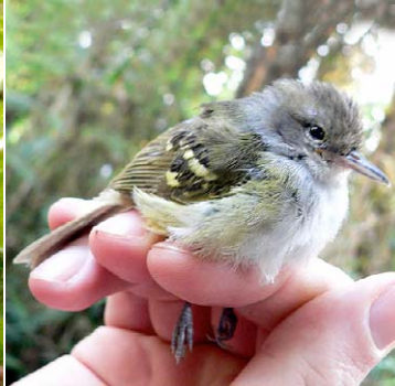
70 Terenura sharpei