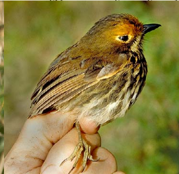
127 Grallaricula ochraceifrons Ad JH