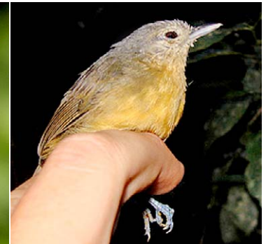
49 Myrmotherula iheringi Ad ♂ JAT 49 Myrmotherula iheringi Ad ♀ JAT 50 Myrmotherula grisea Ad ♂ 50 Myrmotherula grisea Ad ♀