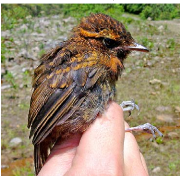
131 Conopophaga castaneiceps brunneinucha Juv PH