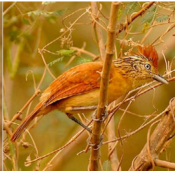
7 Thamnophilus doliatus radiatus Ad ♀ JAT