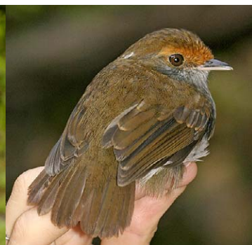
132 Conopophaga ardesiaca Ad ♀ JAT