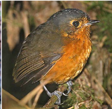
129 Grallaricula nana nana Ad JAT