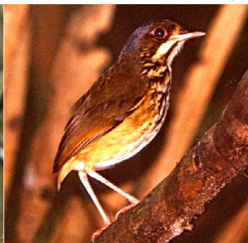
123 Hylopezus auricularis Ad JAT