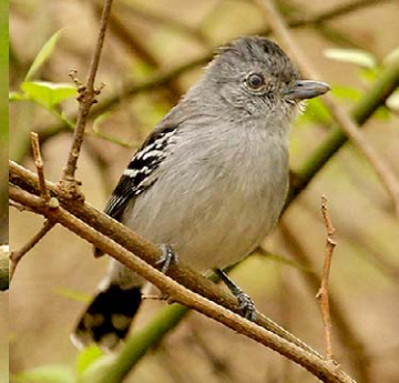
20 Thamnophilus sticturus Ad ♂ JAT