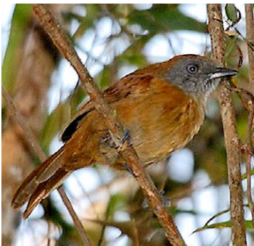
22 Thamnophilus unicolor Ad ♀ JAT