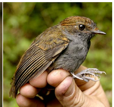
132 Conopophaga ardesiaca Juv JAT