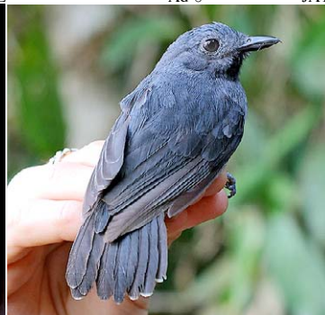
30 Thamnomanes ardesiacus ardesiacus Ad ♀ DFL