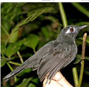
93 Myrmeciza fortis Ad ♂