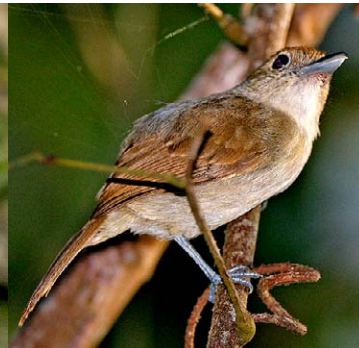
16 Thamnophilus murinus murinus Ad ♀ JAT