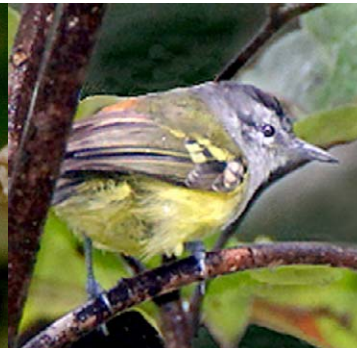
68 Terenura callinota Ad ♂ JAT