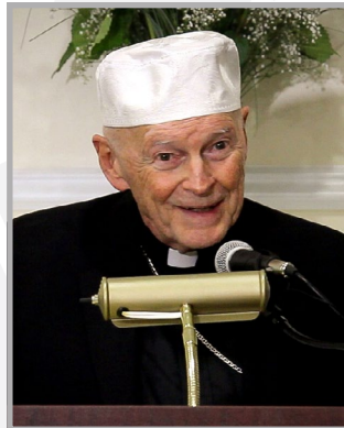
H.E. CARDINAL THEODORE MCCARRICK 2013