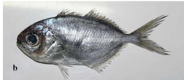
Fig. 1. A. brevimanum of 605 mm standard length (a) and A. indicum of 142 mm standard length (b) recorded from landings in Cochin Fisheries Harbour.