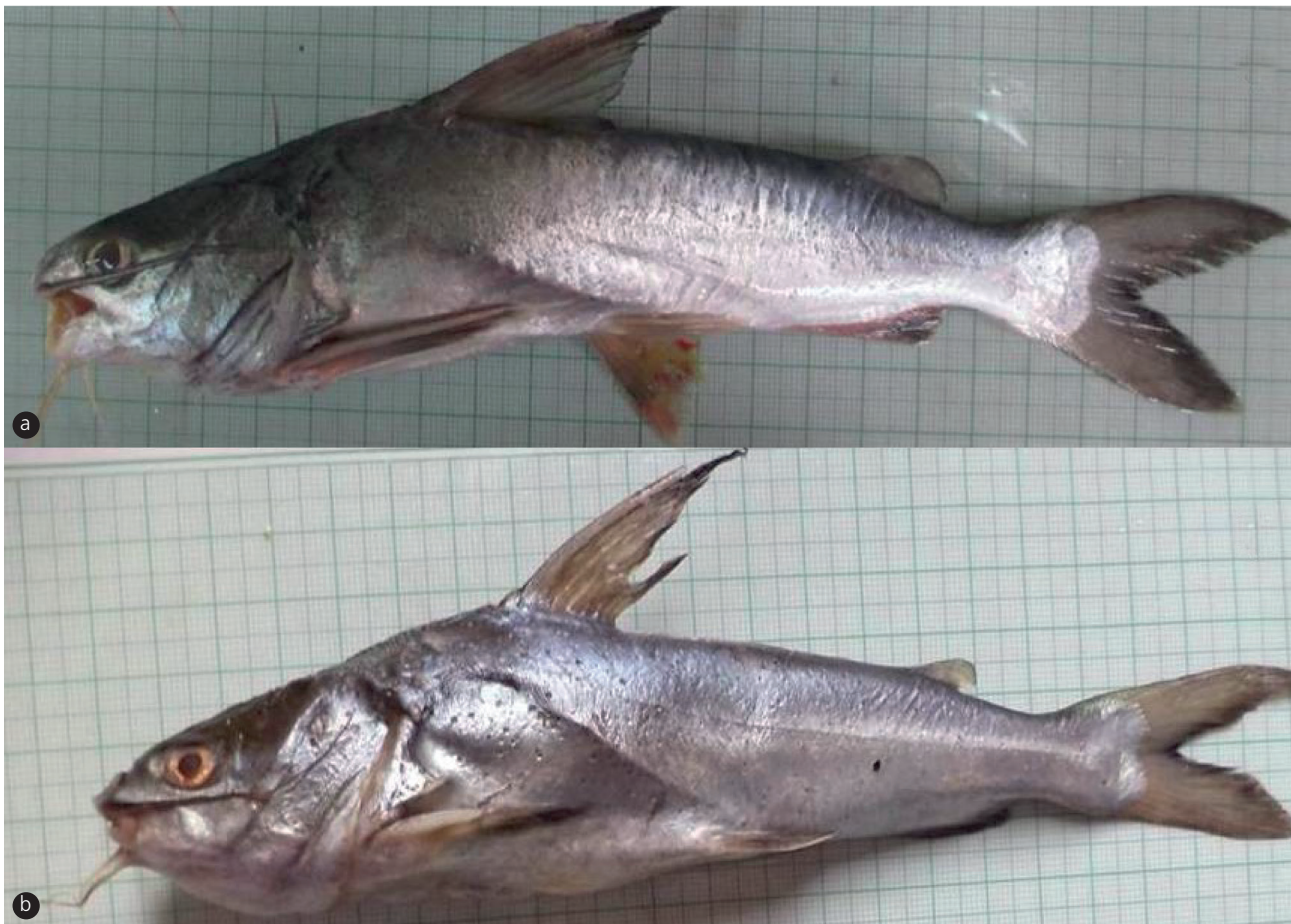
Fig 1. a) Arius venosus ; b) Arius sumatranus

A. sumatranus and A. venosus having smaller teeth patches with villiform teeth (non-maculatus complex) (Dhanze and Jayaram. 1982). The non-maculatus complex does not contribute much to the commercial fishery barring A. subrostratus which forms minor fishery along southwest coast of India. A. subrostratus can be easily differentiated from rest of the con-generic members by smaller barbels and long snout with small mouth. The other two members