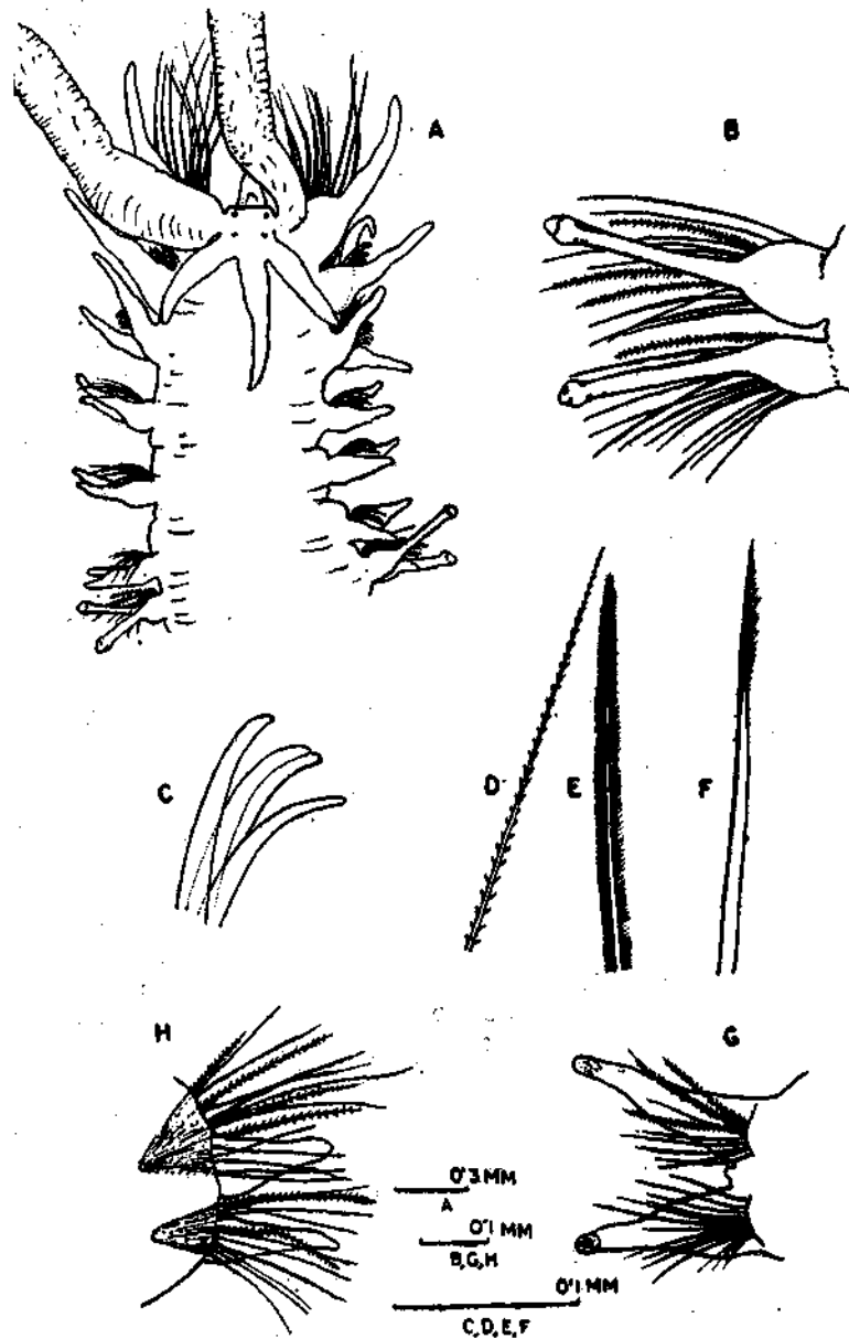
FIG. 2. Poecilochaetus serpens Allen—A. Anterior region dorsal view; B. Parapodium from ninth setiger; C. Acicular setae from second setiger; D. and E. Tip of spinose and plumose setae from ninth setiger; F. Spine like seta with distal tuft from fiftieth setiger; G. Sixth parapodium in anterior view; H. Twenty-fifth parapodium in anterior view.

in the form of antenna, arises at the posterior margin of the prostomium, the lateral lobe reaching up to the third setiger and the median to the fourth (Fauvel describes that the two lateral attains up to the 4th setiger and the median still longer—