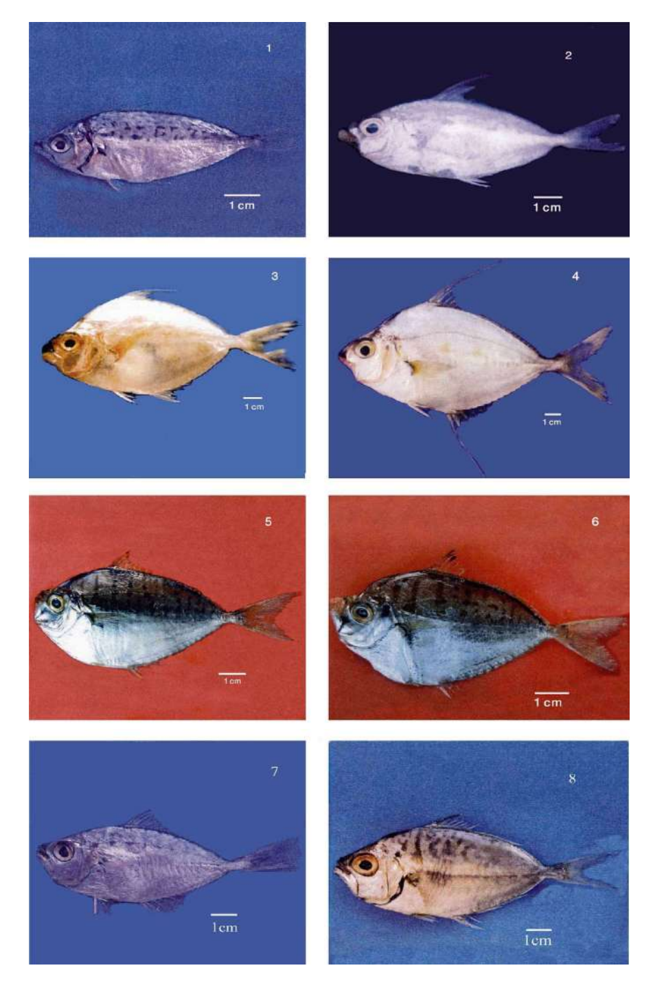
PLATE II. 1. Equulites absconditus Chakrabarty and Sparks, 2010; 2. Equulites leuciscus (Günther, 1860); 3. Aurigequula fas- ciata (Lacepède, 1803); 4. Aurigequula longispina (Valenciennes, 1835); 5. Secutor insidiator (Bloch, 1787); 6. Secutor ruco-nius (Hamilton, 1822); 7. Gazza minuta (Bloch, 1797); 8. Gazza achlamys Jordan and Starks, 1917.