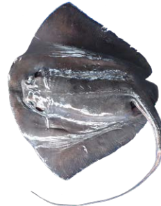
2M. Pteroplatytrygon violacea