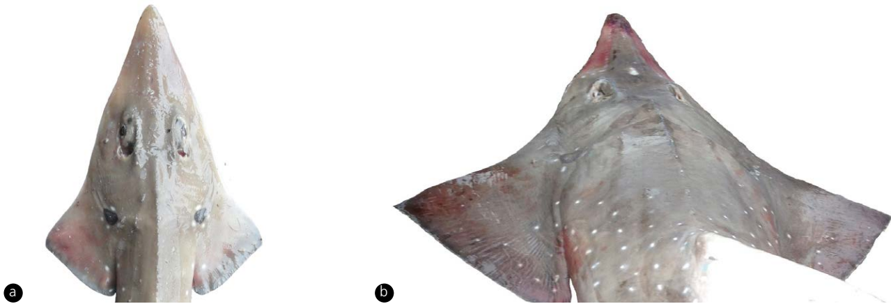
Fig. 3. Pectoral spot forms in Rhynchobatus laevis . A) Juvenile, B) Adult.

maximum size reported globally was 146 cm DW. The IUCN Red List of Threatened Species assessed the species as Vulnerable (VU).