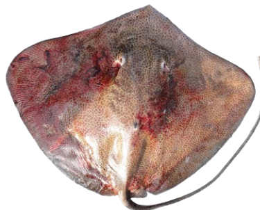
2Fe. Himantura leoparda