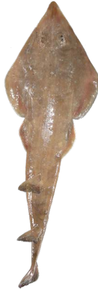
2D. Rhinobatos lionotus