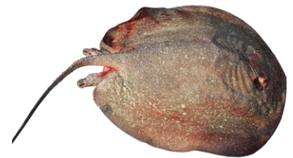
2Q. Urogymnus asperrimus