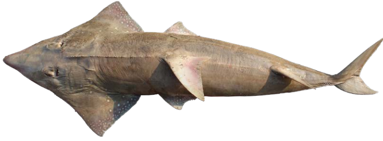
2A. Rhynchobatus australiae