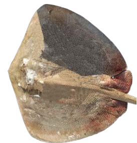
2Ga. Himantura tutul