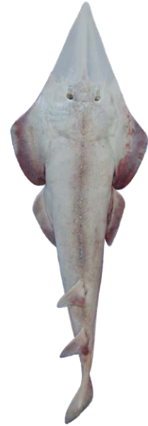
2E. Glaucostegus granulatus