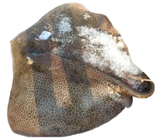
2Fc. Himantura leoparda