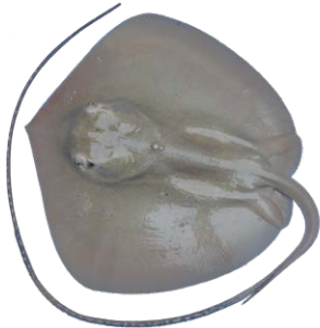
2Ib. Maculabatis arabica (juvenile)