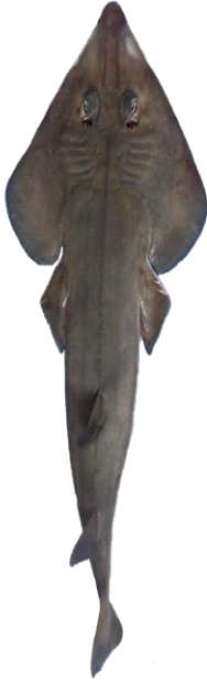
2C. Rhinobatos punctifer