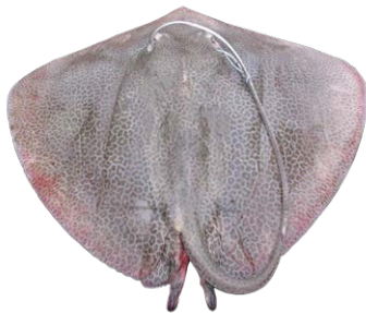
2Fd. Himantura leoparda