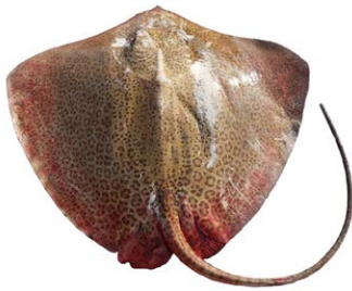
2Fa. Himantura leoparda