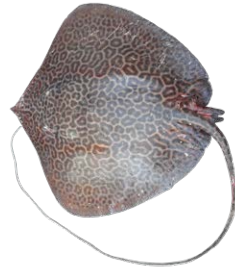
2H. Himantura undulata