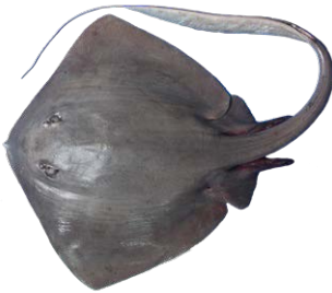
2L. Pastinachus gracilicaudus