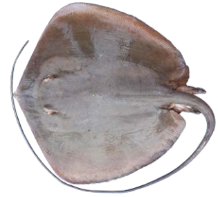
2Ia. Maculabatis arabica