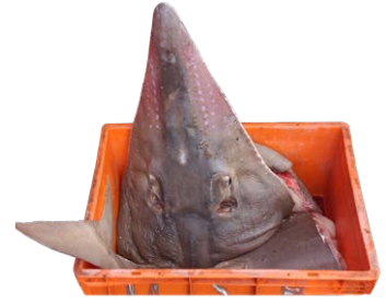
2B. Rhynchobatus laevis