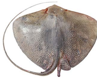
2Fb. Himantura leoparda