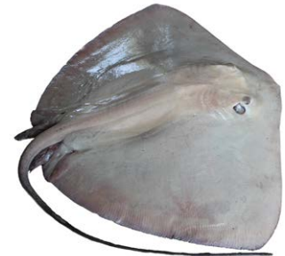
2N. Pateobatis fai