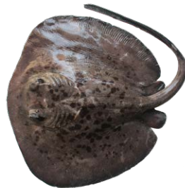
2P. Taeniurops meyeri