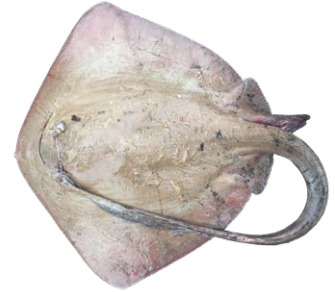
2K. Pastinachus ater