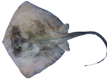
2J. Neotrygon indica