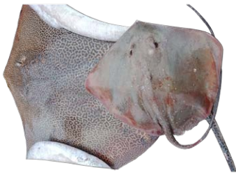
2Gb. Himantura tutul