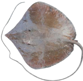
2O. Pateobatis bleekeri