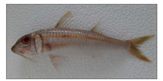
Fig. 3. Mulloidichthys flavolineatus (Lacepède, 1801)