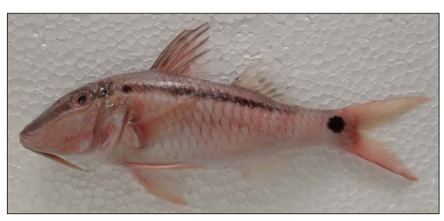
Fig. 5. Parupeneus barberinus (Lacepède, 1801)

Parupeneus barberinus (Lacepède, 1801): Whitish body with a black stripe from upper lip through eye towards the posterior part of the second dorsal fin, stripe darker in dorsal fin region; a black spot on the mid-base of caudal fin;