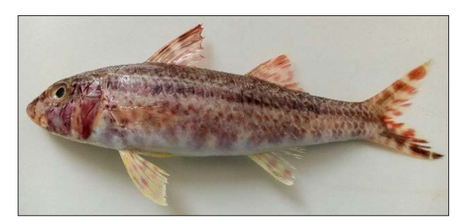
Fig. 14. Upeneus tragula Richardson, 1846