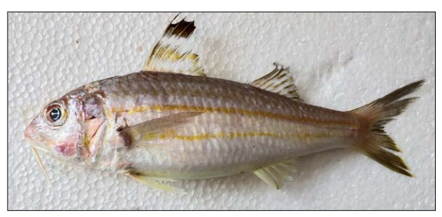
Fig. 13. Upeneus sulphureus Cuvier, 1829

Upeneus margarethae Uiblein and Heemstra, 2010: Body with red colour above the lateral line and white ventrally; lateral body with small red dots; red bars on caudal fin; barbels white; pectoral fin rays 14; lateral line scales 28-30.