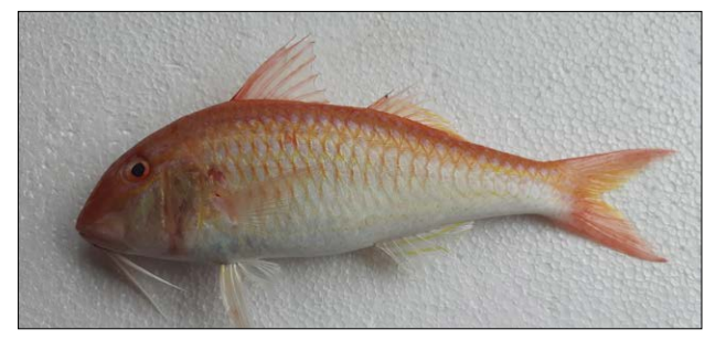
Fig. 7. Parupeneus heptacanthus (Lacepède, 1802)

body ventrally whitish; dorsally yellowish; barbels whitish; pectoral rays 17.