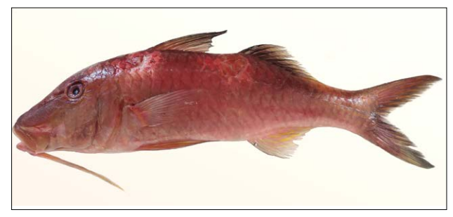
Fig. 6. Parupeneus cyclostomus (Lacepède 1801)