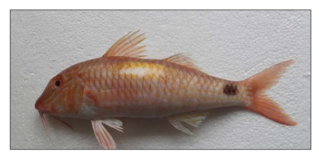
Fig. 8. Parupeneus indicus (Shaw, 1803)

Most of the species of the genus Upeneus occur in shallow depths of less than 100 m (Uiblein and Heemstra, 2010).