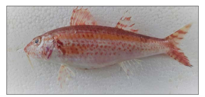
Fig. 11. Upeneus margarethae Uiblein & Heemstra, 2010