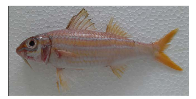
Fig. 2. Mulloidichthys ayliffe Uiblein, 2011

Mulloidichthys ayliffe Uiblein, 2011: Body yellowish to orange; fins yellow; body and head with two to five bluish lateral