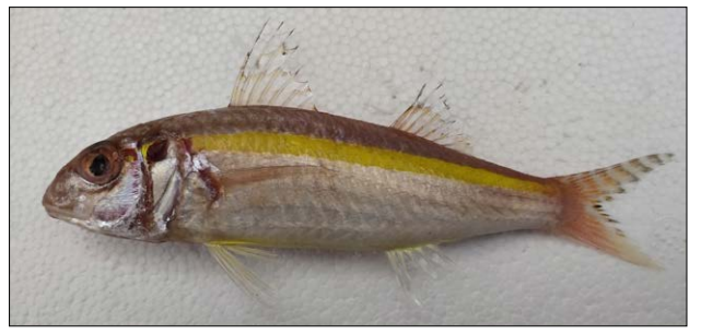
Fig. 12. Upeneus moluccensis (Bleeker, 1855)