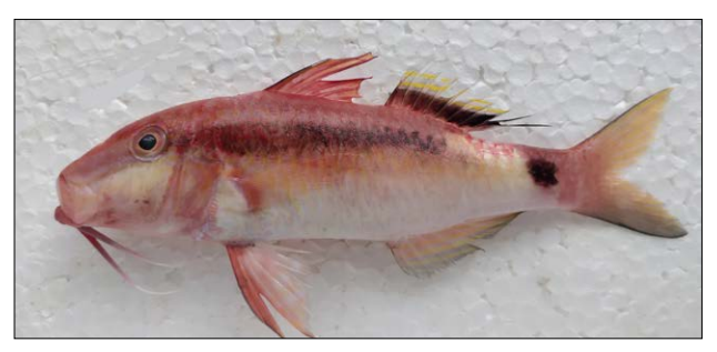
Fig. 9. Parupeneus macronemus (Lacepède 1801)