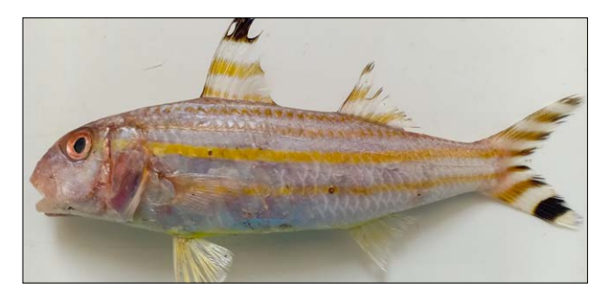
Fig. 15. Upeneus vittatus (Forsskål 1775)