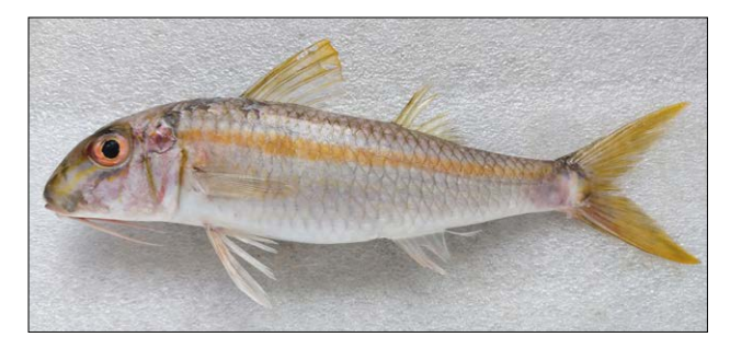
Fig. 4. Mulloidichthys vanicolensis (Valenciennes, 1831)