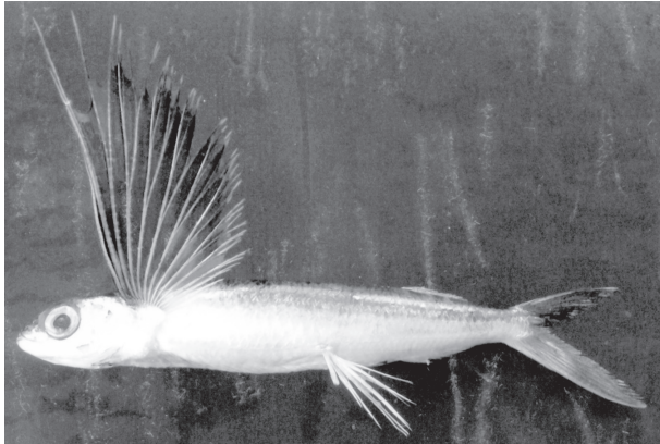
Plate 3. Hirundichthys oxycephalus (Bleeker, 1852)