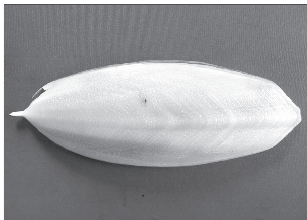
Fig. 2. Dorsal view of cuttlebone of S. elliptica

this, they may not have been reported from Maharashtra waters. S. elliptica can be easily identified from S. aculeata by its cuttlebone which is distinctly shaped and also by the presence of prominent markings on all the arms (Fig. 4).