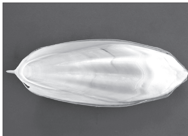
Fig. 3. Ventral view of cuttlebone of S. elliptica

Narasimham et al. (1993), Kasim (1993), Mohamed (1999) and Meiyappan et al. (2000) have also mentioned the occurrence of this species from Cochin and Veraval waters. Sivasubramanian (1991) has reported this species from the Bay of Bengal up