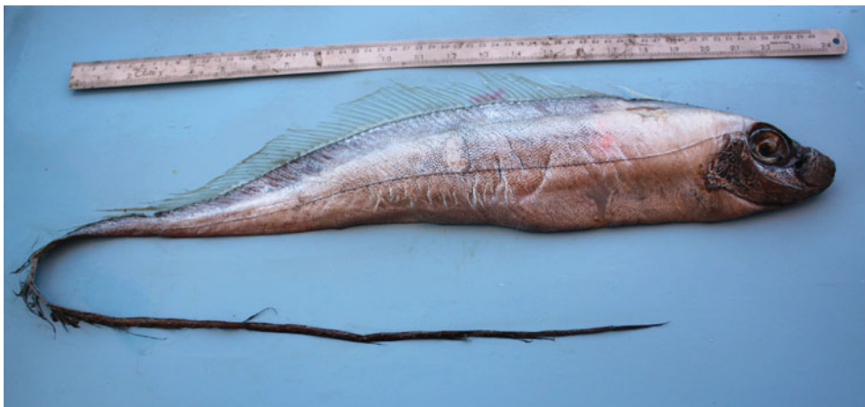
Fig. 2. Desmodema polystictum , 107 cm total length, caught off Tuticorin south-east coast of India.

Body strongly compressed laterally, dorsal spines nil, soft rays 121; post-anal portion of body narrowing into a whip-like tail. Seven pterygophore before first neural spine and one or two pterygophore between first and second neural spines. First pterygophore closely applies to back of skull, no predorsal bones. Caudal fin well-developed, 4–10 unbranched rays parallel to axis of tail. All caudal rays borne on last ural centrum. No ventral caudal lobe. Fin rays with a lateral row of small spines, spines weak or absent on posterior pelvic rays, middle caudal rays and pectoral rays. Each dorsal ray anterior to elongated tail portion of body with a single laterally directed stout spine on either side of the base. Lateral line ends at caudal base, lateral-line scales with a pair of spines. Skin with cartilaginous tubercles and pierced by numerous pores which seems to be pores of the lateral line which is in agreement with Walters (1963). Teeth restricted to one to four in