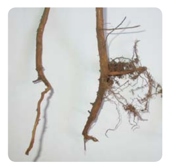
Damage to seedlings. Note loss of roots (Pham Quang Thu)