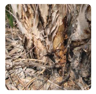
Zeuzera coffeae damage on Melaleuca. Note frass around tree base (Pham Quang Thu)