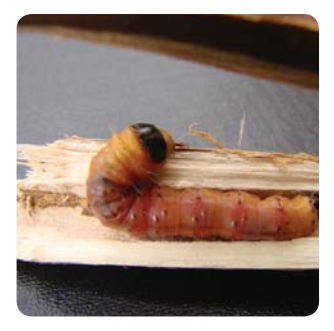
Zeuzera coffeae larva (Pham Quang Thu)