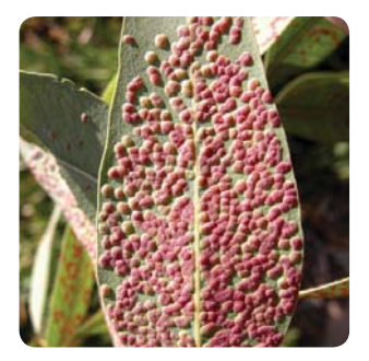
Small, pimple-like, nearly round galls on leaf surface (Alex Protasov)