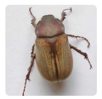
Holotrichia trichophora adult