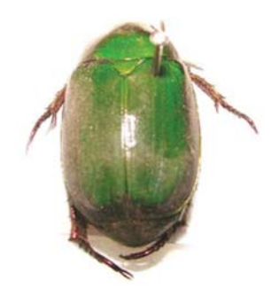
Adult beetle (Pham Quang Thu)