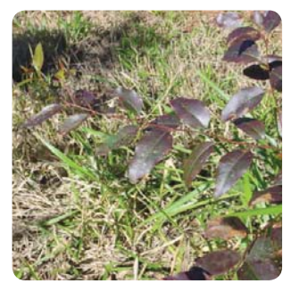
Purple colouring on the upper leaf surface is often associated with infection by T. epicoccoides (Geoff Pegg)