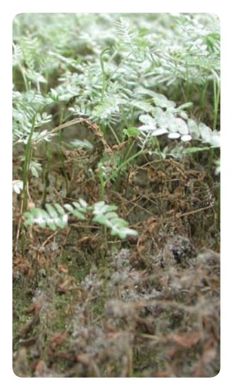
Powdery mildew occasionally causes death of seedlings (Pham Quang Thu)