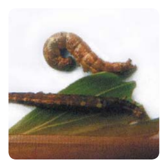
Larvae, showing feeding damage to leaves (Nguyen The Nha)