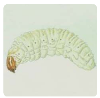
Typical weevil larva (Judy King)