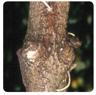
Xylosandrus crassiusculus exit holes and frass tubes