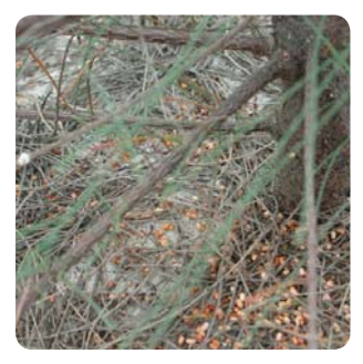
Zeuzera coffeae damage on young Casuarina (Pham Quang Thu)