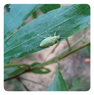
Hypomeces squamosus adult (Pham Quang Thu)