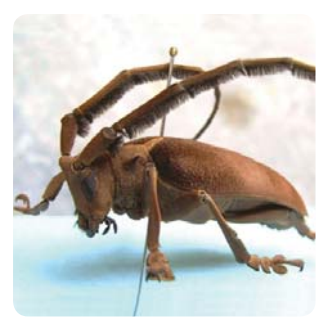
Sarothrocera lowi adult (Pham Quang Thu)