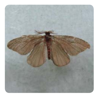
Pteroma plagiophleps adult male (Pham Quang Thu)