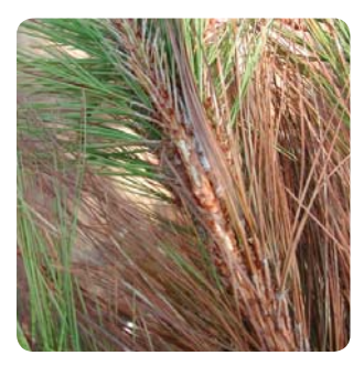
Adult feeding damage to twigs (Pham Quang Thu)