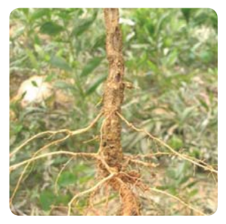
Termite damage to Acacia (Pham Quang Thu)