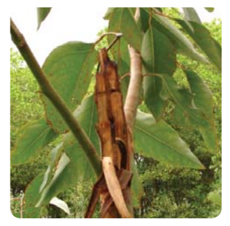
Zeuzera coffeae damage on Eucalyptus (Pham Quang Thu)