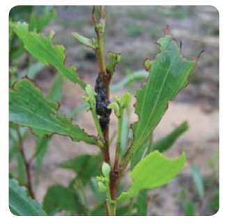
Adult feeding damage showing feeding from leaf edge inwards (Pham Quang Thu)