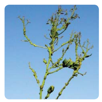
Severe galling damage (Zvi Mendel)