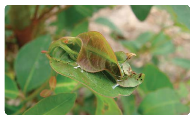
Larvae roll a leaf to form a shelter (Pham Quang Thu)