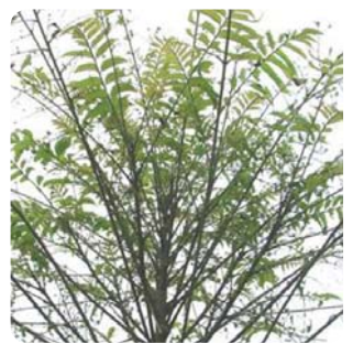
Adult damage to young and expanding leaves (Pham Quang Thu)