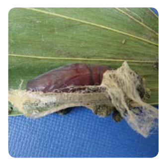
Speiredonia retorta pupa