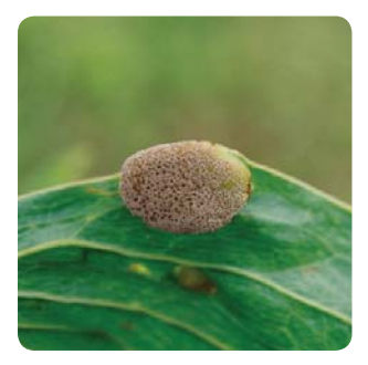
Blisters expand and become cinnamon brown in colour, covered with spores (Geoff Pegg)

Initial symptoms of phyllode rust may be present as chlorotic areas more or less circular in shape and associated with a small blister (Geoff Pegg)