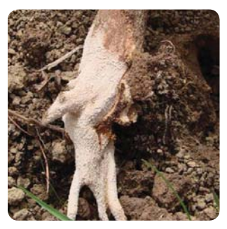
Termite damage to Eucalyptus (Pham Quang Thu)