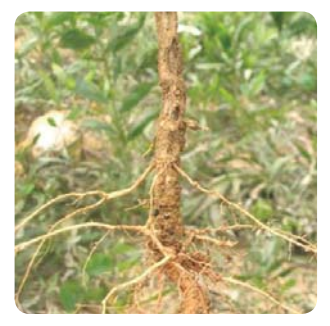
Termite damage to Acacia (Pham Quang Thu)