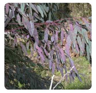
Galls on leaves (Alex Protasov)