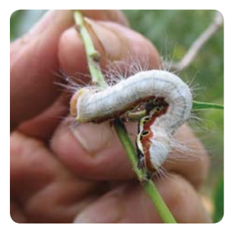
Fully grown Phalera grotei larva (Le Van Binh)