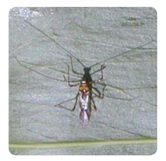
Helopeltis theivora