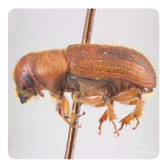
Dendroctonus valens adult