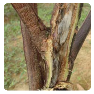
A dark discolouration may be evident under the bark of the infected area (Pham Quang Thu)