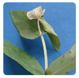
Shoot death associated with infection by Quambalaria simpsonii (Pham Quang Thu)