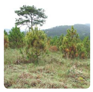
Branch dieback associated with infection by pine blister rust, Cronartium flaccidum (Pham Quang Thu)