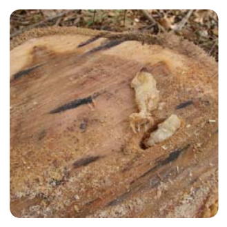
Larvae in stem tunnels (Pham Quang Thu)