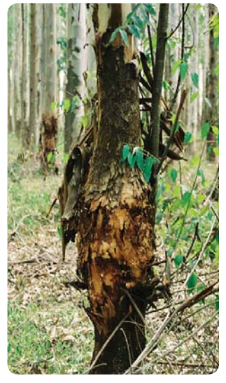
Basal swelling on Eucalyptus hybrid caused by Chrysoporthe cubensis (Geoff Pegg)