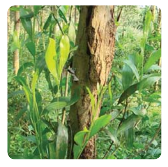
Areas of dead bark and sunken lesions associated with Botryosphaeria spp. extending along branch and stem axes (Pham Quang Thu)