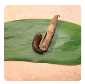
Pteroma plagiophleps larva removed from shelter (Pham Quang Thu)