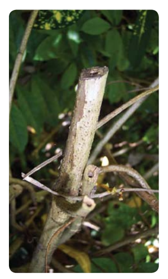
Fruiting structures are produced either on the bark surface or in fissures and can be present on other host species such as Tibouchina spp. (Geoff Pegg)