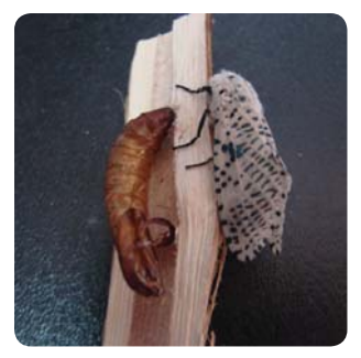
Zeuzera coffeae adult and pupal case (Pham Quang Thu)