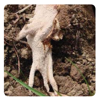
Termite damage to Eucalyptus (Pham Quang Thu)