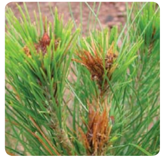
Damaged shoots (Pham Quang Thu)