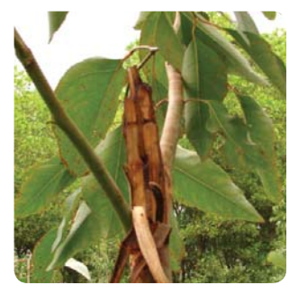
Zeuzera coffeae damage on Eucalyptus (Pham Quang Thu)