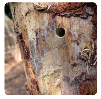
Adult Monochamus emergence hole (Jijing Song & Juan Shi)