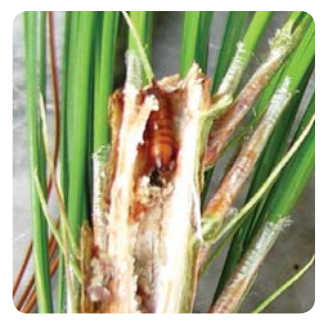
Dioryctria abietella pupa