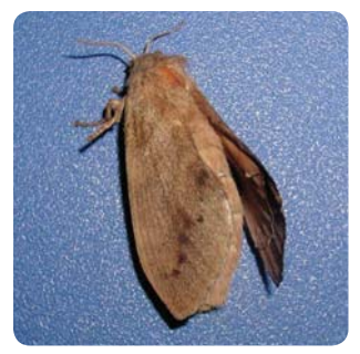
Dendrolimus punctatus adult female (Pham Quang Thu)