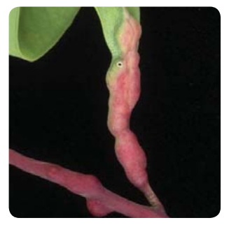
Gall showing characteristic red colour and wasp exit hole (Zvi Mendel)