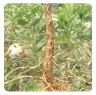
Termite damage to Acacia (Pham Quang Thu)