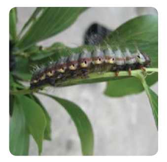
Phalera grotei fifth instar larva