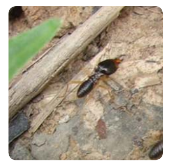
Macrotermes sp.