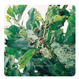
Infected phyllodes, shoot tips, petioles and fruits may become malformed and covered in galls or blister-like swellings