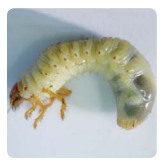
Holotrichia trichophora larva