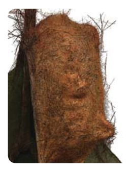
Cocoon attached to twig and containing stinging hairs (David L Mohn)