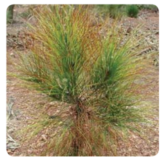
Infection of young pine tree where the ends of infected needles above the lesions have turned brown (Pham Quang Thu)