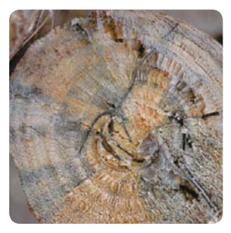
Timber staining caused by fungus (G Keith Douce)