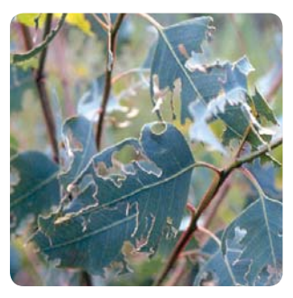
Typical scarab feeding damage on Eucalyptus (Simon Lawson)