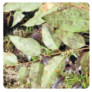
Teratosphaeria epicoccoides can sometimes be seen as a sooty blotch on otherwise healthy leaves (Geoff Pegg)