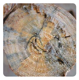
Timber staining caused by fungus