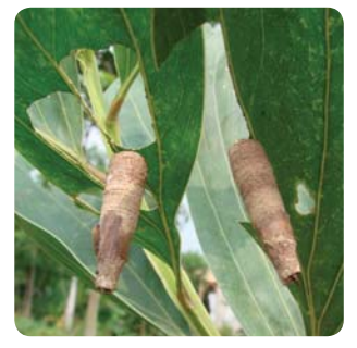
Pteroma plagiophleps larval shelter and leaf damage (Pham Quang Thu)