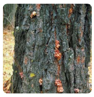
Dendroctonus valens pitch tubes (Bob Oakes)