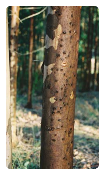
Elliptical lesions covered by dead bark covering giving a 'cat-eye' appearance (Geoff Pegg)