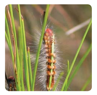
Later instar larvae. Note stinging hairs