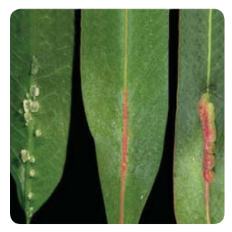
Stages of gall formation on leaves and leaf midribs (Zvi Mendel)