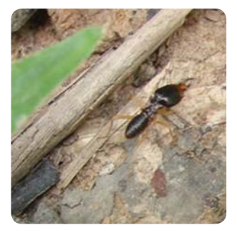
Macrotermes sp.