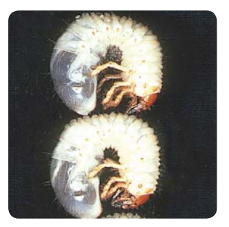
Typical C-shaped scarab larvae (Judy King)