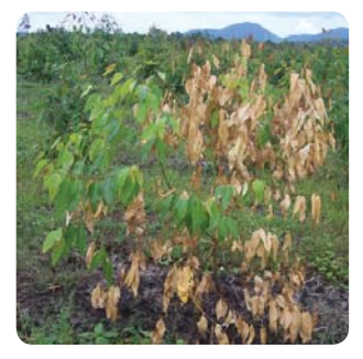
Sudden wilting and death of branches caused by bacterial wilt (Geoff Pegg)