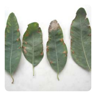
Mycosphaerella marksii