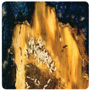
Larval galleries beneath bark (Ladd Livingston)