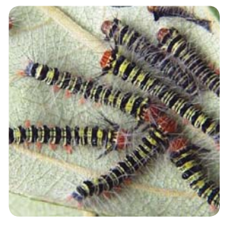
Second instar larvae. Note the twin horns and characteristic red feet and head (David L Mohn)