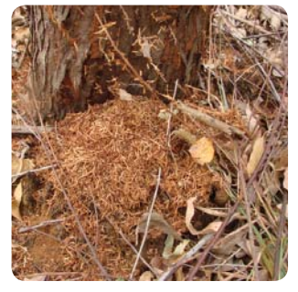
Frass at the base of an attacked tree (Pham Quang Thu)