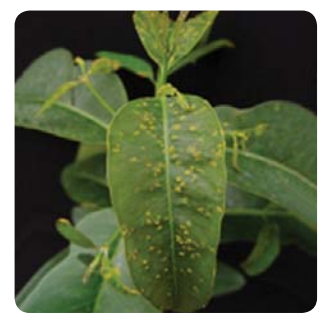
Rust pustules on Eucalyptus leaf (Acelino C Alfenas)