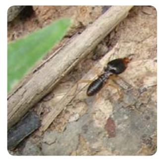
Macrotermes sp.