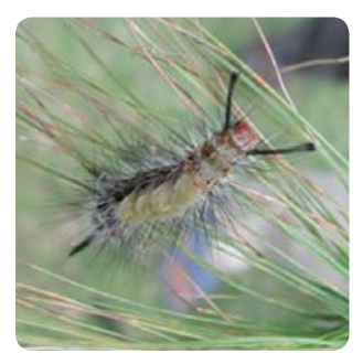
Dasychira axutha larva