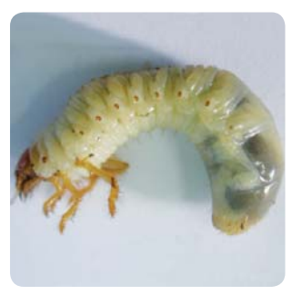
Holotrichia trichophora larva