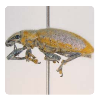
Hypomeces squamosus adult. Note yellow scales (Amy Carmichael)