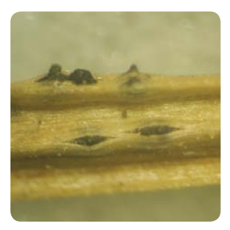
Small, black fruiting bodies are produced on the diseased tissue, resulting in a rupturing of the epidermal tissue (Pham Quang Thu)