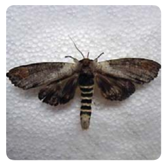
Phalera grotei adult (Le Van Binh)