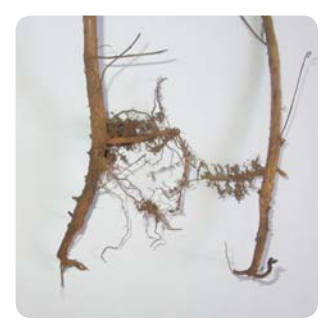
Damage to seedlings. Note loss of roots (Pham Quang Thu)