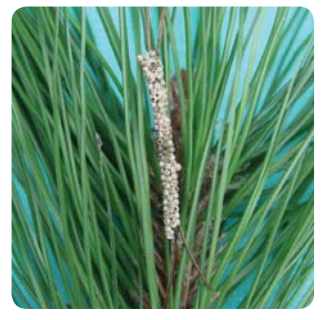
Dasychira axutha egg mass attached to pine needles (Pham Quang Thu)