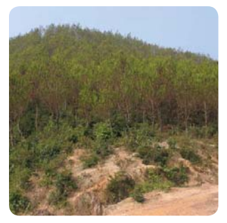
Damage on P. massoniana