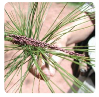
Dendrolimus punctatus eggs (Pham Quang Thu)