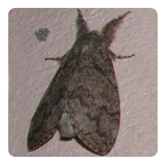
Dasychira axutha adult female with eggs (Pham Quang Thu)