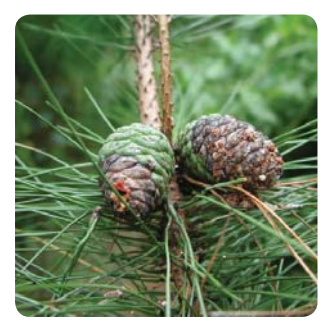
Damaged cones (Pham Quang Thu)