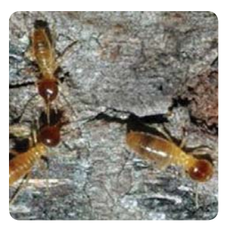
Nasutitermes sp.