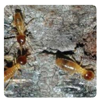
Nasutitermes sp.