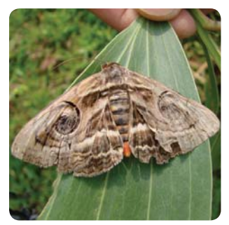
Speiredonia retorta adult