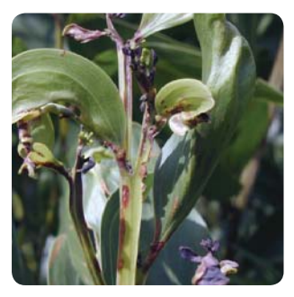
Early damage appears as a lesion or area of necrosis around the feeding site (Pham Quang Thu)