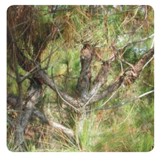
Branch gall on Pinus kesiya associated with infection by pine gall rust, Cronartium orientale