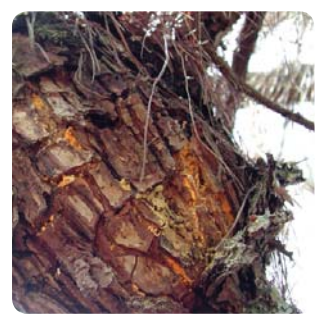
Gall covered in fruiting bodies of Cronartium orientale (Pham Quang Thu)