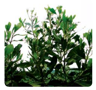
Feeding damage in the crown of Acacia mangium (Pham Quang Thu)