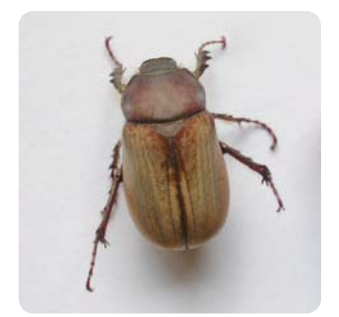
Holotrichia trichophora adult