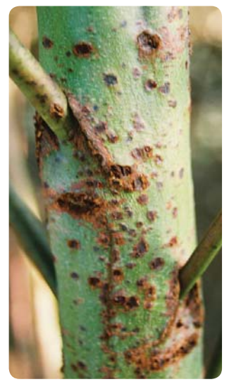
Small, circular necrotic lesions on the green stem tissue in the upper parts of trees or stems of young saplings (Geoff Pegg)