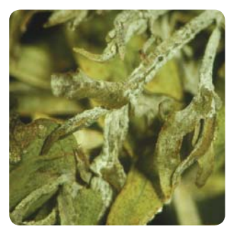
Infected shoots covered in conidiophores and conidia of Quambalaria simpsonii (Pham Quang Thu)