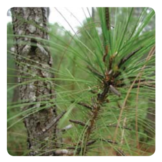
Early instar larvae