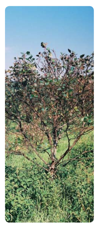
Infection can be associated with significant levels of defoliation, usually initiated in the lower canopy (Geoff Pegg)