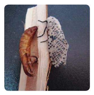
Zeuzera coffeae adult and pupal case (Pham Quang Thu)