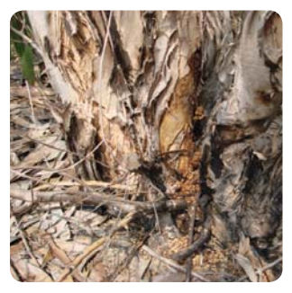
Zeuzera coffeae damage on Melaleuca. Note frass around tree base (Pham Quang Thu)