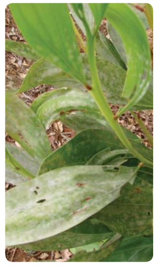
Symptoms of infection by Oidium spp., powdery mildew, occur as cobweb-like or powdery white patches of hyphae and spores (Pham Quang Thu)