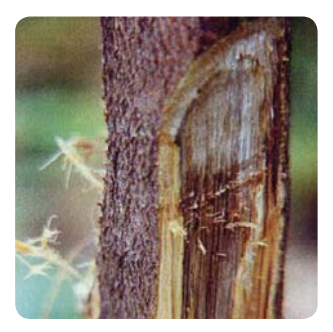
Dark staining in the stem associated with bacterial wilt (Pham Quang Thu)