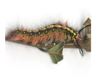
Mature larva showing pre-pupal colour change