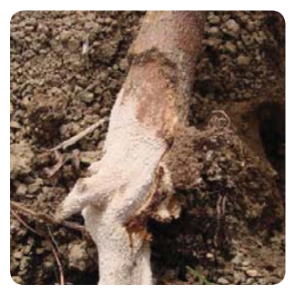
Termite damage to Eucalyptus (Pham Quang Thu)