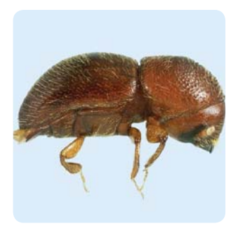
Xylosandrus crassiusculus adult (Natasha Wright)