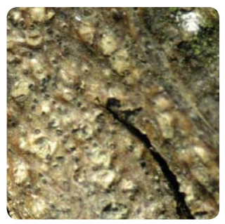
Fruiting bodies of Botryosphaeria spp. are typically partially submerged in the outer bark (Pham Quang Thu)