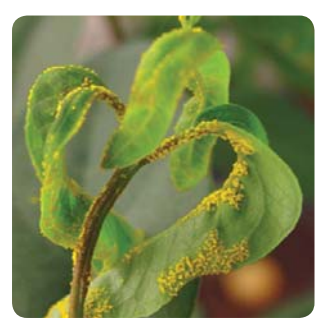
Rust infection of new shoots and young stems (Acelino C Alfenas)