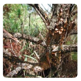
Orange-yellowish fruiting bodies of Cronartium flaccidum on the stem of Pinus kesiya (Pham Quang Thu)