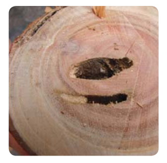
Larval tunnels in stem