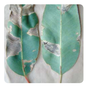
Mycosphaerella cryptica (Geoff Pegg)