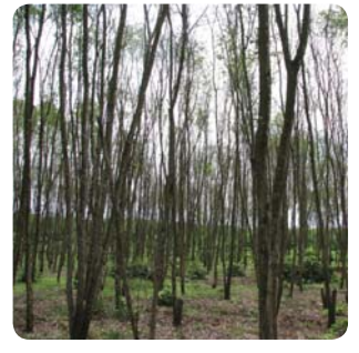
Outbreak populations can defoliate A. auriculiformis (Dao Xuan Uoc)