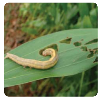
Speiredonia retorta early instar larvae make small holes in young leaves