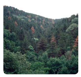
Dendroctonus valens damage to Pinus tabuliformis , China (Donald Owen)