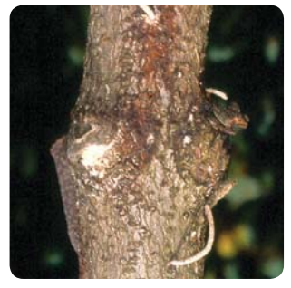
Xylosandrus crassiusculus exit holes and frass tubes (JR Baker & SB Bambara)