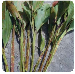
Feeding damage to young shoots leads to wilt, dieback and shoot death (Pham Quang Thu)