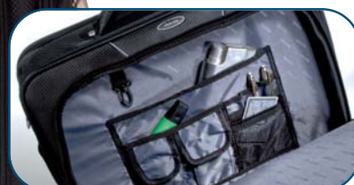
Front pocket with organizer