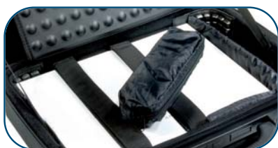
Padded notebook compartment