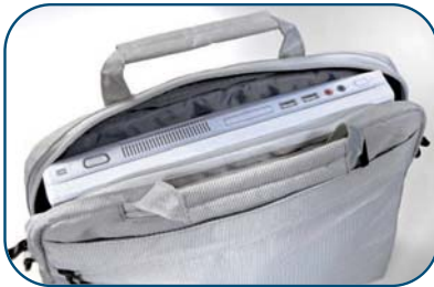
Padded notebook compartment