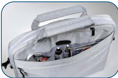
Front pocket with organizer