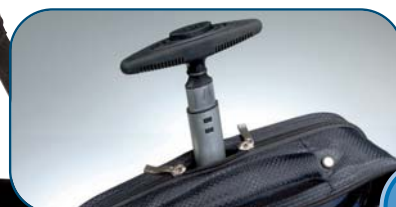
Comfort and stable telescop handle