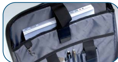
Padded notebook compartment