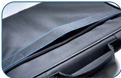
Trolley band and document compartment

Practicle notebook bag made of polyester, in 3 sizes.