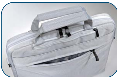
Compartment on the back side

NB VN 10 BL ctn qty. 20 EDP-No. 26630 Notebook Bag "Vienna" for 7 – 10,2" notebooks, black