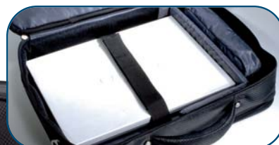
Padded notebook compartment