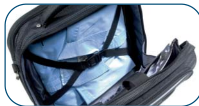
Rubberband to fix clothes