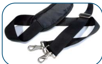
Moveable shoulder strap with metal hooks