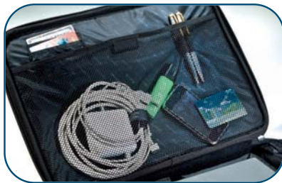
Big mesh pocket for accessories