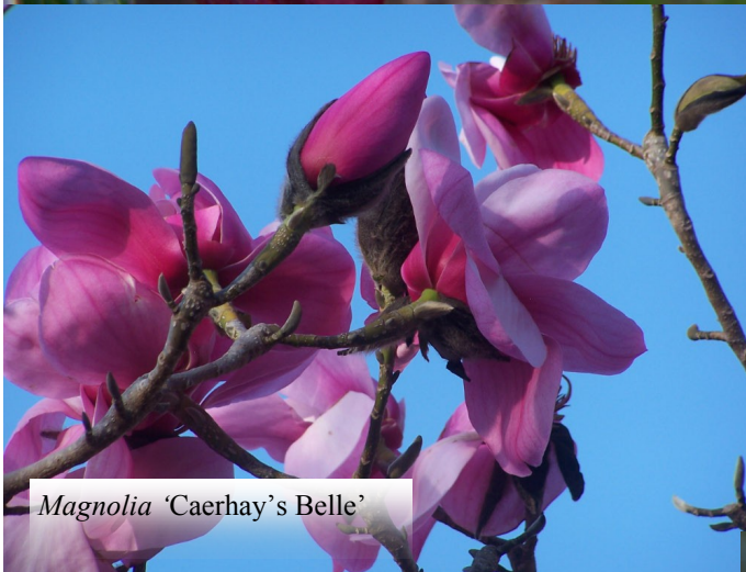
Magnolia 'Caerhay's Belle'