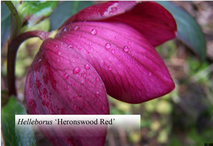
Helleborus 'Heronswood Red'