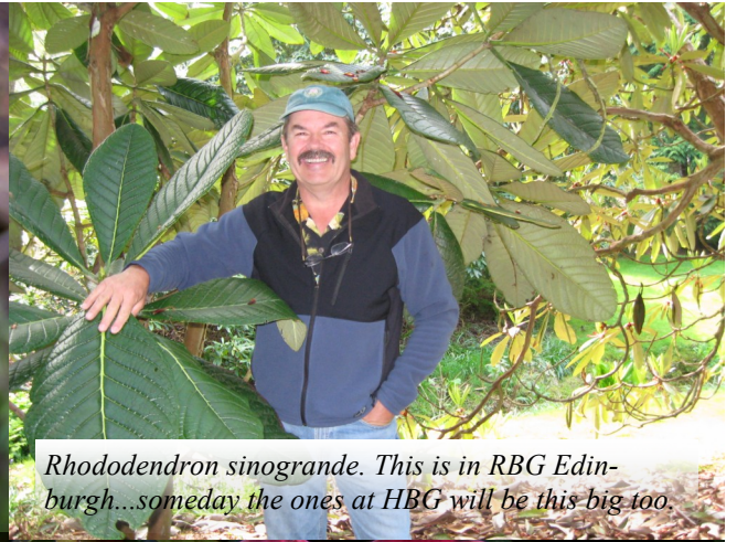
Rhododendron sinogrande . This is in RBG Edinburgh...someday the ones at HBG will be this big too.