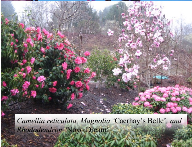
Camellia reticulata, Magnolia 'Caerhay's Belle', and Rhododendron 'Noyo Dream'