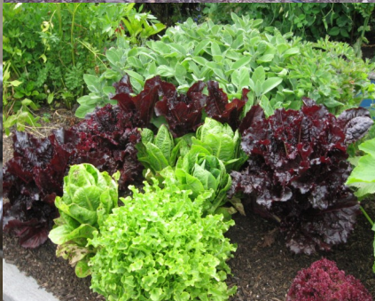
Finally the rain has come and is flowing. Lettuces loving the rain.