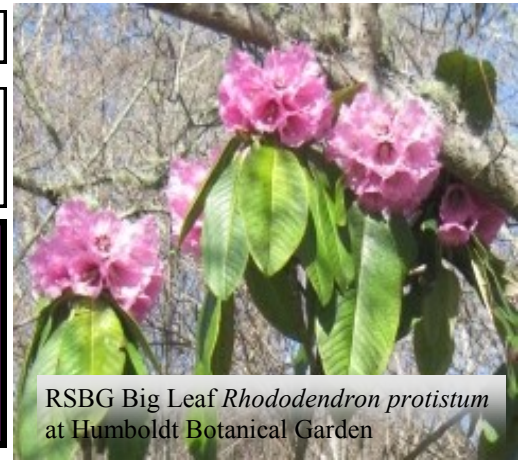
RSBG Big Leaf Rhododendron protistum at Humboldt Botanical Garden

Bayfront Restaurant, 1 F Street, Eureka, Call Nelda, 707-443-8049 For a reservation so there will be enough seating