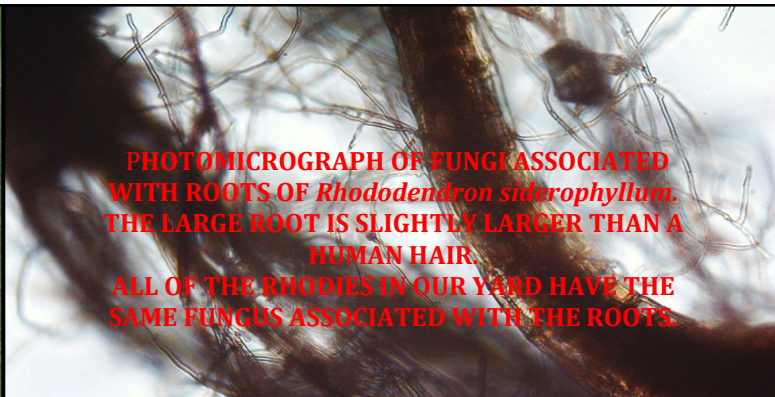
PHOTOMICROGRAPH OF FUNGI ASSOCIATED WITH ROOTS OF Rhododendron siderophyllum . THE LARGE ROOT IS SLIGHTLY LARGER THAN A HUMAN HAIR. ALL OF THE RHODIES IN OUR YARD HAVE THE SAME FUNGUS ASSOCIATED WITH THE ROOTS.