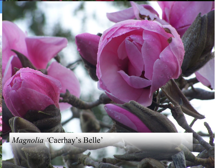
Magnolia 'Caerhay's Belle'