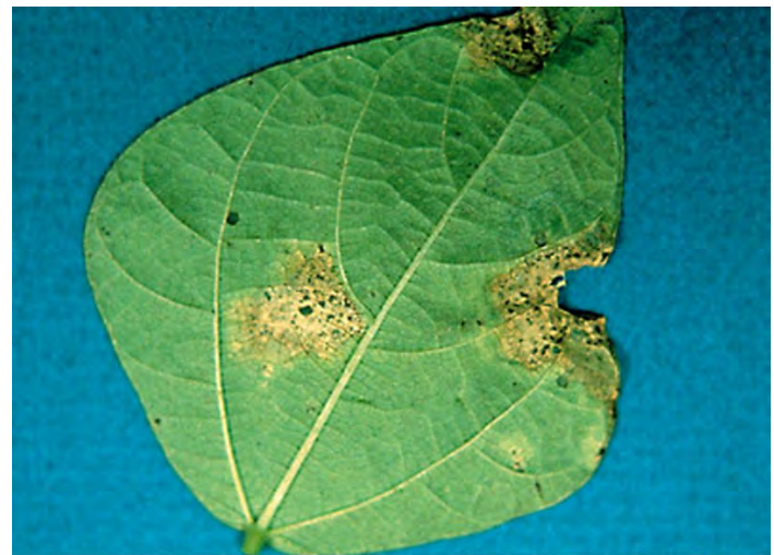
Figure 1. Symptoms of common bacterial blight on a lower leaf surface of bean, caused by Xanthomonas campestris pv. phaseoli . (Courtesy APS, A. W. Saettler).

Leaf symptoms initially appear as water-soaked spots that gradually enlarge, become flaccid and then necrotic (Figure 1), and are often bordered by a small zone of lemon yellow tissue. Lesions develop at the margin and in interveinal areas of the leaf (Figure 1). As lesions enlarge and coalesce, the plants