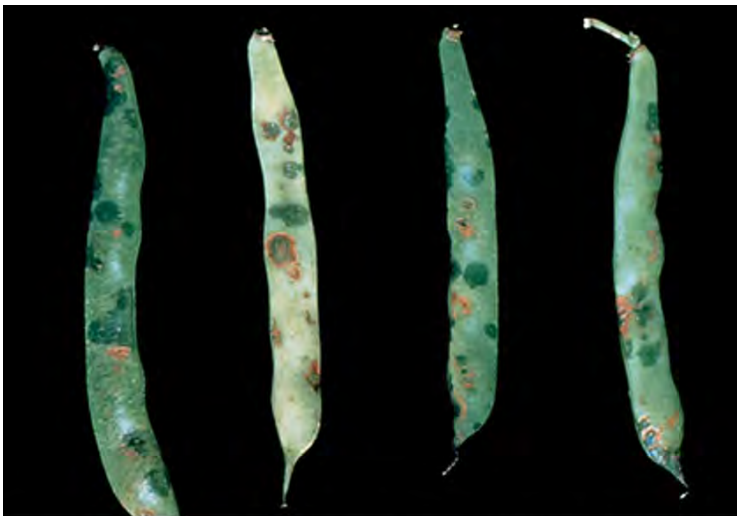
Figure 2. Symptoms of common bacterial blight on pods of bean, caused by Xanthomonas campestris pv. phaseoli . (Courtesy APS, J. R. Stavely, from the files of W. J. Zaumeyer).

appear to be burned. In severe infections, dead leaves remain attached to the plants at maturity. Bacteria ooze through stomata, providing inoculum for secondary spread.