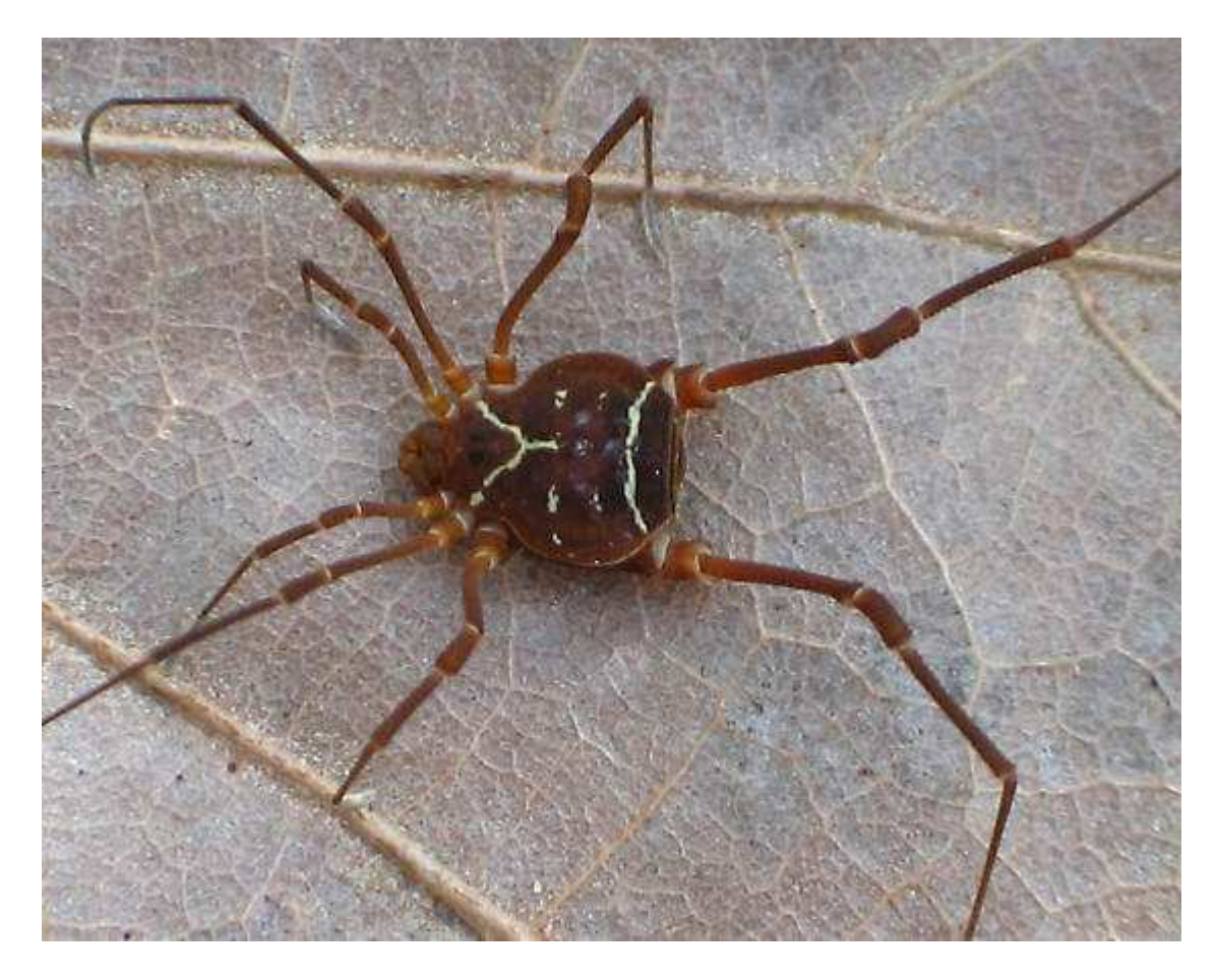
Figure 2 – Vonones ornate < http://bugguide.net/node/view/12435>