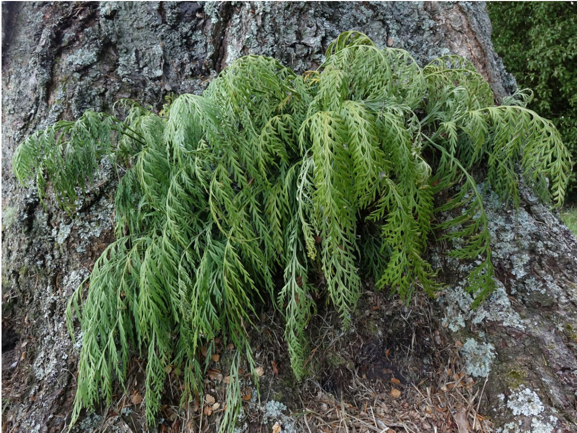
Asplenium flaccidum

Of the forty-six species of pendant ferns, fifty-two percent are endemic to New Zealand and forty-eight percent occur in other countries, the majority being located in Australia. Fortunately, the majority of New Zealand's epiphytic ferns are not threatened with only five species being classified as a 'at risk'. Hymenophyllums (filmy ferns) with over twenty species are the predominant epiphytic ferns in New Zealand.