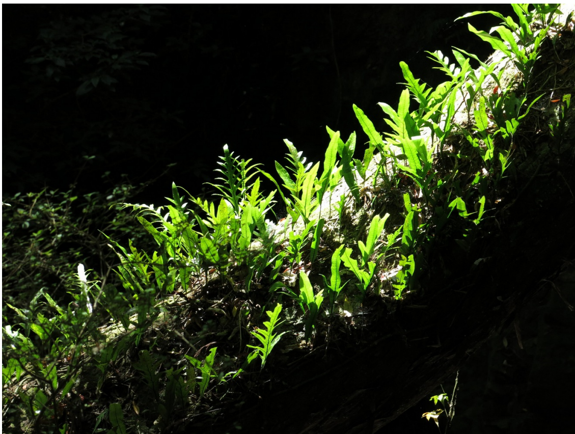
Microsorium pustulatum / hound's tongue fern

Commence life on the host plants trunk or branches, have creeping rhizomes that attach to the host plant's bark. Examples are Pyrrisia elegnifolia and Mircosorum pustulatum .