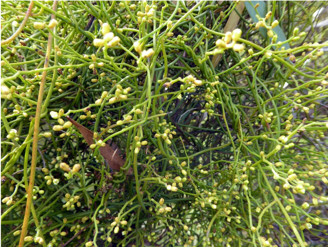
Cassytha paniculata

While there are a number of native plants that could be termed strange or unusual, e.g. Dactylanthus taylori (woodrose) and Ripogonum scandens (supplejack), Cassytha paniculata is quite unique in that it has no roots and no leaves! Along with its close relative Cassytha pubescens they are the only parasitic vines to be found in New Zealand.