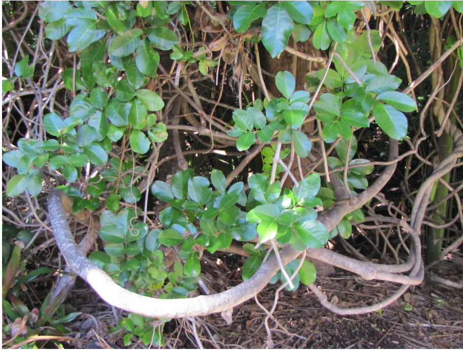
60 year old Tecomanthe vines

I looked around Fernglen for something pretty to photograph. A flowering plant perhaps? There aren't many flowers out in early April, but no matter, at any time of year we can see plenty of interesting features at Fernglen. I noticed a very silvery Astelia chathamica highlighted by the low afternoon sun. If you want a big bold colour contrast in your garden, a silvery Astelia would be ideal. But ensure you plant them at least 1 metre away from any paths to avoid tripping on the long leaves.