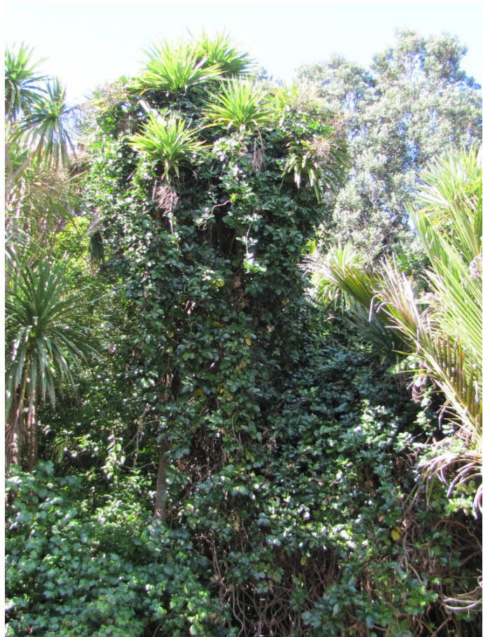
The 60 year old Tecomanthe vine 10 metres high in the top of a large cabbage tree

Our summer newsletter had a photo of large Tecomanthe seed pods, which are still maturing on the vine. Fernglen's five large Tecomanthe vines are an impressive feature, with an interesting history. They were planted at Fernglen in the 1950's, grown from cuttings collected in 1952 from a solitary surviving Tecomanthe speciosa vine on the Three Kings Islands 1 . After having been decimated by browsing goats, this solitary survivor was the only Tecomanthe speciosa plant left on planet Earth in 1952. Snatched from the jaws of extinction, there are now thousands of Tecomanthe offspring surviving all around NZ, all descendents of those few 1952 cuttings. However, Fernglen's large old Tecomanthe vines may well represent the oldest planting of Tecomanthe speciosa surviving on the main islands of NZ.