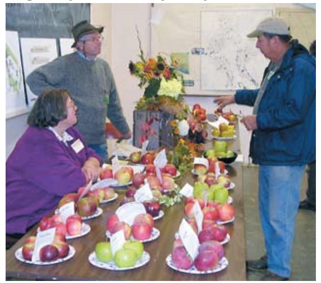
Figure 29. Harvest fruit display

In the case of most stone fruits, fruit is ripe for picking when it is beginning to soften and