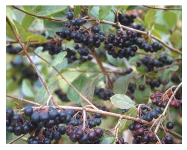
Figure 18. Aronia berries

Aronia ( A. melanocarpa ) is a native North American plant which was popularized as a crop in Eastern Europe and the former Soviet Union, particularly after World War II. The mature plants are similar in size to large blueberry bushes, and bear showy flat clusters of white bloom in spring, followed by pea size black berries, ripe in late fall. The dark berry clusters often contrast strongly with colorful red leaves.