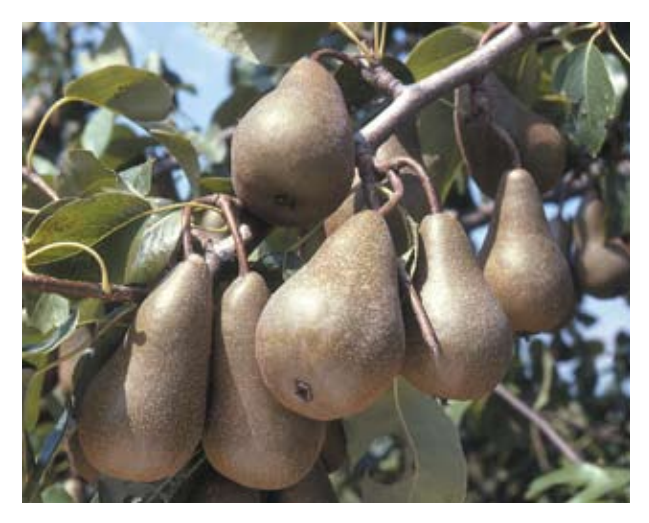
Figure 5. Bosc

less familiar in the U.S. Long pyriform fruit with russet skin patches, sweet flavor, used for cooking as well as dessert, excellent late keeper.