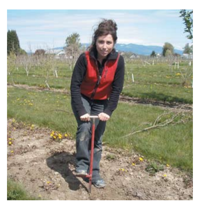
Figure 22. Taking a soil test

Remember that any sample is just a limited snapshot of the soil profile. The recommended