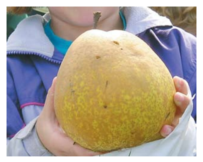
Figure 6. Mishirasu

Cultivated historically in China, Japan and Korea, originating from several pear species in eastern Asia, Asian pears ( Pyrus pyrifolia ) have gained recent popularity for fresh eating and for use in salads. Several varieties are well adapted to western Washington. They bloom earlier than European pears, so trees tend to be more sensitive to frost damage in early spring. Varieties are susceptible to bacterial infection ( Pseudomonas syringae pv. syringae ), so avoid pruning during rainy periods. Asian pears can be eaten fresh from