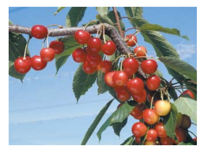
Figure 10. White Gold