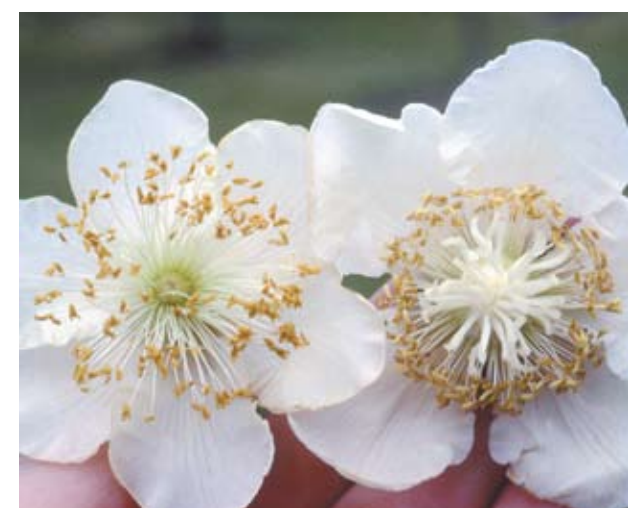
Figure 24. Male (L) and female (R) flowers of fuzzy kiwi (A. deliciosa)