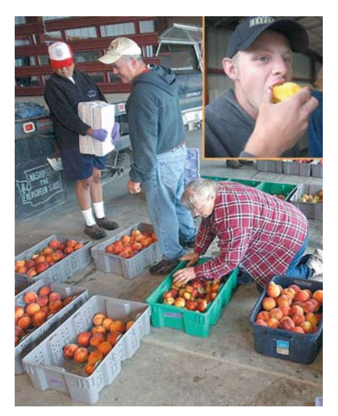
Figure 12. Peach harvest

In western Washington most peach varieties are subject to leaf curl, coryneum blight and brown rot, diseases which require fungicides or other methods for prevention and control. Low productivity can also be a serious problem, since cold wet weather at bloom time often results in poor fruit set. Nectarines tend to be even more susceptible to these problems and in addition often suffer from skin cracking and rot. Most peaches and nectarines are self fertile. The following varieties have been the most reliable over several years of trials: