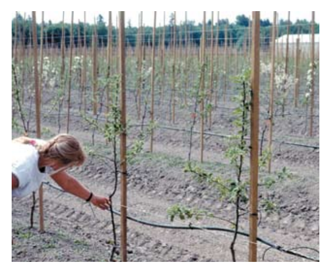
Figure 20. High-density row of apples on M9 rootstock

Training and support for trees is a factor in rootstock selection, since rootstocks with smaller, less vigorously growing roots need permanent support to keep the trees upright and maintain their fruit load. Also, some top varieties have a highly vigorous growth habit, while others are less vigorous. Even on a very dwarfing rootstock, a tree with highly vigorous habit will result in a larger tree at maturity than a less vigorous variety on the same rootstock. The combination of top and rootstock should be vigorous enough to provide good longterm fruit production, but not too vigorous to manage effectively. Optimum spacing for trees