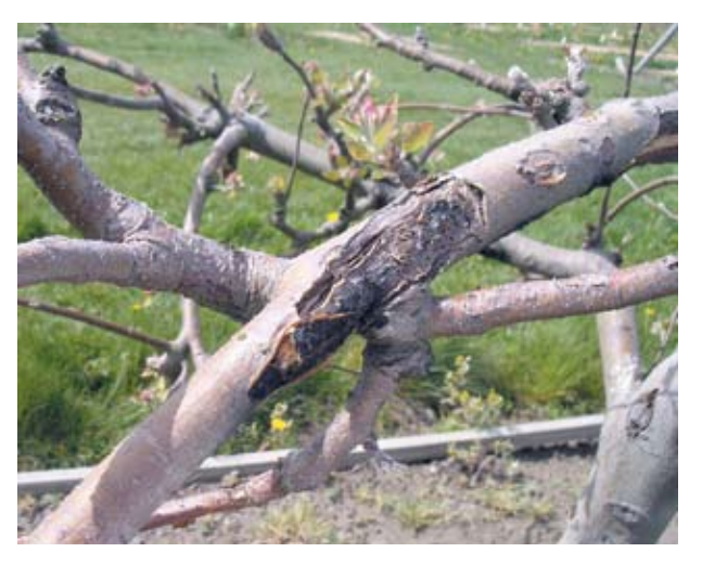
Figure 26. Anthracnose in diseased apple

Insects that do the most damage in home fruit orchards are apple maggot ( Rhagoletis pomonella [Walsh]) and codling moth ( Cydia pomonella ) in apples. Apple maggot is by far the most serious both because it completely destroys infested fruit, and because it is very difficult to control without the use of chemical pesticides. The responsibility of home orchard growers to prevent the spread of apple maggot is crucial.