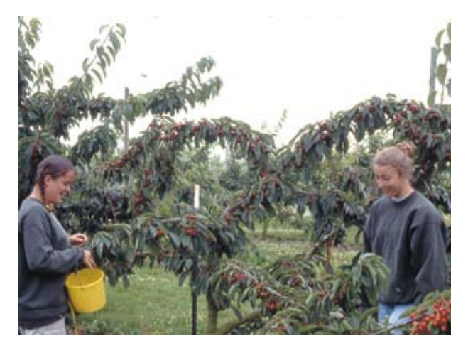
Figure 9. Lapins cherry on Gisela 5 rootstock

Cherry trees grafted on highly dwarfing rootstocks such as Gisela 5 are small (about 40% of standard) and can be kept below 10' in height. This allows trees to be netted for more effective bird protection, or even fitted with rain shelter to prevent cracking. The small trees can be pruned and harvested almost entirely from the ground, while producing high yields per unit area of orchard. When self fruitful varieties are