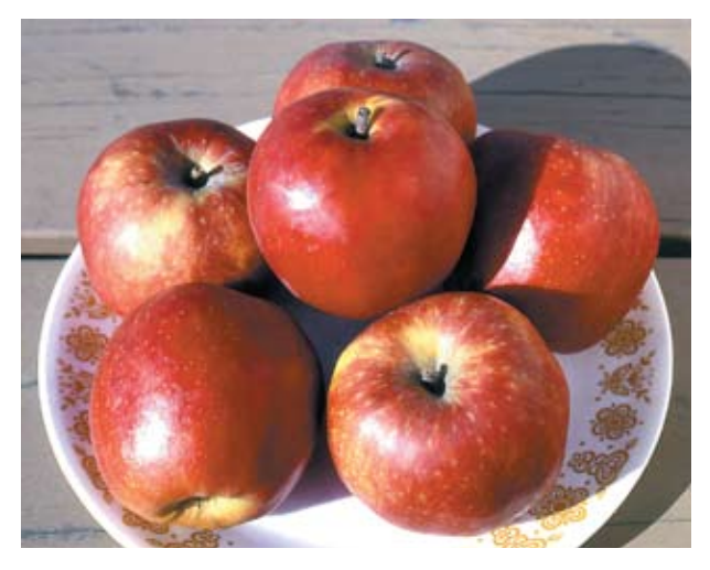
Figure 1. DeCoster Jonagold

• Akane—Ripe early to mid September. Bright red apple with distinctive flavor, productive, uniform, below medium size. Keeps better on the tree than in storage, can be picked for a