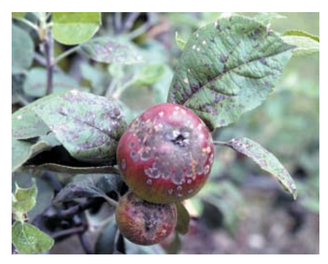
Figure 27. Apple scab