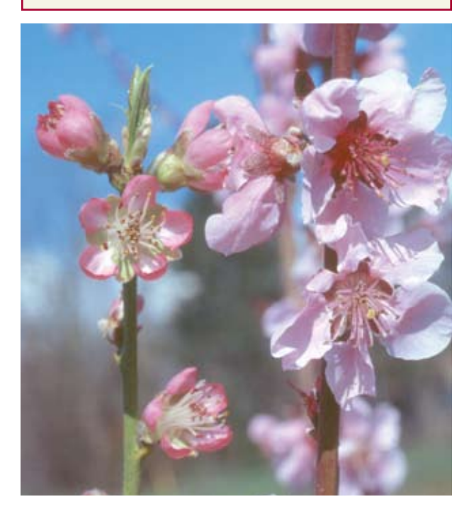
Figure 23. Non-showy (L) and showy (R) blooms of peach

When selecting peach and nectarine varieties, a further consideration is that the blossoms may be "showy" (large petals extending well beyond the sepals) or "non-showy" (small inconspicuous petals held within sepals). It is likely a showy bloom is more attractive to bees, in which case better pollination of showy-blooming varieties could result in greater overall productivity.