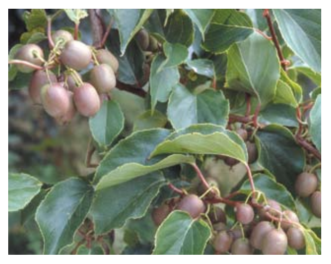
Figure 15. A. arguta 'Ananasnaja'

A. kolomikta (also known as Super-hardy kiwi or Manchurian gooseberry) is an extremely cold hardy species that produces edible fruit similar in flavor to A. arguta but smaller in size with an elongated shape. The vines are much less vigorous, but the plants are reported to thrive in our region, tolerating partial shade, and are