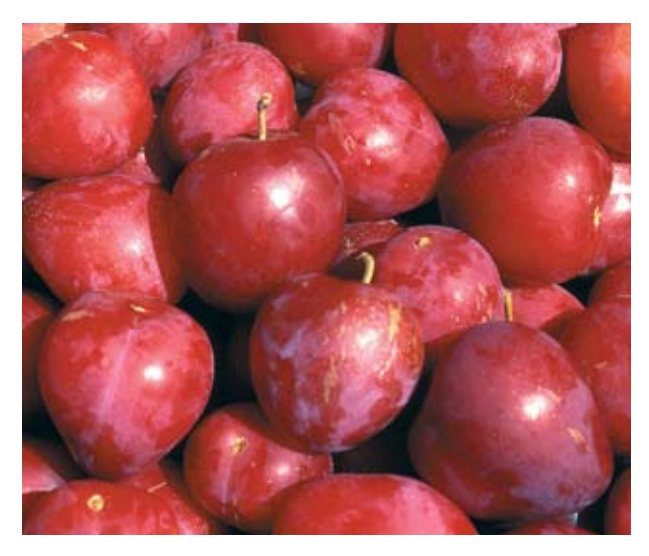
Figure 7. Beauty

• Hollywood—Ripe mid to late August. Dark red skin, red flesh, medium size oblong fruit, good quality. Good ornamental—edible, with abundant pink flowers and purple foliage, less productive than some.