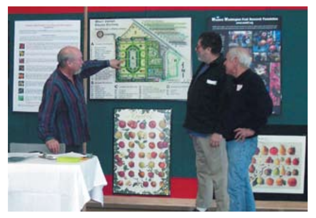
Western Washington Fruit Research Foundation (WWFRF) educational display.

Western Washington Fruit Research Foundation members gather for a fall tour of Washington State University Mount Vernon's Northwestern Washington Research and Extension Center (NWREC) orchards.