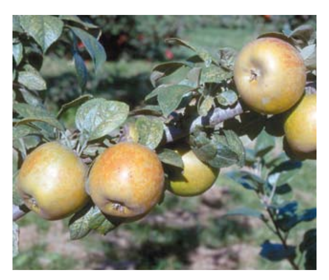
Figure 4. Golden Russet

For more information on varieties and cider making, see the Mount Vernon link at http:// mtvernon.wsu.edu/frt_hort/ciderapples.htm and check the Northwest Cider Society web site at http://www.nwcider.org/.