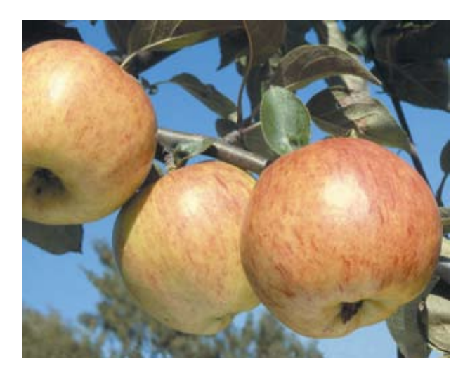
Figure 3. Gravenstein

Disease resistant apples are immune to most races of apple scab, and some have good natural resistance to other diseases. However, they can