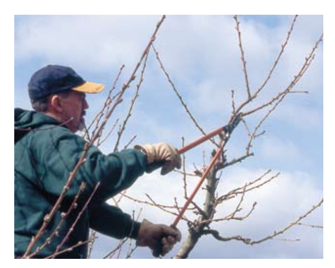
Figure 25. Pruning