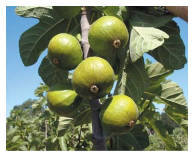
Figure 19. 'Desert King' fig

particularly when young, and productivity is limited. In western Washington successful varieties produce a "breba" crop that overwinters as a pea size fruit and ripens in August. Desert King is one of the most reliably productive varieties, and Brunswick (Vashon Violet),<sup>4</sup> Neveralla , and Brown Turkey have consistently produced summer crops. Typically, most varieties produce a substantial fall crop that frustratingly does not ripen in our climate. Covering the plants with a clear plastic roof or tent would help to ripen the fall crop by holding in the radiant heat of the sun. Otherwise, it is best to remove these unripe fruits at an early stage.