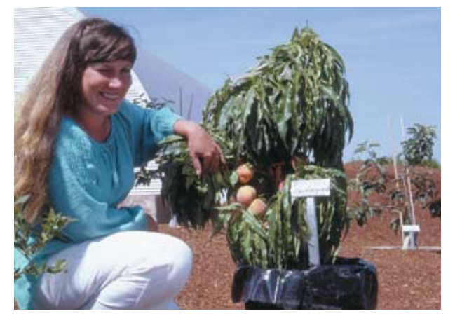
Figure 21. Genetic dwarf peach