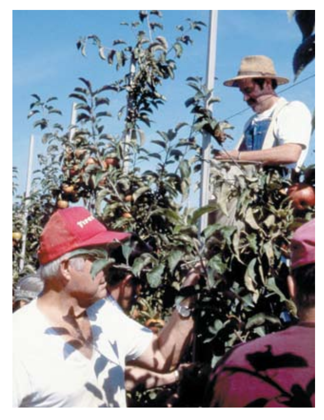
Figure 31. Apple picking

After picking, fall pears can be kept on a shelf at room temperature until ready to eat—when yellow color develops and the fruits begin to soften. Be sure that the area isn't too warm or internal browning may occur. Even in refrigerated storage, fall pears usually do not keep for more than 4–6 weeks. Many people use their fall pears for canning and drying. Winter pears benefit greatly from being put into cold storage (below 40°F, down to 33°F) for about 3 weeks. After that period, you can start to bring out fruit as needed to soften up at room temperature. With good storage around 32°F, winter pears can be kept for 3–4 months.