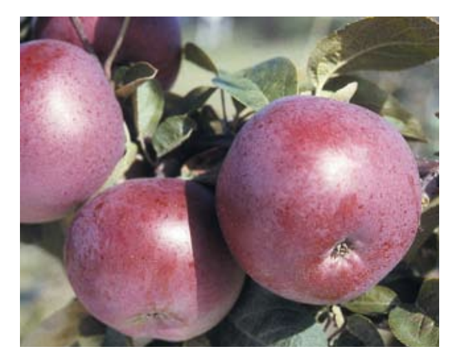
Figure 2. McIntosh

• McIntosh sports —Usually variations selected for better red color. Most are ripe in mid September. Trees are moderately to very productive.