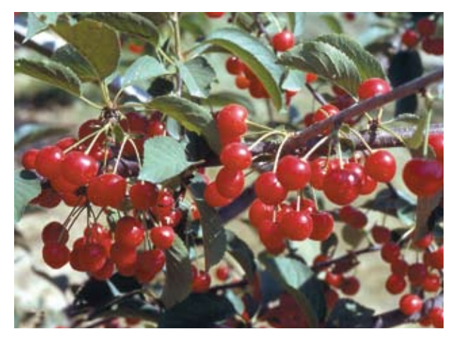
Figure 11. Surefire

• Hudson—Ripe early August. A late dark red cherry well established in eastern U.S. orchards. Tends to be slow to get into production, but on Gisela 5 it may improve. One of the last varieties of the season.