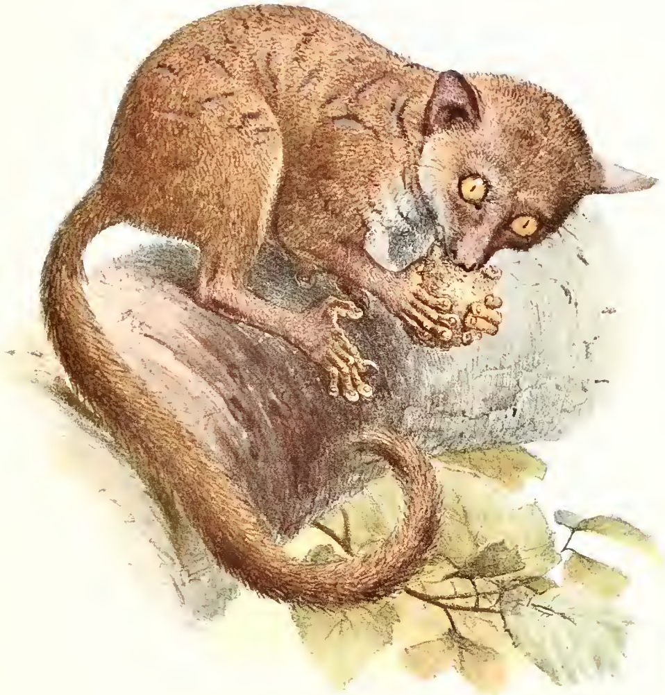
HEMIGALAGO DE MIDOFFI