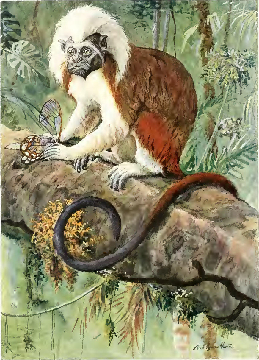
SENOCEBUS METICULOSUS ELLIOT.