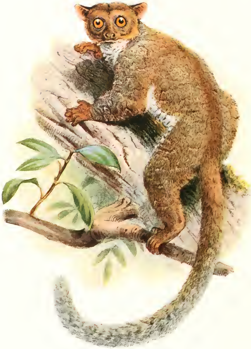
GALAGO ELEGANTULUS PALLIDUS