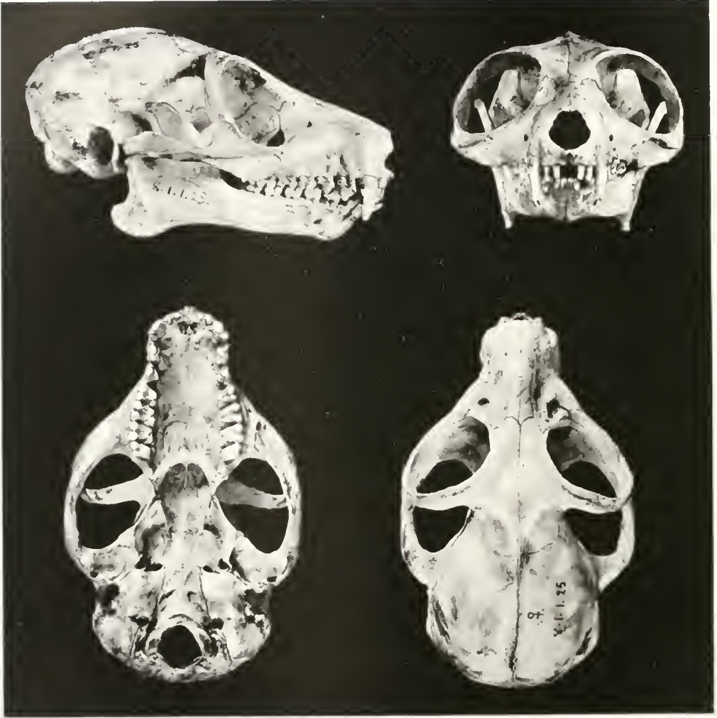
GALAGO CRASSICAUDATUS. No. S1125 Brit. Mus. Coll. Nat. Size