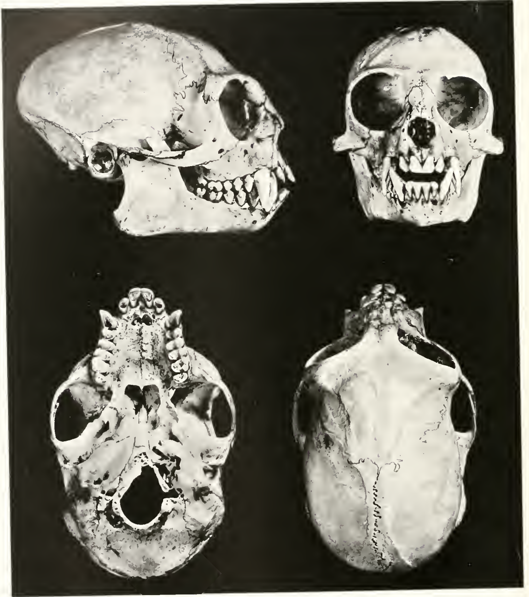
SENOCEBUS METICULOSUS ELLIOT.

No. 22703 Amer. Mus. Nat. Hist. Coll. Type. 1\frac{1}{2} Nat. Size