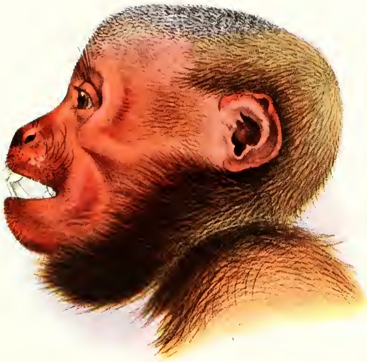
CACAJAO RUBICUNDUS (Head)