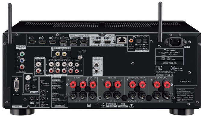
SC-LX501(B) UPC: 889951000174