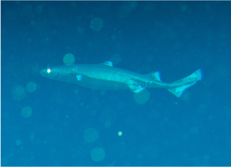
Roughskin dogfish ( Centroscyrnus owstonii ) 600m (ACEP, Deep Secrets)