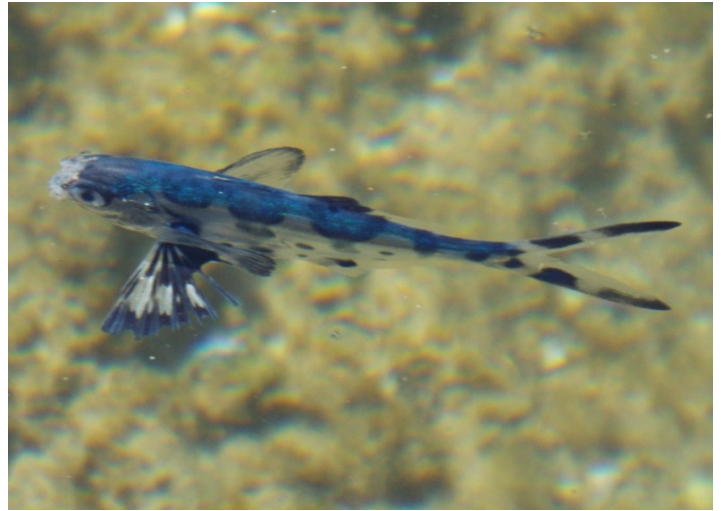
Bluebottle Fish ( Nomeus gronovii ) Danie Fouche

Bluebottle fish do not use mucus to protect themselves from the stinging tentacles of their host like other species but rather actively avoid touching the tentacles! They do have a very complex skin design and at least one antigen to the toxin and have a high number of flexible vertebrae possessed that are thought to allow them to be agile enough to avoid being stung. The risk of being stung is obviously compensated for the protection they receive from the same stinging tentacles!