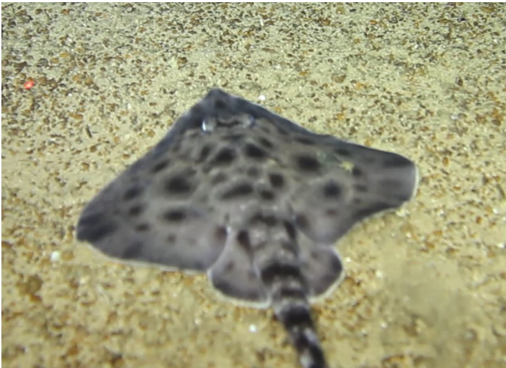
Hulley's skate ( Cruriraja hulleyi ) 550m (ACEP Deep Secrets)