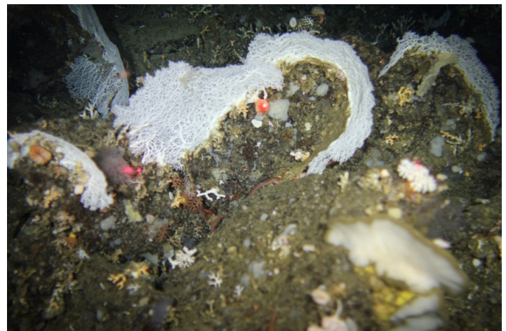
Stylasterine lace corals at 300m

look for gas bubbles. Sampling in this deep water environment is extremely tricky especially with the tricky and unpredictable weather of the cape thrown in. Despite challenged the sampling revealed a suite of hard ground, coral rubble, coral mound, sandy, gravel and other ecosystem type. This project was the deepest exploration by visual tools in South Africa with first images from 1035m and they managed to document South Africa's first deep-water coral habitats, with a mix of live scleractinian corals, octocorals, stylasterine corals, sponges, bryozoans and tunicates. Enjoy the pictures on the next page of some of the deep water fish photographed by the team.