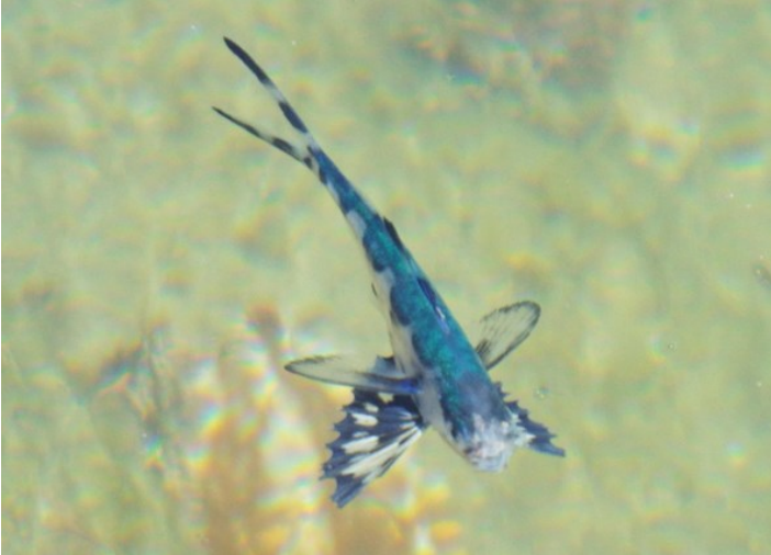
Bluebottle Fish ( Nomeus gronovii ) Danie Fouche

Danie Fouche spotted this juvenile bluebottle fish, Nomeus gronovii at Gereckes punt in Sedgefield in February. He managed to capture these pictures which is fantastic as these fish are notoriously difficult to photograph. Young bluebottle fish like this one are pelagic and live among the tentacles of the blue bottle. This is the only species in the genus Nomeus which are part of the driftfish family Nomeidae.