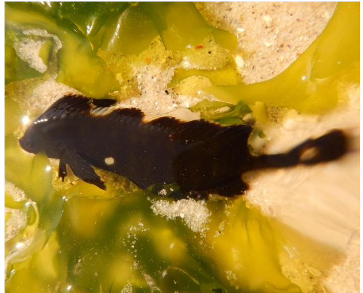
Leafy klipfish ( Smithichthys fucorum ) by Eleanor Yeld Hutchings

the tide receded and wasn't covered by water at all. I picked it up and popped it back into the water where it swam into the seaweed".