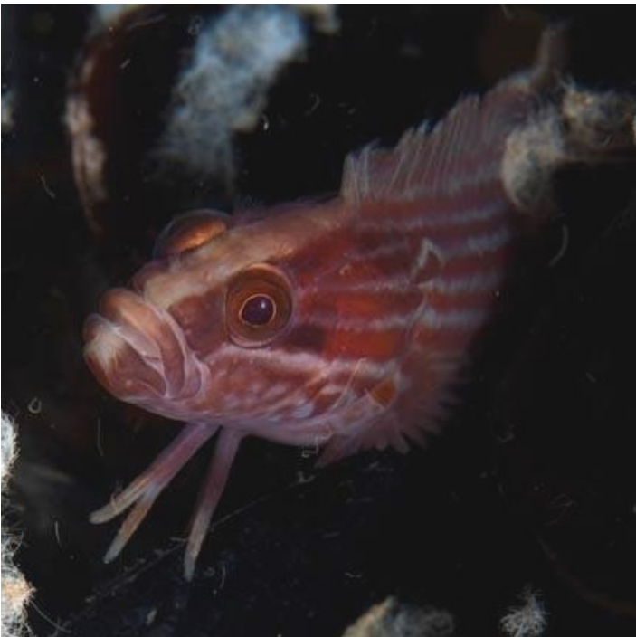
Stripe klipfish ( Blennophis striatus ) Georgina Jones

The klipfish opposite is a leafy klipfish Smithichthys fucorum . The picture was taken by Eleanor Yeld Hutchings and she had the following to say about the sighting, "we were just rock-pooling, at Dalebrook, near the Brass Bell end of the beach (about 20-30 m before the end of the sand stretch). It was in the large shallow lagoon pool between the outer rock reef and the inner rocks, which was exposed beautifully on the amazing low tide. The fish was actually lying in the ulva that was exposed to the air when