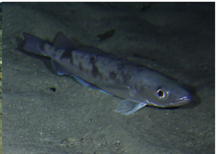
Cape hake ( Merluccius sp.) at 490m (ACEP Deep Secrets)