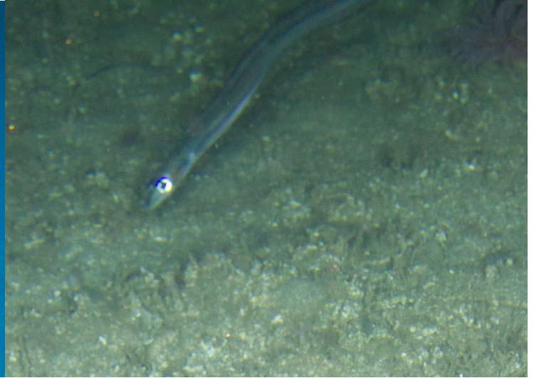
Ribbonfish ( Lepidopus caudatus ) 300m (ACEP, Deep Secrets)