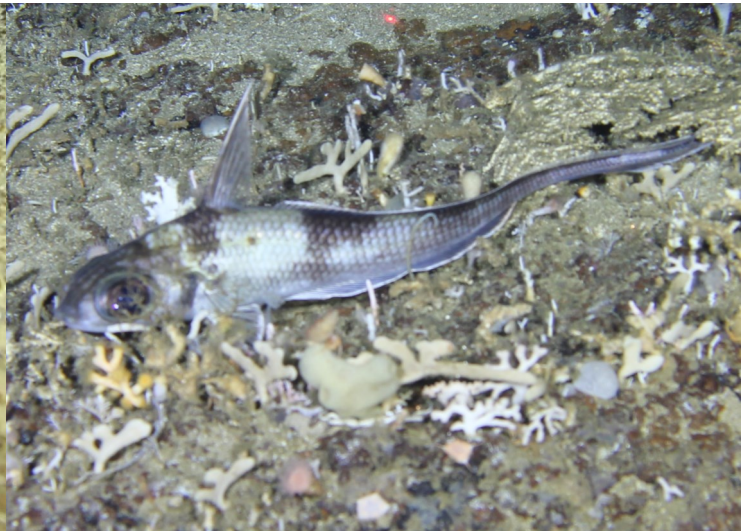
Coelorinchus coelorinchus 340m (ACEP, Deep Secrets)