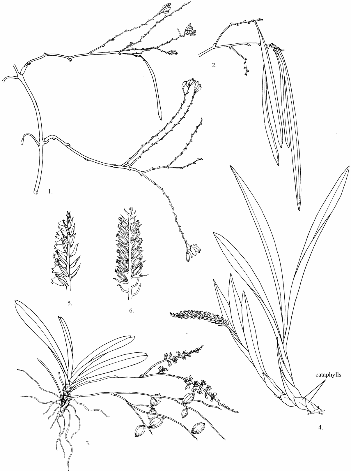
Figure 4. 1–6. Examples of plants in the subfamilies of the Orchidaceae. 1–2. Vanilloideae ( Erythrorchis altissima ). —1. Habit. —2. Capsules. 3. Epidendroideae ( Cleisostoma linearilobatum ). 4–6. Epidendroideae ( Cryptochilus luteus ). —4. Habit. —5. Inflorescence. —6. Infructescence.