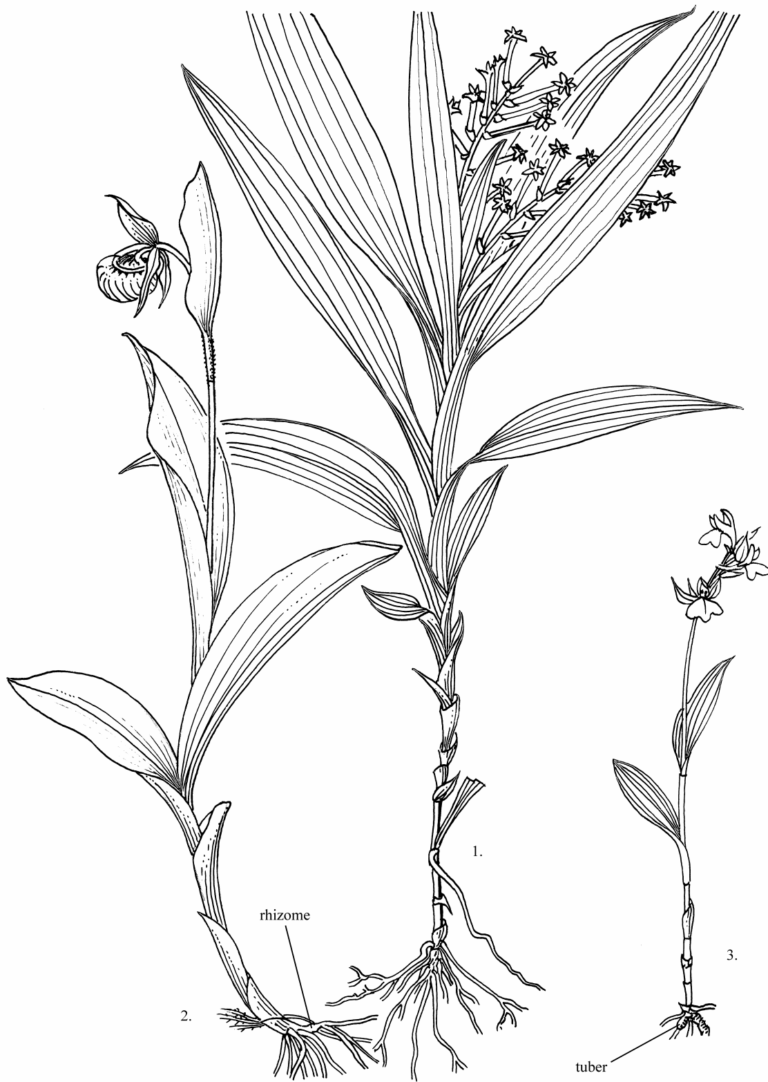
Figure 3. 1–3. Examples of plants in the subfamilies of the Orchidaceae. —1. Apostasioideae ( Apostasia wallichii ). —2. Cypripedioideae ( Cypripedium yunnanense ). —3. Orchidoideae ( Ponerorchis chusua ).