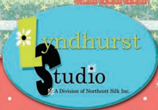
20½" x 56½"