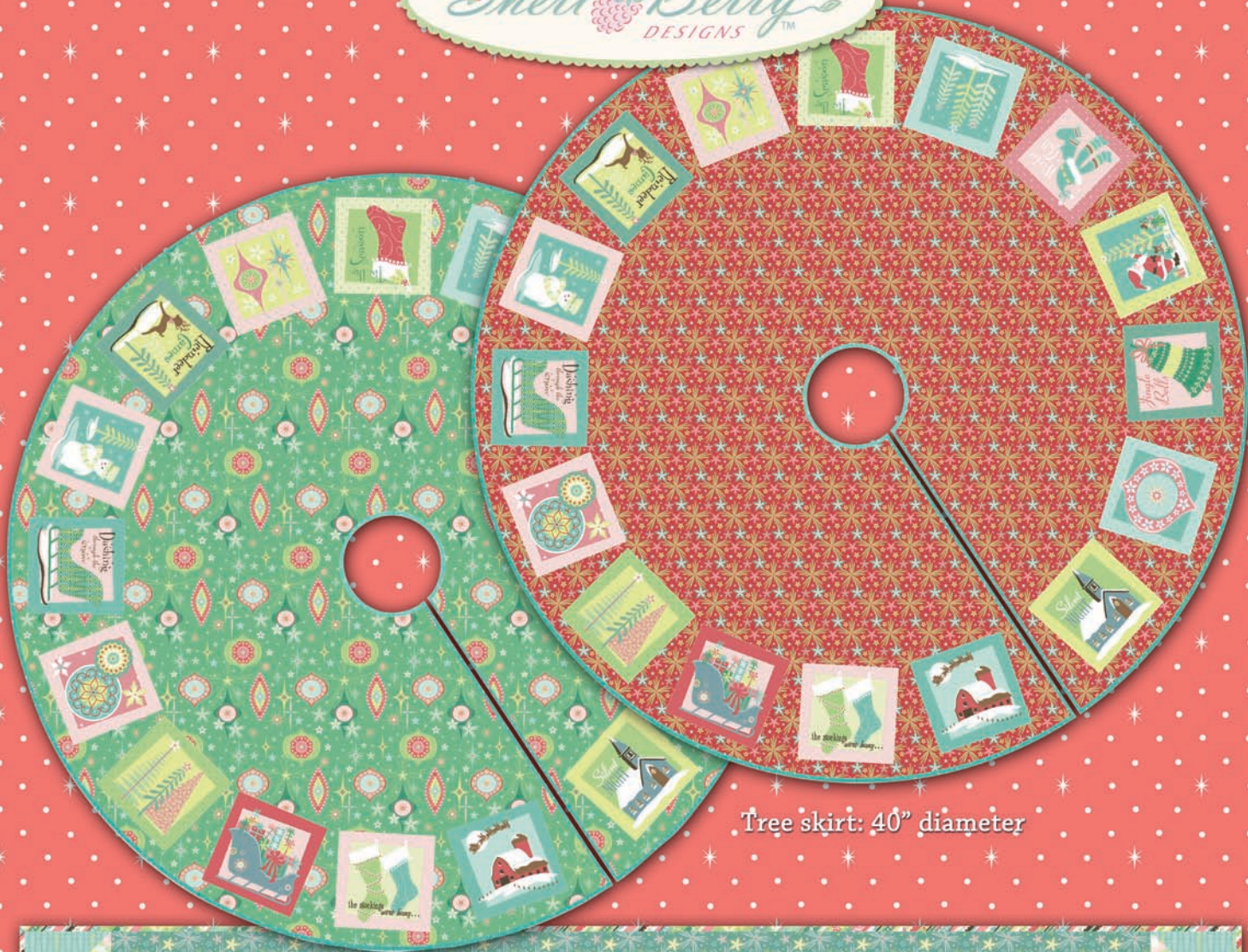
Tree skirt: 40" diameter