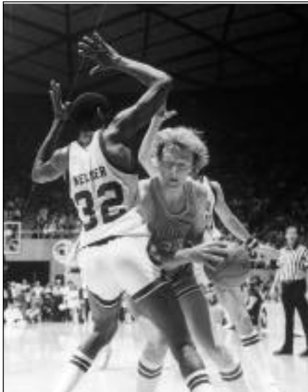
Larry Bird led Indiana State to the nation's No. 1 ranking in the Associated Press and the United Press International polls heading into the 1979 tournament. The Sycamores lost in the championship game to Michigan State, a team led by Magic Johnson and Greg Kelser, pictured guarding Bird.