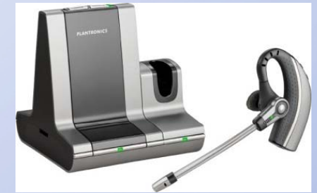
Savi Office Range