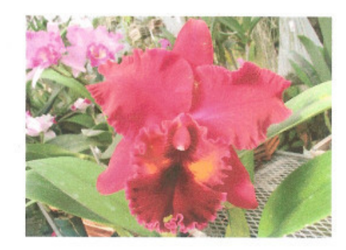
PLEASE INVITE YOUR PLANT LOVING FRIENDS.