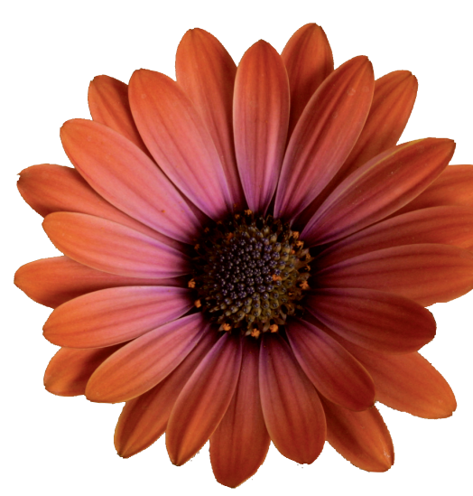
Osteospermum Astra Orange Sunrise

The new Akila series from PanAmerican Seed is the most compact seed osteospermum series available. It is well suited to mechanized production and high-density programs. Plants