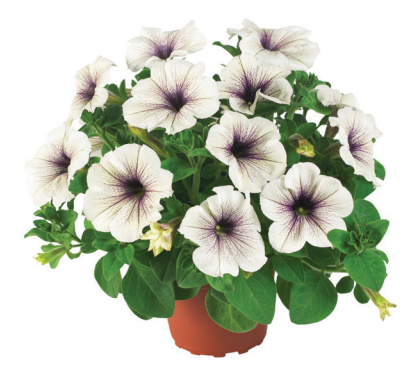
Petunia Fortunia Silver Vein

the Mariposa series. Plants have loads of flowers and robust stems that enhance overwintering performance.