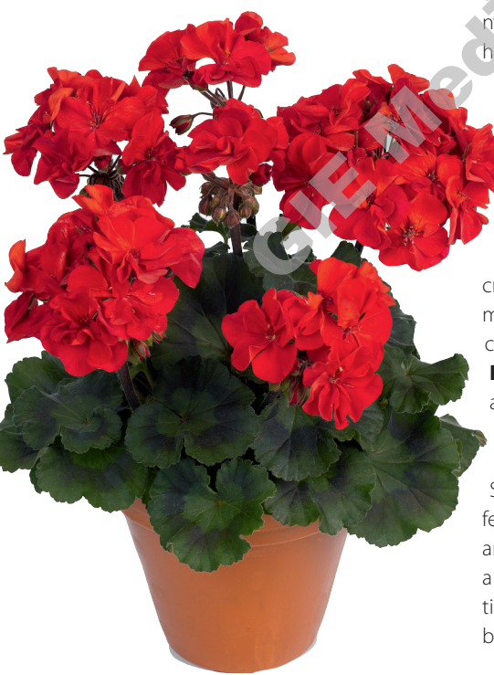
Geranium Darko Deep Red

The interspecific Frenza series is a Ball