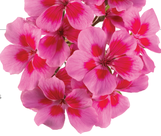
Geranium Pop Idols Lilac with Eye

Fantasia Dark Red is the darkest red zonal geranium on the market. Its excellent uniformity allows more plants per square foot and optimizes shipping density. The dark green foliage contrast