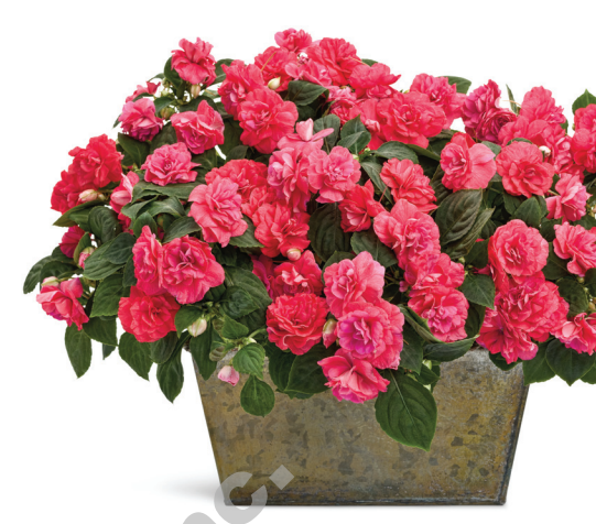
Impatiens Rockapulco Coral Reef

Audray White brings this American Takii series to a total of four varieties, including Bicolor Rose, Pink and Purple. Plants, which have excellent basal branching and withstand hot and humid conditions,