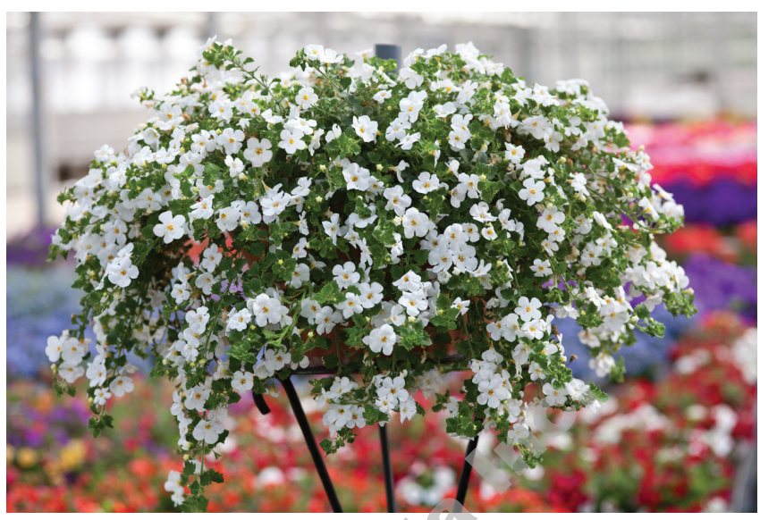
Bacopa Taifun White Wedding