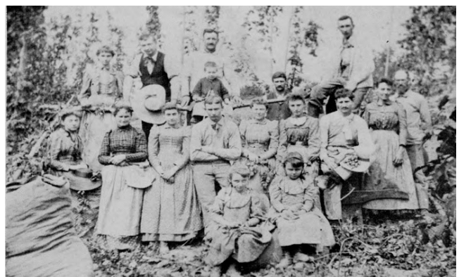
Hop Picking, Patrie Farm, Janesville, about 1895.