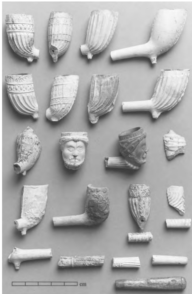
Pipes from the J. Reed Site, Gilboa, NY: