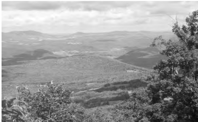
7. The yellow trail is a quarter mile long and loops back to the Long Path trail. Hikers continuing on the yellow trail will have a westerly view that includes a large portion of Schoharie County. Mount Utsayantha can also be seen from this point.