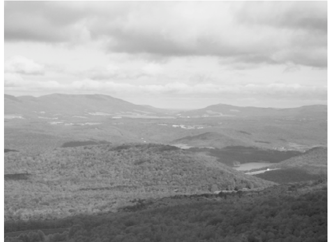
3. Part way up the mountain there is an opening from a ledge with a westerly view looking into Schoharie County. The Gilboa Reservoir can be seen from this point.