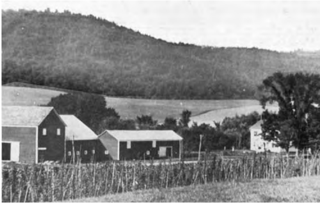
The Hynes Farm, Hyndsville, 1910.