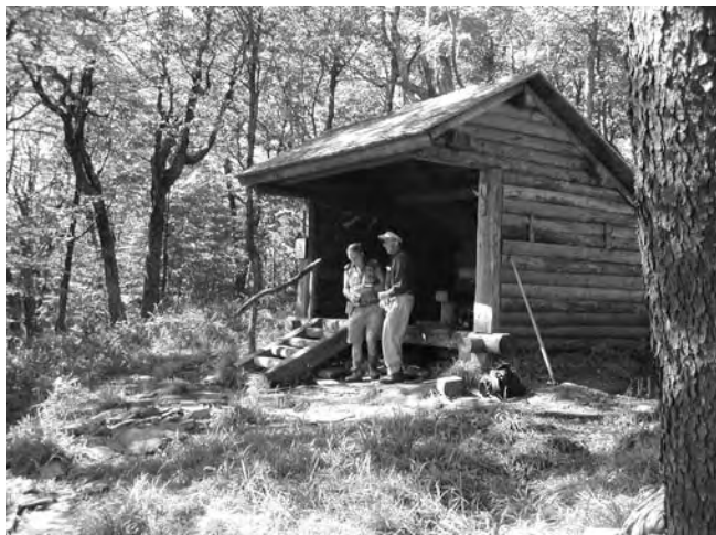
5. Huntersfield Mountain Lean-to is a great place to take a break from the hike up the mountain. The lean-to was built and the views cleared by the inmates from the Summit Shock Camp.