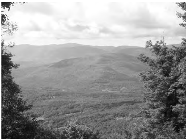
6. Looking south from the lean-to, hikers can view some of the higher peaks of the Catskills. Hunter Mountain and Slide Mountain can be seen from here.