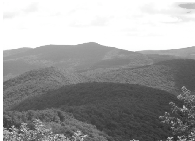
4. On top of Huntersfield Mountain there is a yellow trail that leads to a lean-to. Before the lean-to, there is a nice view to the east showing the ridge line the Long Path follows to Ashland Pinnacle.