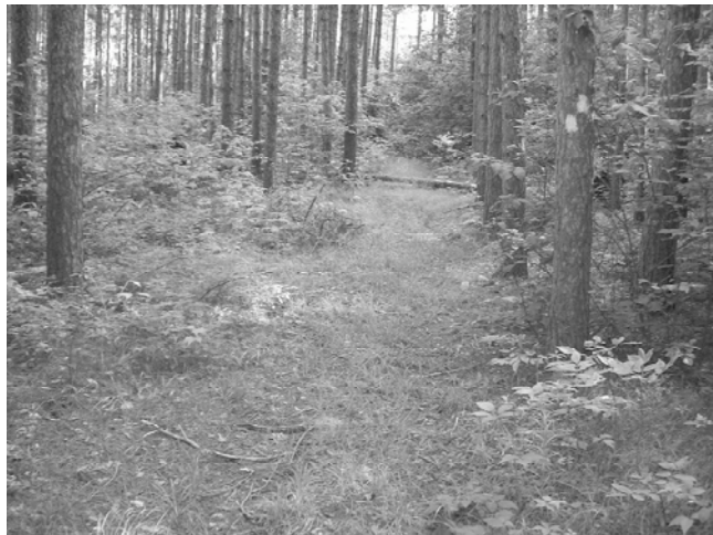
2. Shortly after leaving the parking lot, the trail intersects an old wood road. It continues on this road for about a half of a mile before turning sharply uphill. This picture shows the Long Path's trail marking indicating the right turn heading up the mountain.