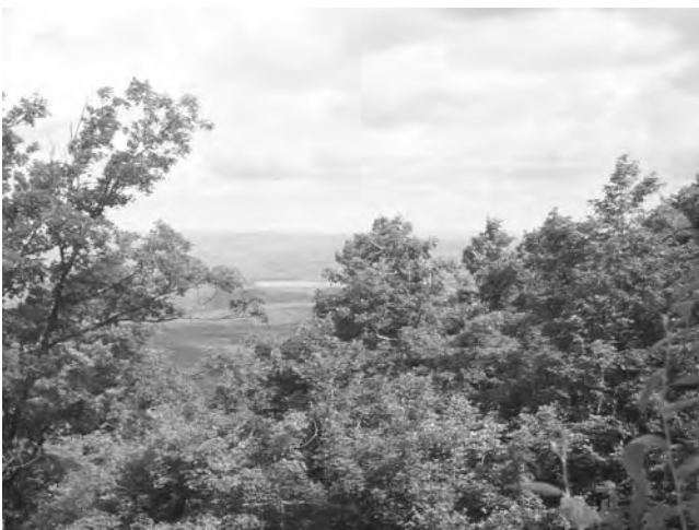
8. The Power Authority's upper reservoir of the Blenheim-Gilboa pump storage complex is also part of the view. After returning to the Long Path from the loop trail, hikers will return to Macumber Road or continue east past Ashland Pinnacle to Bluebird Road in the town of Conesville.