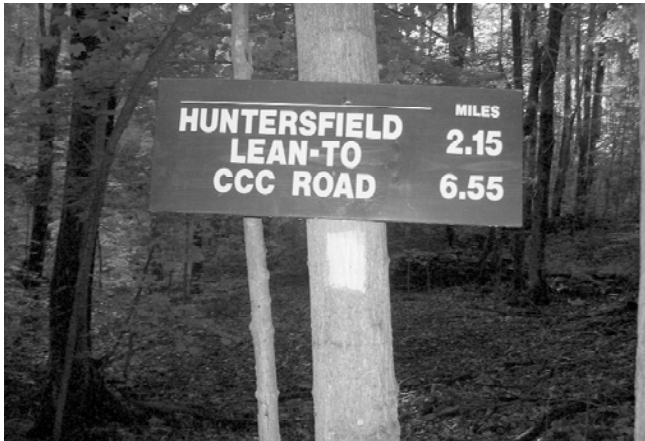
1. From the parking area at Macumber Road to the peak of the mountain is 2.15 miles. Macumber Road is accessed from Greene County Routes 10 and 11 out of Prattsville.

The trail to the mountain is on the Huntersfield State Forest, which is administered by the Department of Environmental Conservation. The trail is maintained by volunteers from the NY/NJ Trail Conference and from the Long Path North Hiking Club.