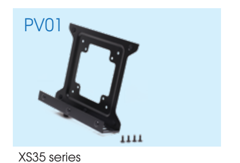
VESA mount accessory for all XS35 series models