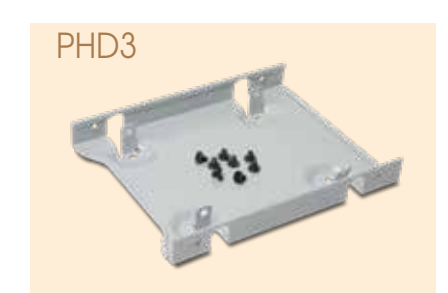
XPC-cube series 3.5" to 2.5" HDD rack for XPC cube series