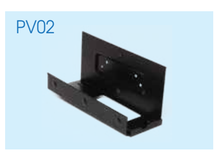
VESA mount accessory for 3-liter Slim PCs