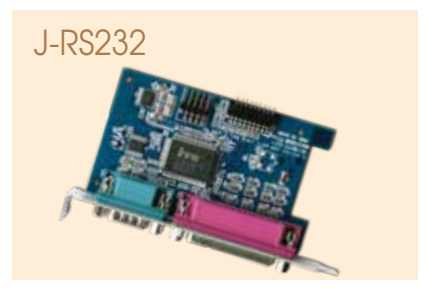
XPC-cube series RS232 daughter board for XPC cube series